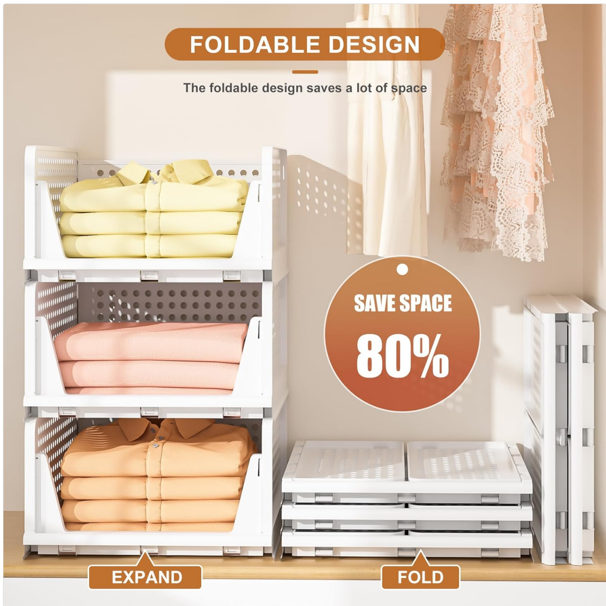
Image 3.1: Foldable design for space-saving storage when not in use.