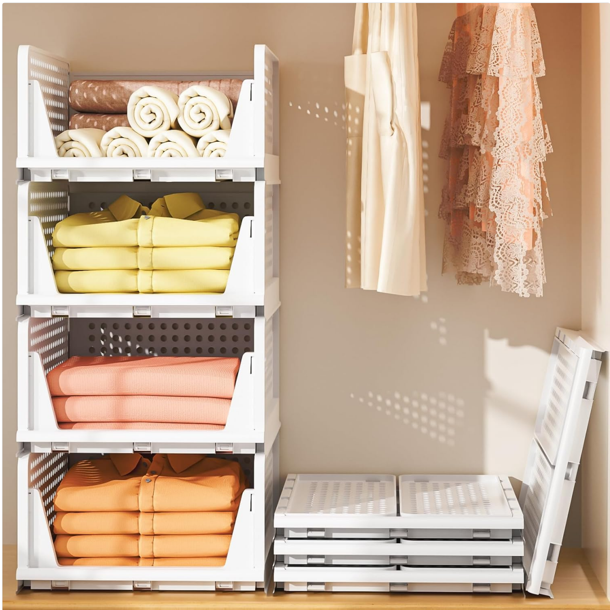
Image 1.1: Neprock Stackable Plastic Storage Drawers in a closet setting.