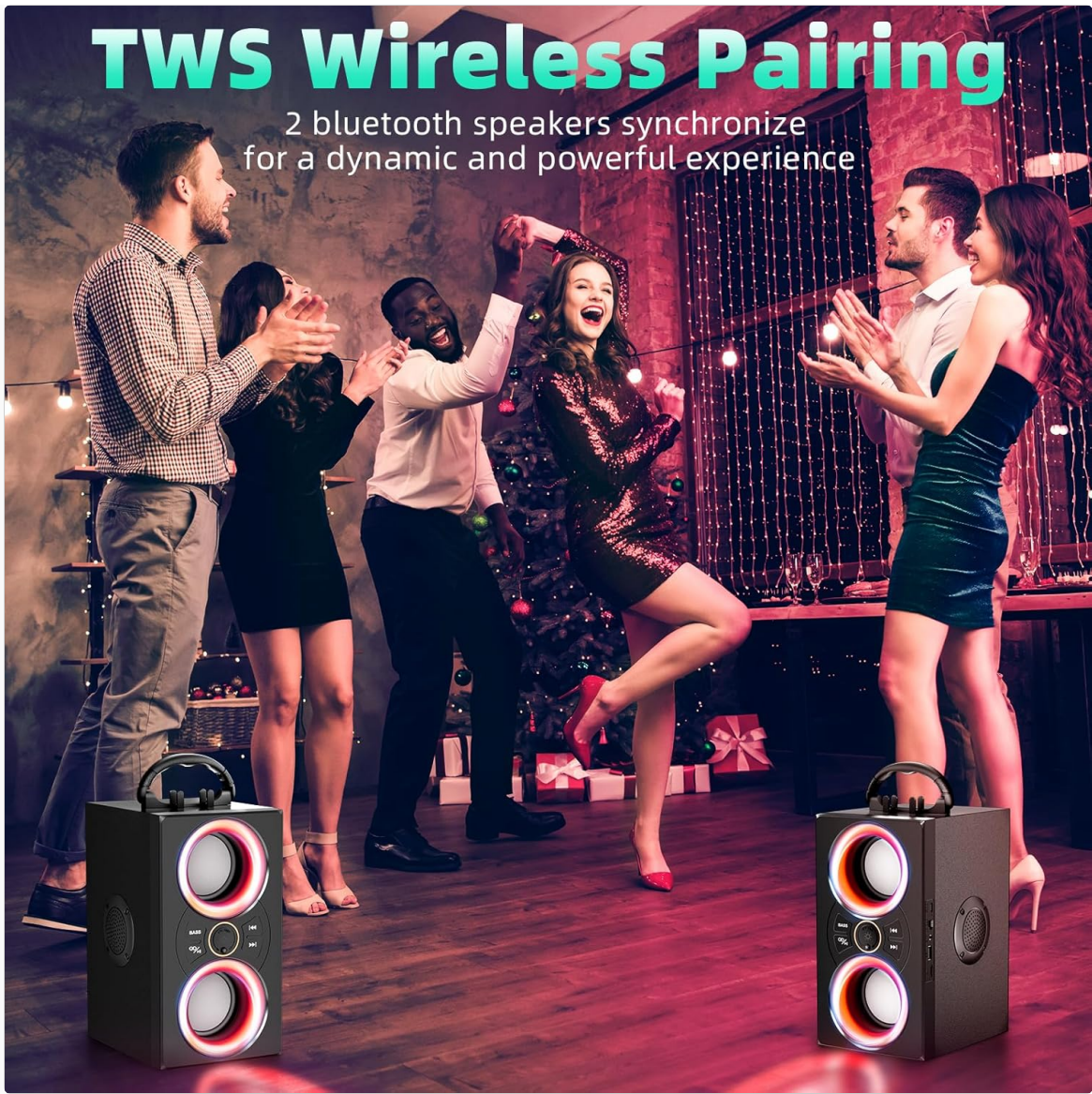
Image: Two DINDIN speakers demonstrating TWS wireless pairing for a dynamic and powerful stereo experience in a party environment.

2 bluetooth speakers synchronize for a dynamic and powerful experience