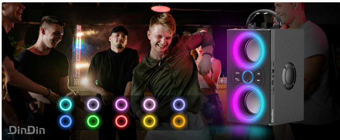
Image: A visual representation of the speaker's dynamic LED light effects, showing different color patterns and their rhythmic movement.