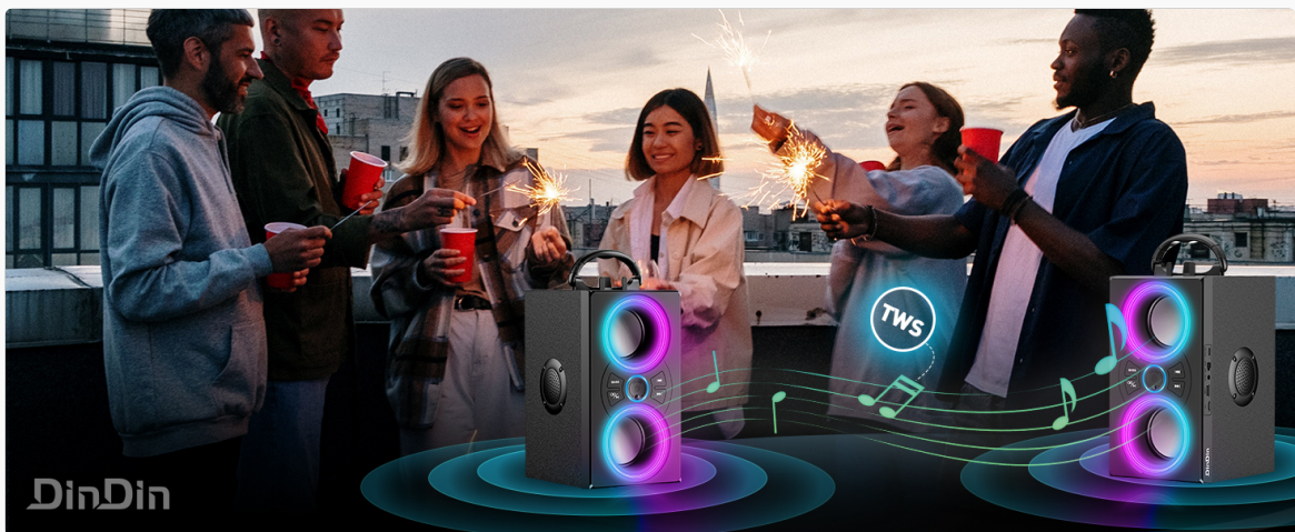
Image: Visual representation of the True Wireless Stereo (TWS) pairing process, showing two speakers connecting wirelessly to each other.