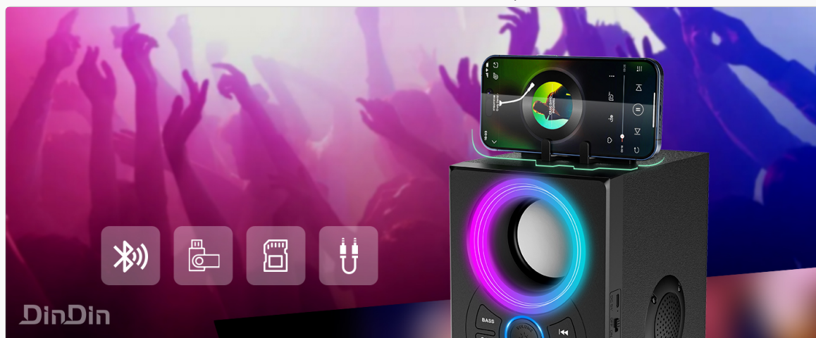
Image: Graphic illustrating the various connectivity options available on the speaker: Bluetooth, USB drive, TF card, and 3.5mm AUX.