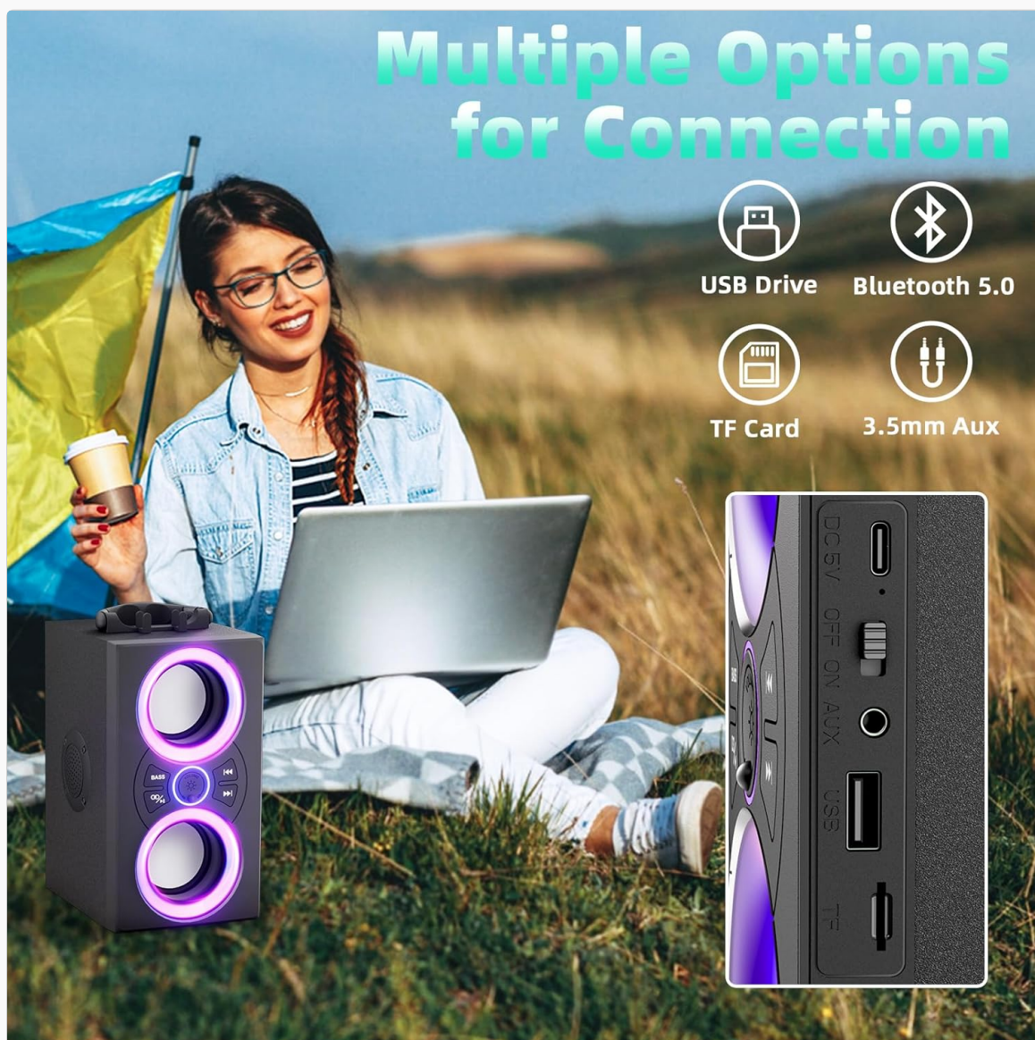
Image: The side panel of the DINDIN speaker displaying its multiple connection options including USB, Bluetooth 5.0, TF Card, and 3.5mm Aux input.