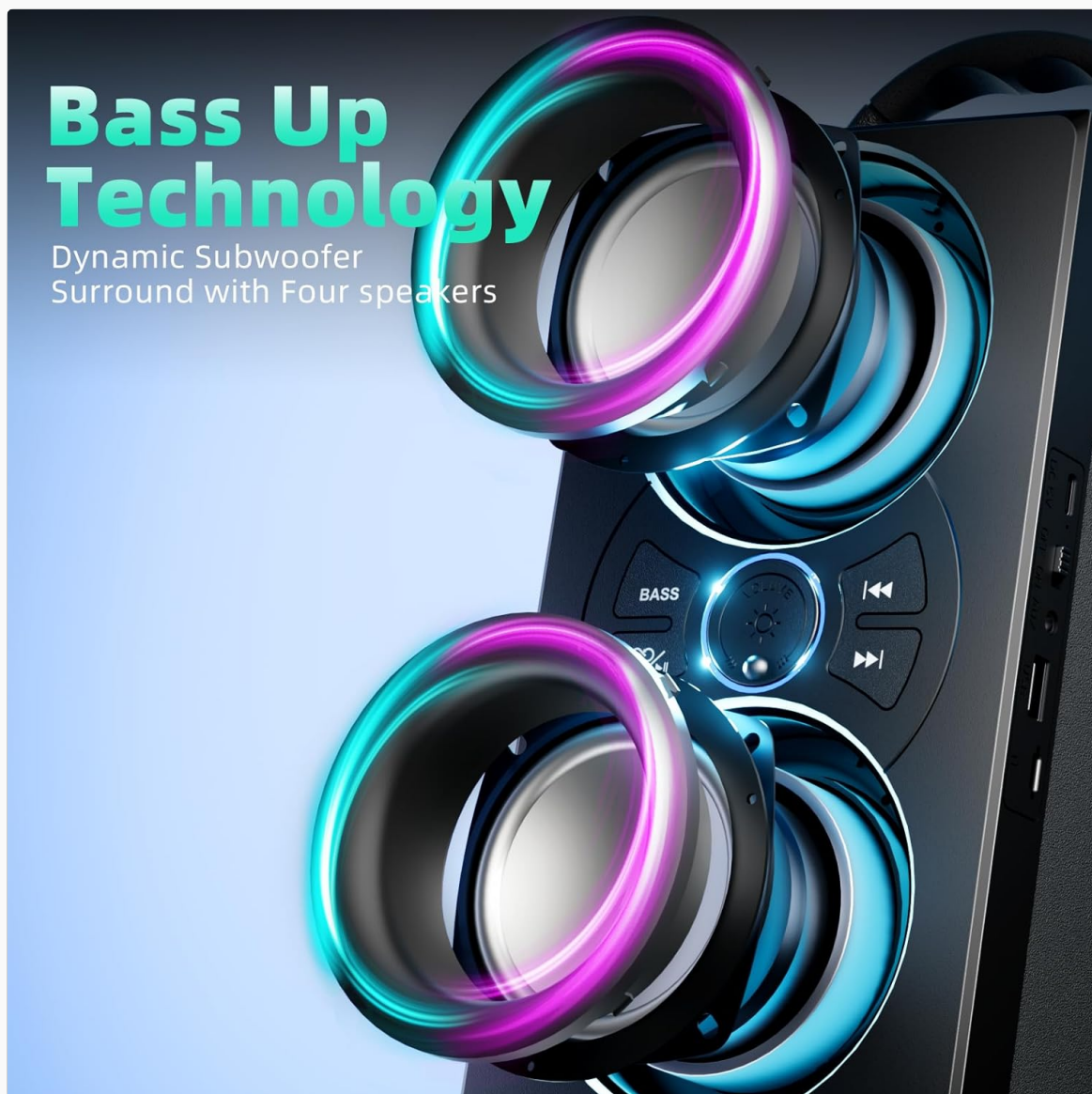
Image: Exploded view of the speaker highlighting its internal components and "Bass Up Technology" for enhanced sound.