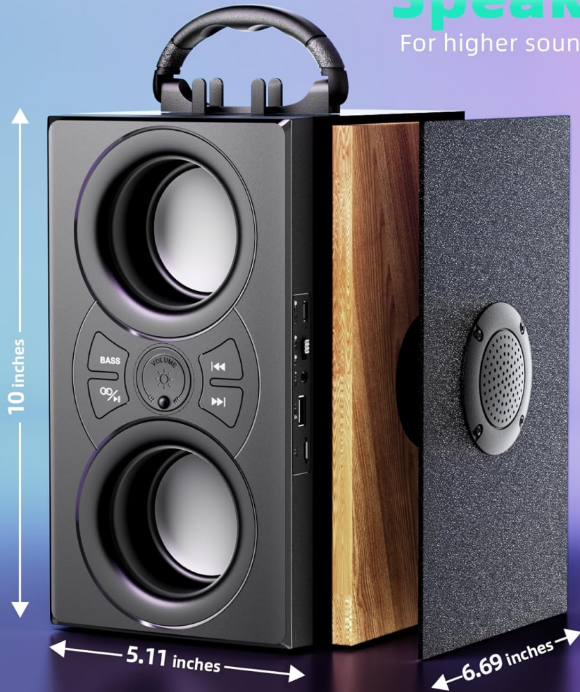
Image: The DINDIN speaker highlighting its compact dimensions and wooden construction, emphasizing its portability.