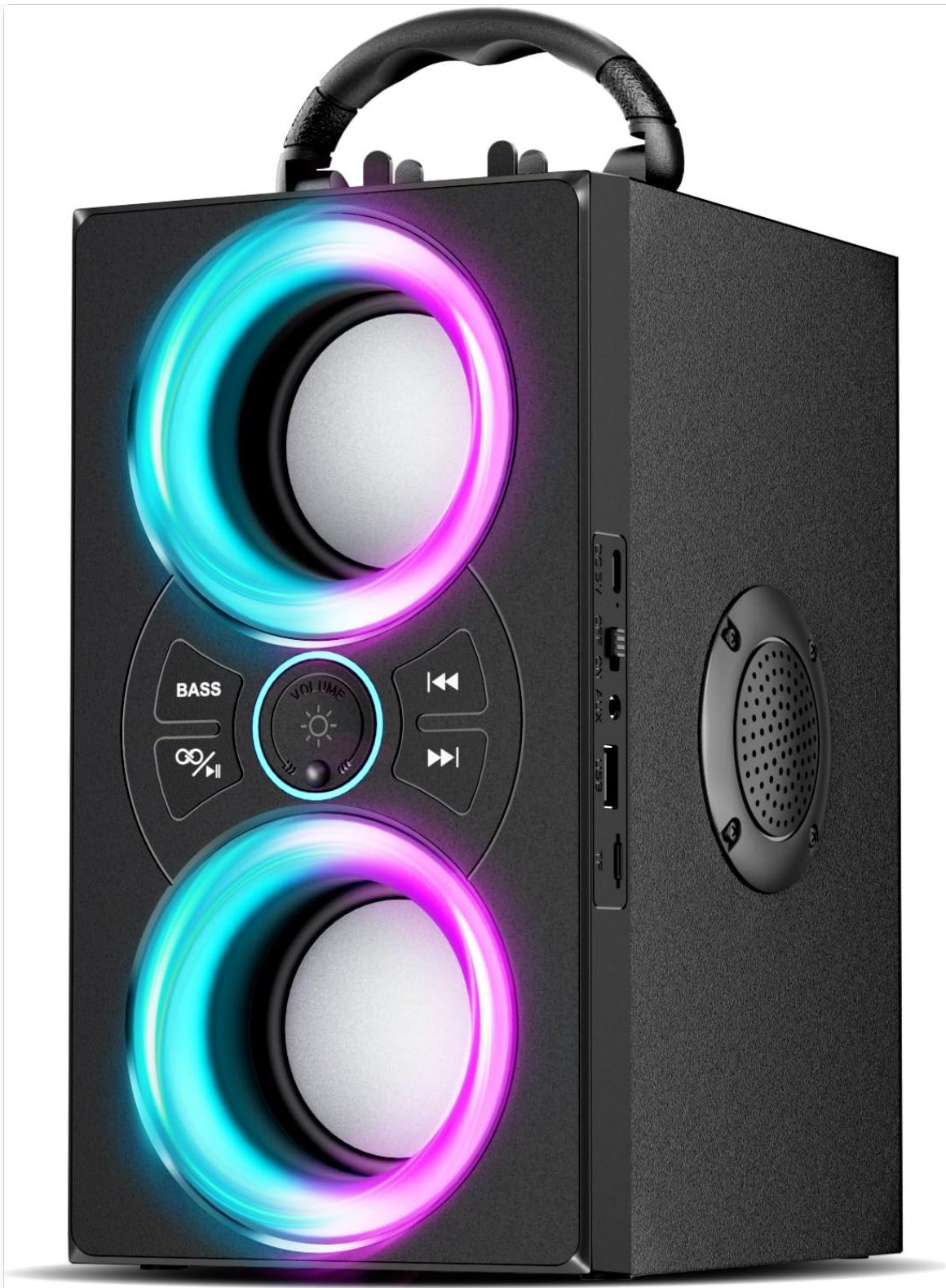
Image: Front view of the DINDIN Bluetooth Speaker showcasing its dual speakers with vibrant LED light rings and control panel.