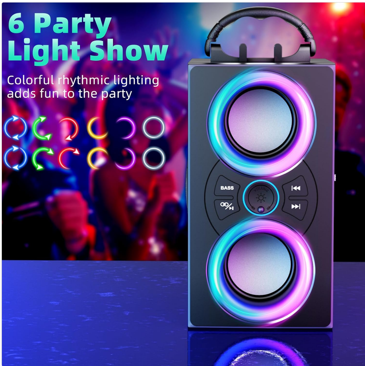
Image: The DINDIN speaker showcasing its "6 Party Light Show" feature, with colorful rhythmic lighting adding to the party atmosphere.