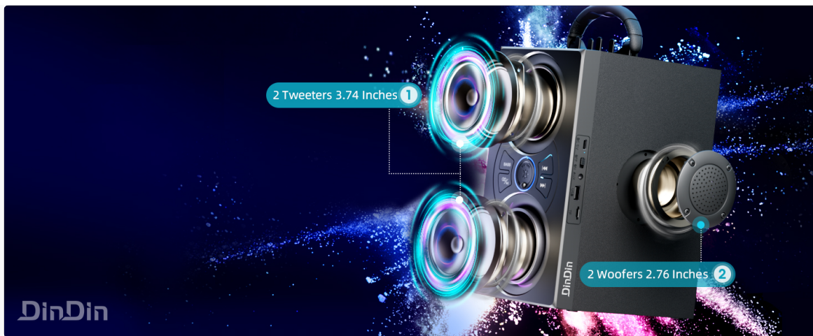
Image: Detailed diagram illustrating the speaker's dual tweeter (3.74 inches) and dual woofer (2.76 inches) configuration for balanced audio output.