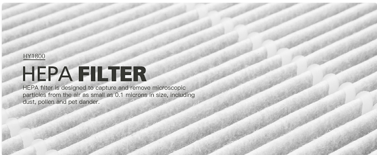
Close-up image of the True HEPA filter, which captures microscopic particles.