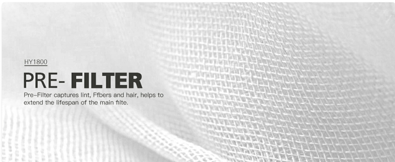
Close-up image of the pre-filter layer, designed to capture lint, fibers, and hair.