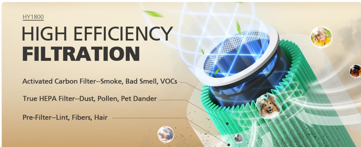
Banner image detailing the high-efficiency filtration process of the CHIVALZ HY1800 filter.