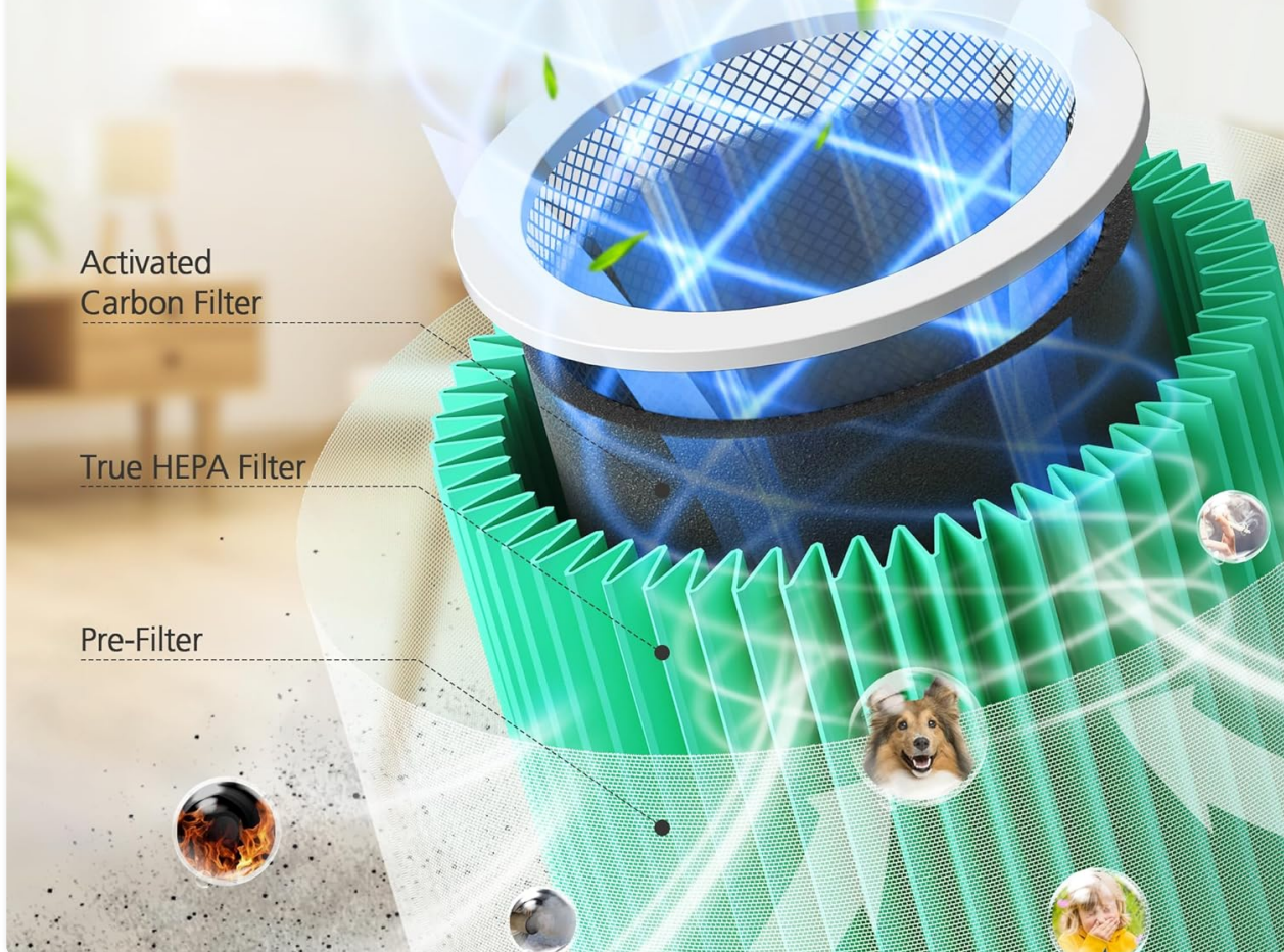
Image showing the CHIVALZ HY1800 Air Purifier with a replacement filter, highlighting its effectiveness against common airborne particles and odors.