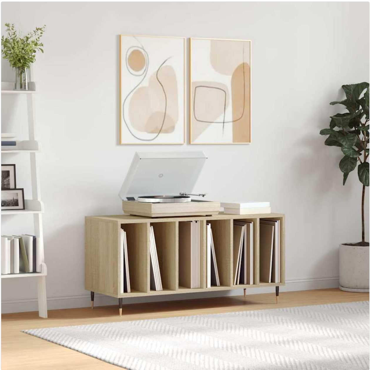
Image 1.1: The vidaXL Record Cabinet and Turntable Stand in a living room, showcasing its use for vinyl storage and turntable placement.