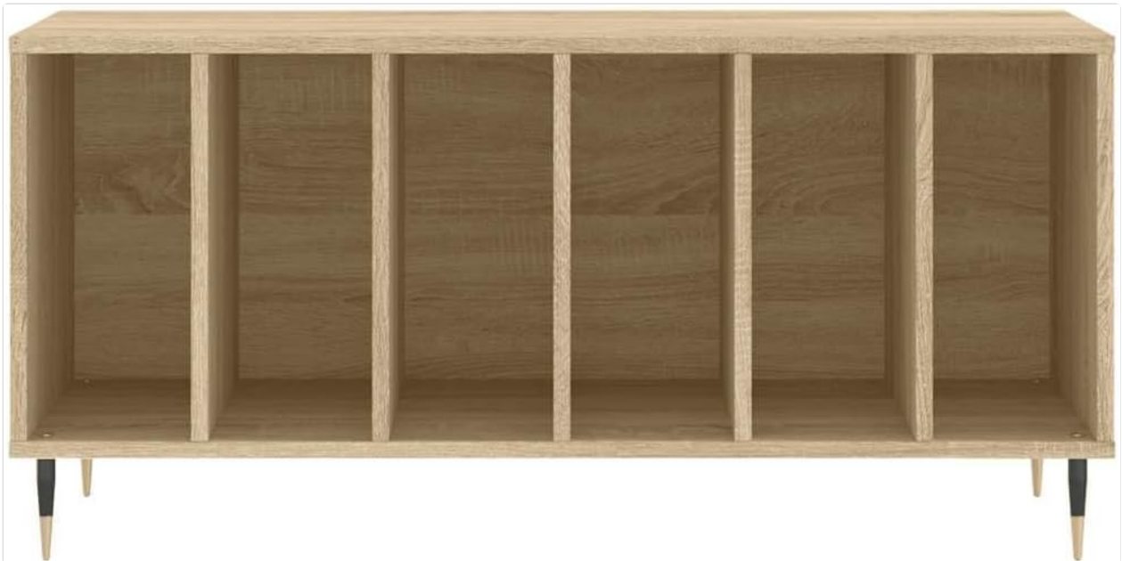
Image 4.1: Front view of the empty record cabinet, ready for setup.

Once assembled, place the record cabinet in your desired location. Ensure the surface is level and stable. The top surface is designed to hold a turntable or other media devices. The internal compartments are specifically sized for vinyl records.