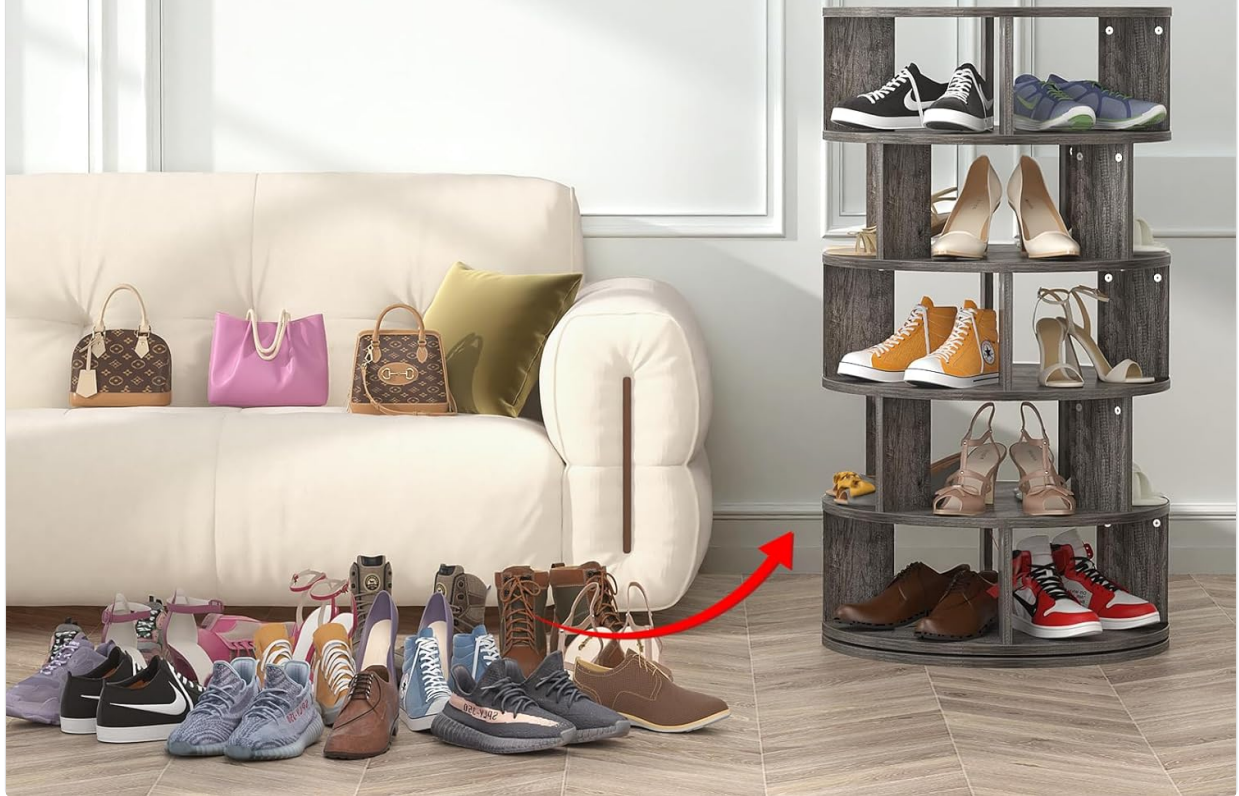
Image: The shoe rack in use, demonstrating its storage capacity for various shoe types.