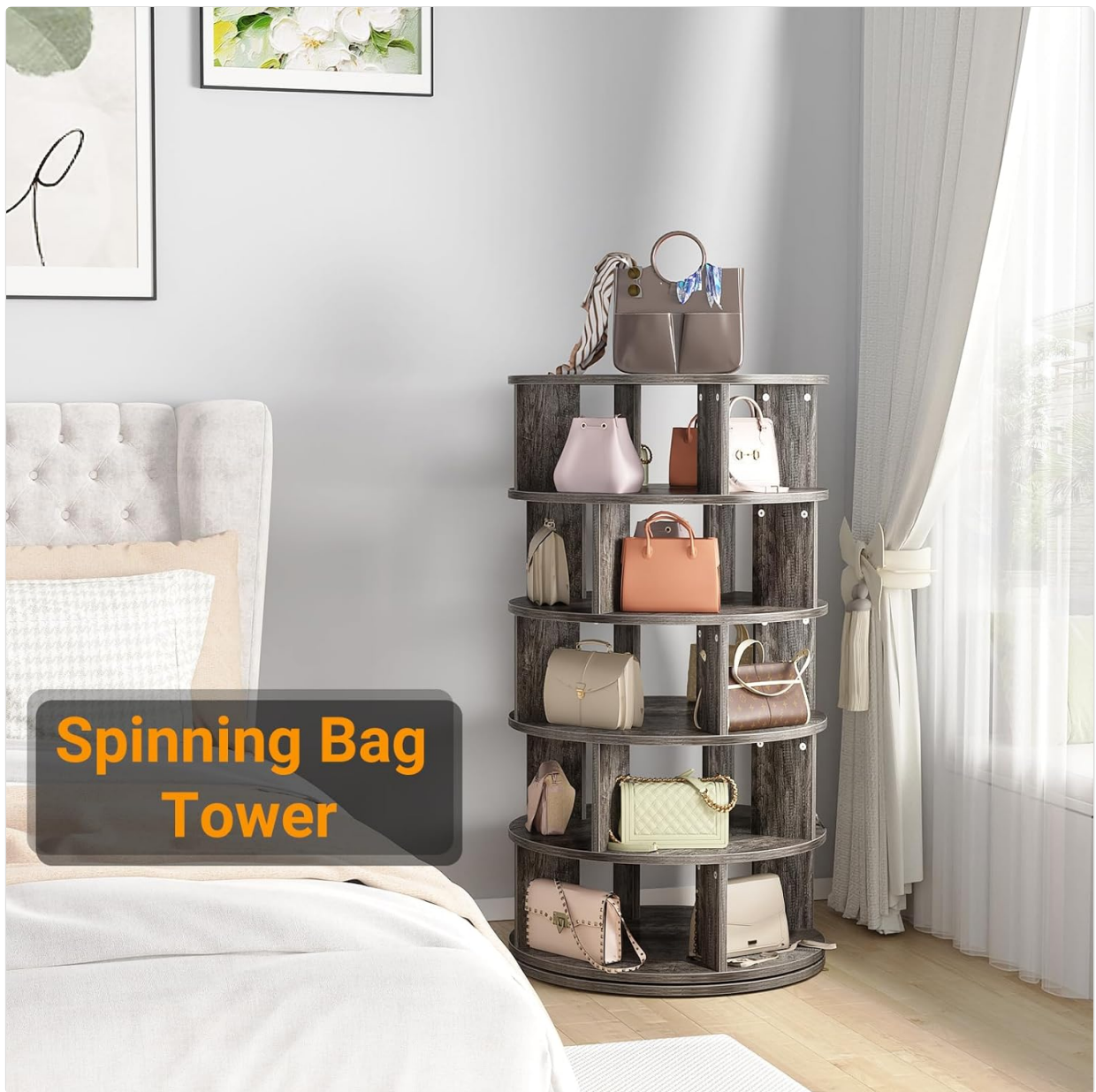
Image: The rotating rack functioning as a versatile bookshelf and display unit.