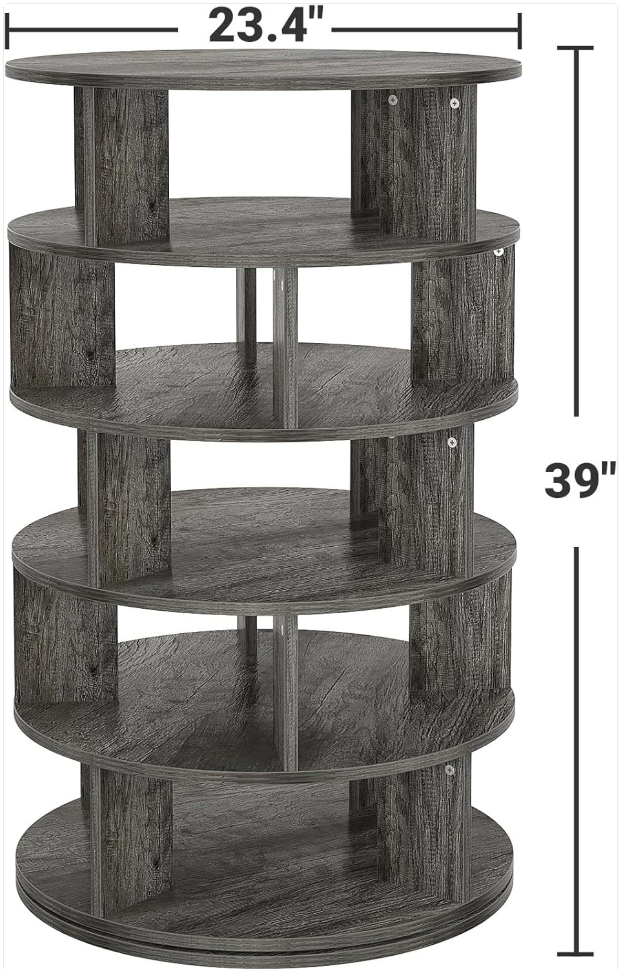
Image: Overall dimensions of the Aheaplus 5-tier rotating shoe rack.