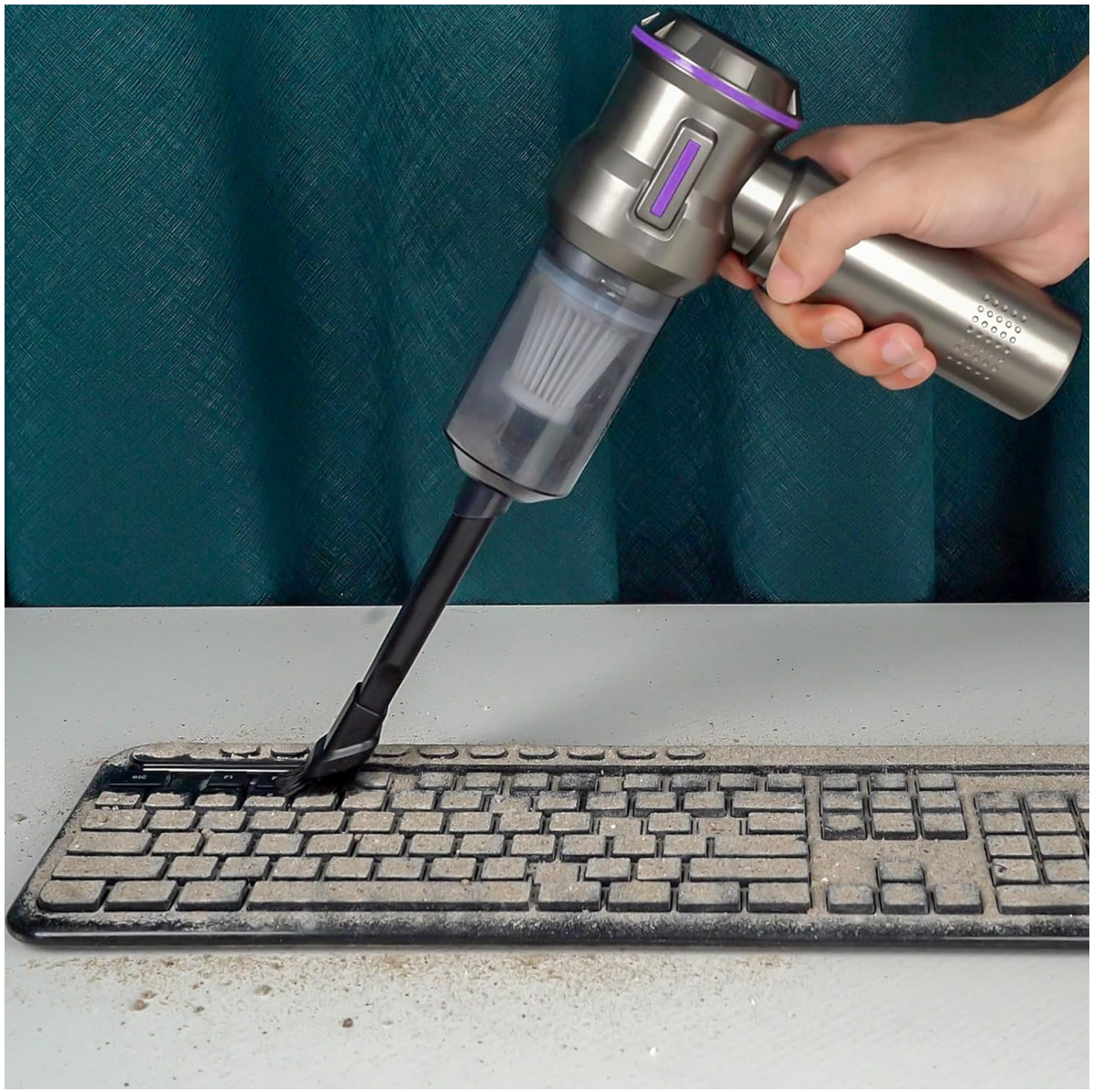
Image: The mini vacuum effectively collecting crumbs and dust from a computer keyboard surface.