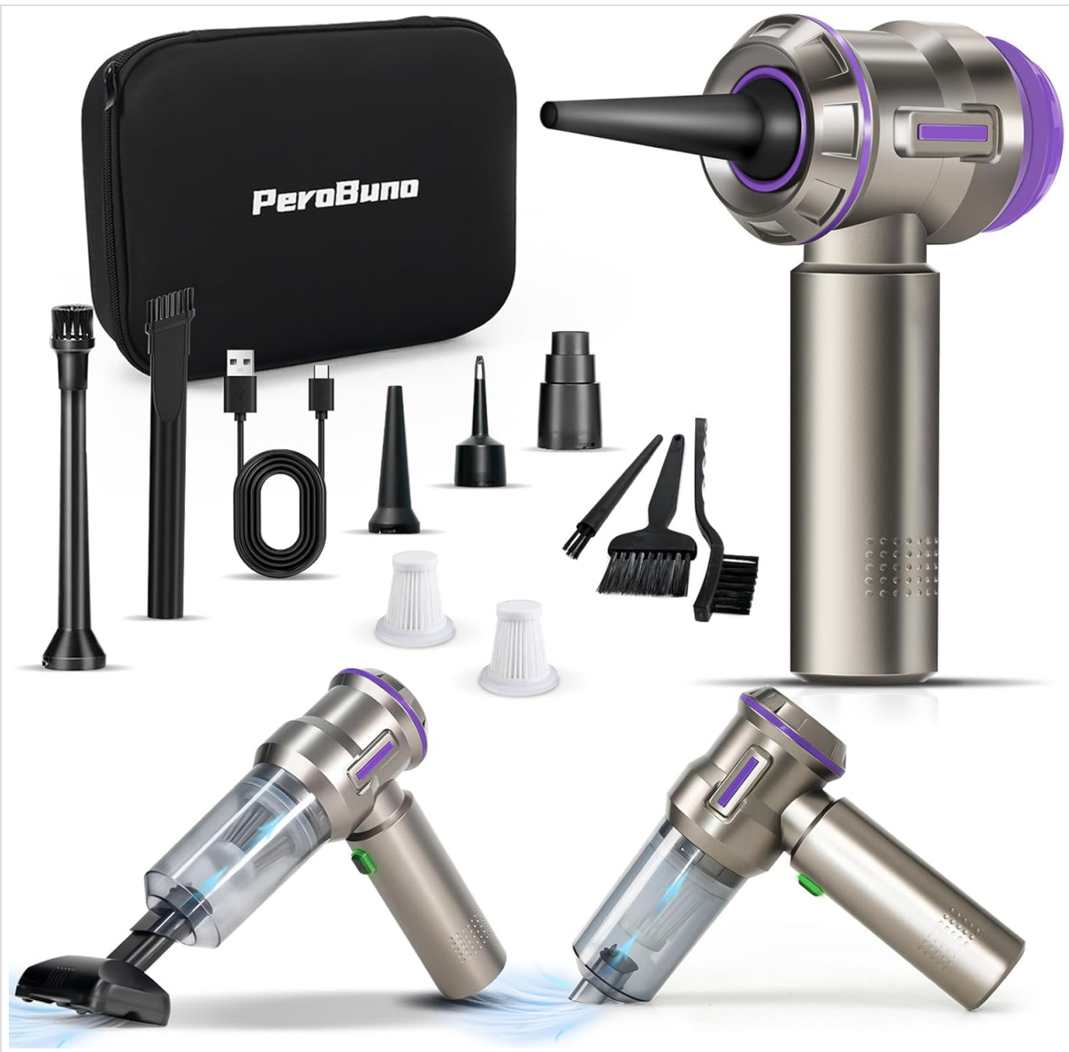
Image: The PeroBuno 2-in-1 cleaner shown with its full set of accessories, including various nozzles, brushes, charging cable, filters, and a carrying case.