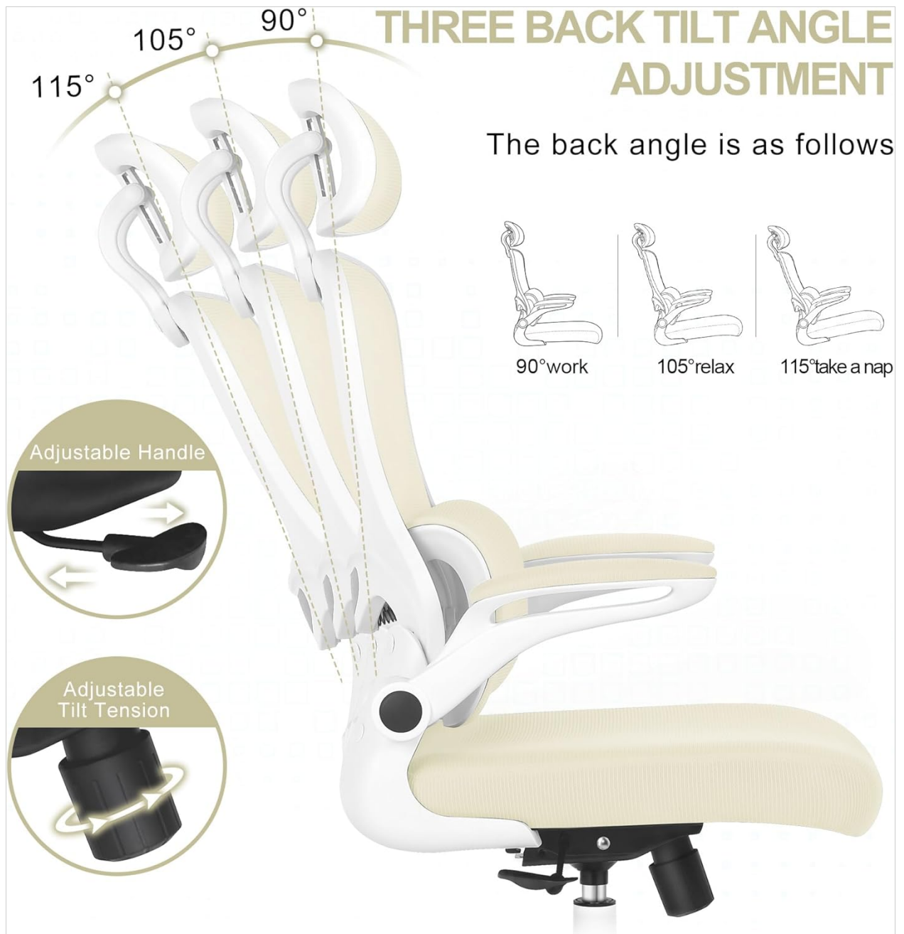
Image: Three back tilt angle adjustments for various activities.