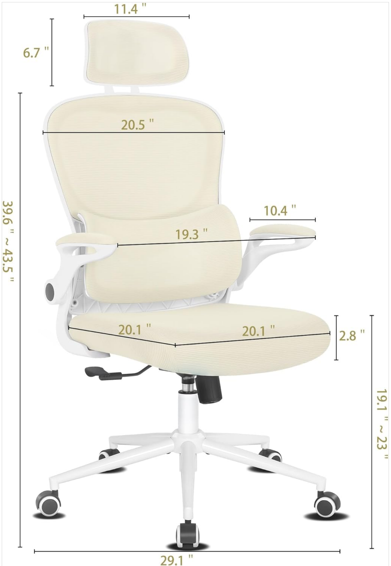
Image: Product dimensions overview.