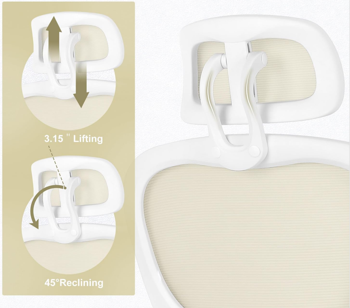
Image: Adjustable headrest with lifting and reclining functions.