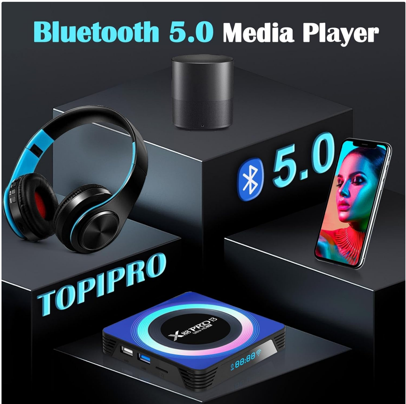
Image: Bluetooth 5.0 Media Player. This image demonstrates the TV box's Bluetooth 5.0 capability, showing it wirelessly connected to headphones, a portable speaker, and a smartphone.

To pair a Bluetooth device, go to the Android settings, select 'Connected devices' or 'Bluetooth', and follow the pairing instructions for your specific device.