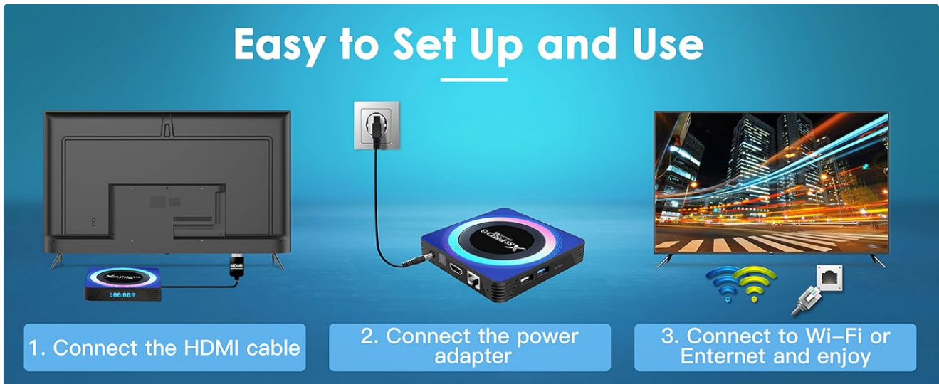
Image: Easy setup guide. This diagram illustrates three simple steps: 1. Connect the HDMI cable from the TV box to the TV. 2. Connect the power adapter to the TV box and a power outlet. 3. Connect to Wi-Fi or Ethernet for internet access.