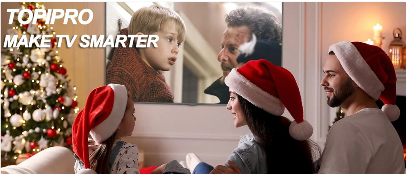
Image: Screen Casting and Sharing. This image illustrates different uses for screen mirroring, such as playing games, watching movies, and conducting online meetings, by casting content from various devices to a television.