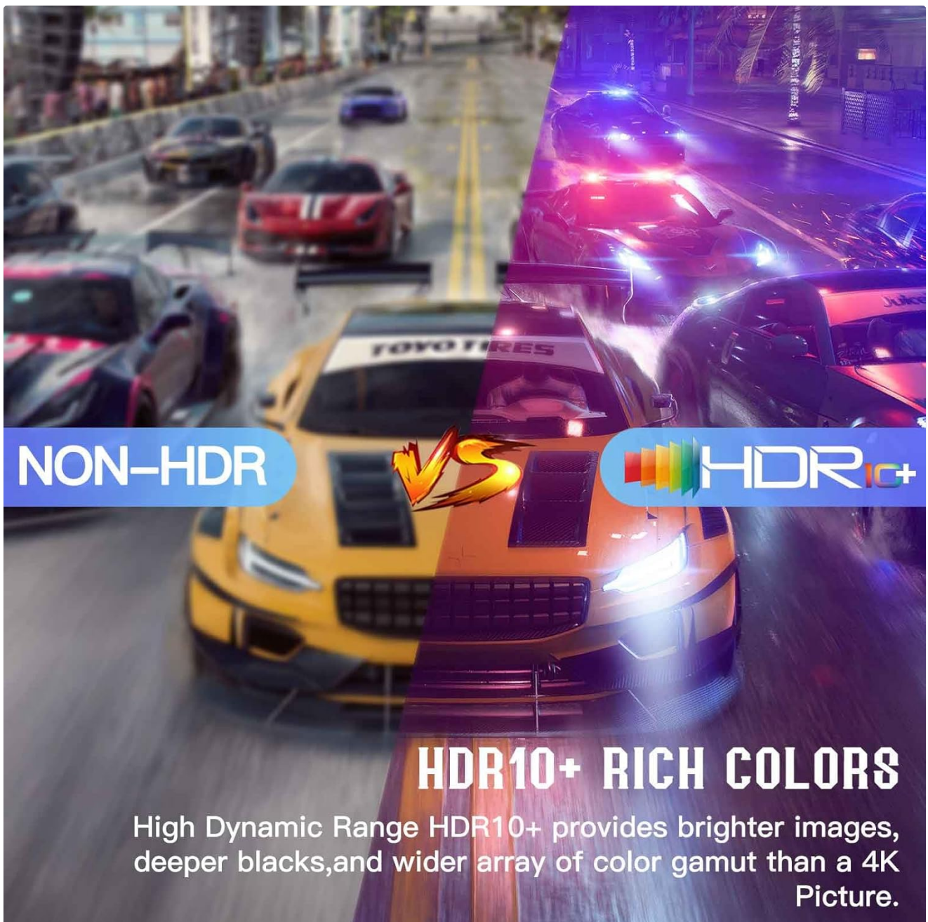
Image: HDR10+ Rich Colors. This image demonstrates the visual difference between non-HDR and HDR10+ content, showcasing how HDR10+ provides brighter images, deeper blacks, and a wider color gamut.