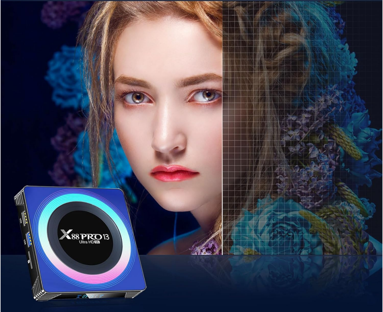
Image: 8K Ultra HD vs 4K. This image visually compares the superior detail and clarity of 8K Ultra HD resolution at 30fps against standard 4K display, with the X88 Pro 13 TV box in the foreground.