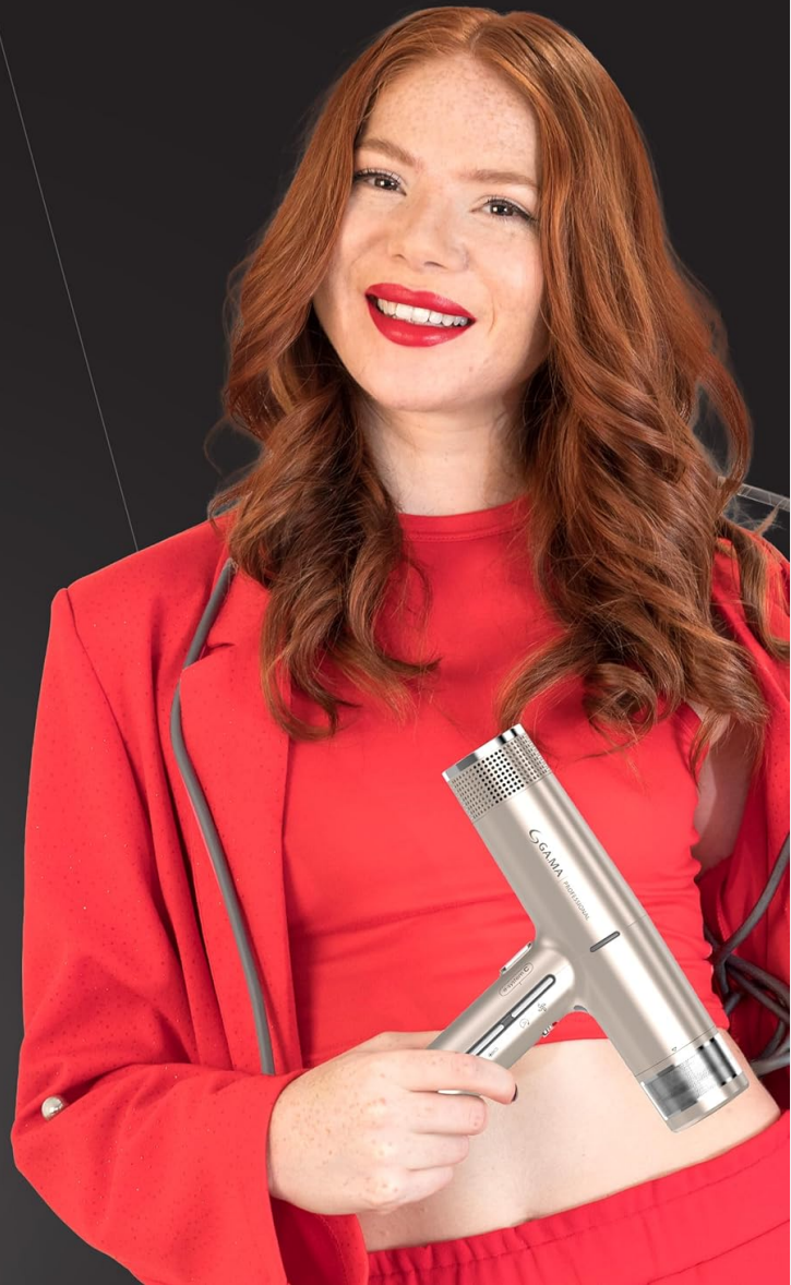
Image: The GA.MA iQ1 Perfetto Hair Dryer in Rose Gold, showcasing its compact and ergonomic design.

Compact yet powerful, intelligent and innovative. Bring extraordinary styling.