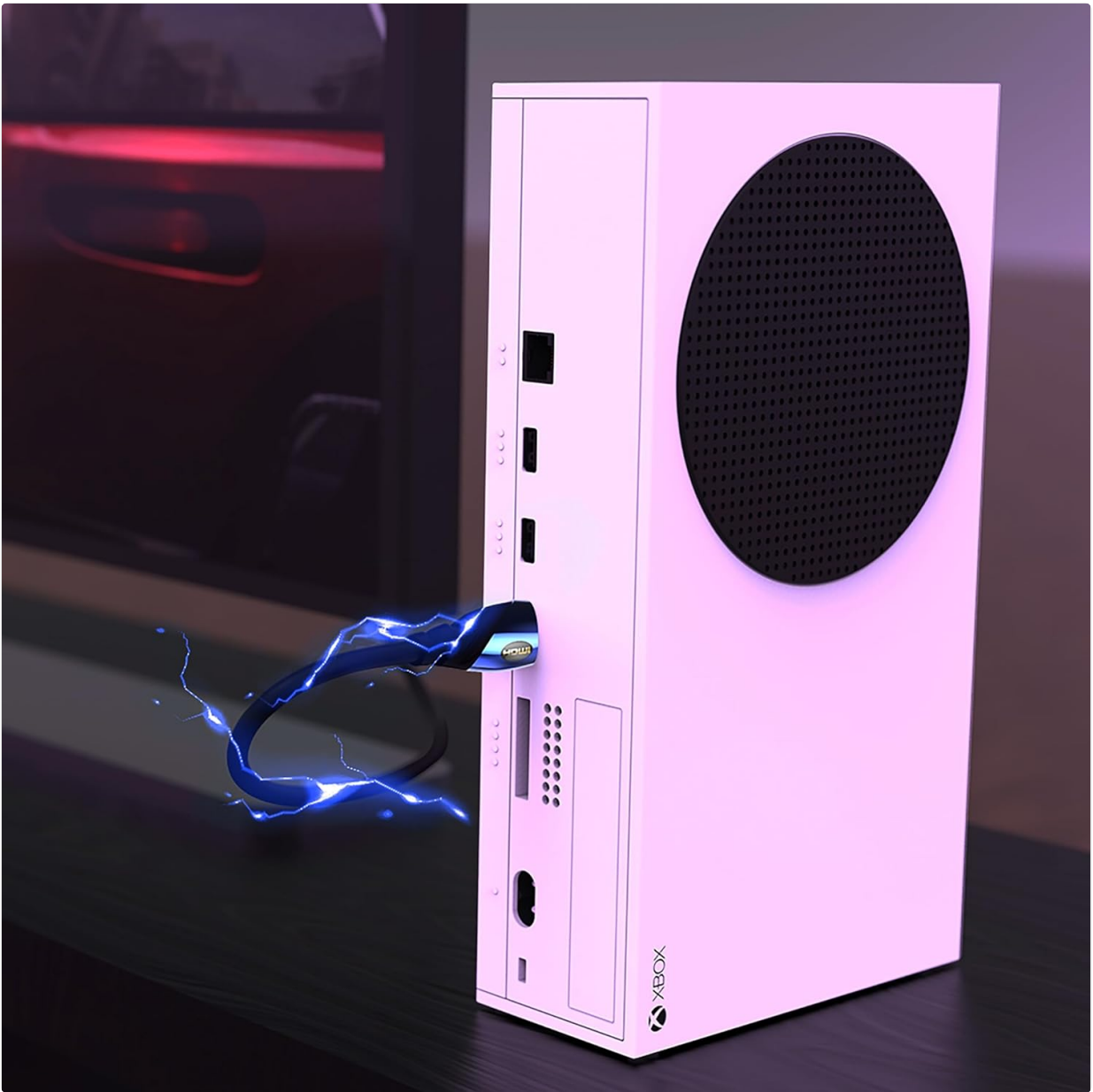
An Xbox Series S connected to a display using the Monster HDMI cable, demonstrating a typical setup.

Video demonstrating the Monster Ultra High-Speed 8K Blue HDMI 2.1 Cable at 48 Gbps in use, showcasing its compatibility and performance.