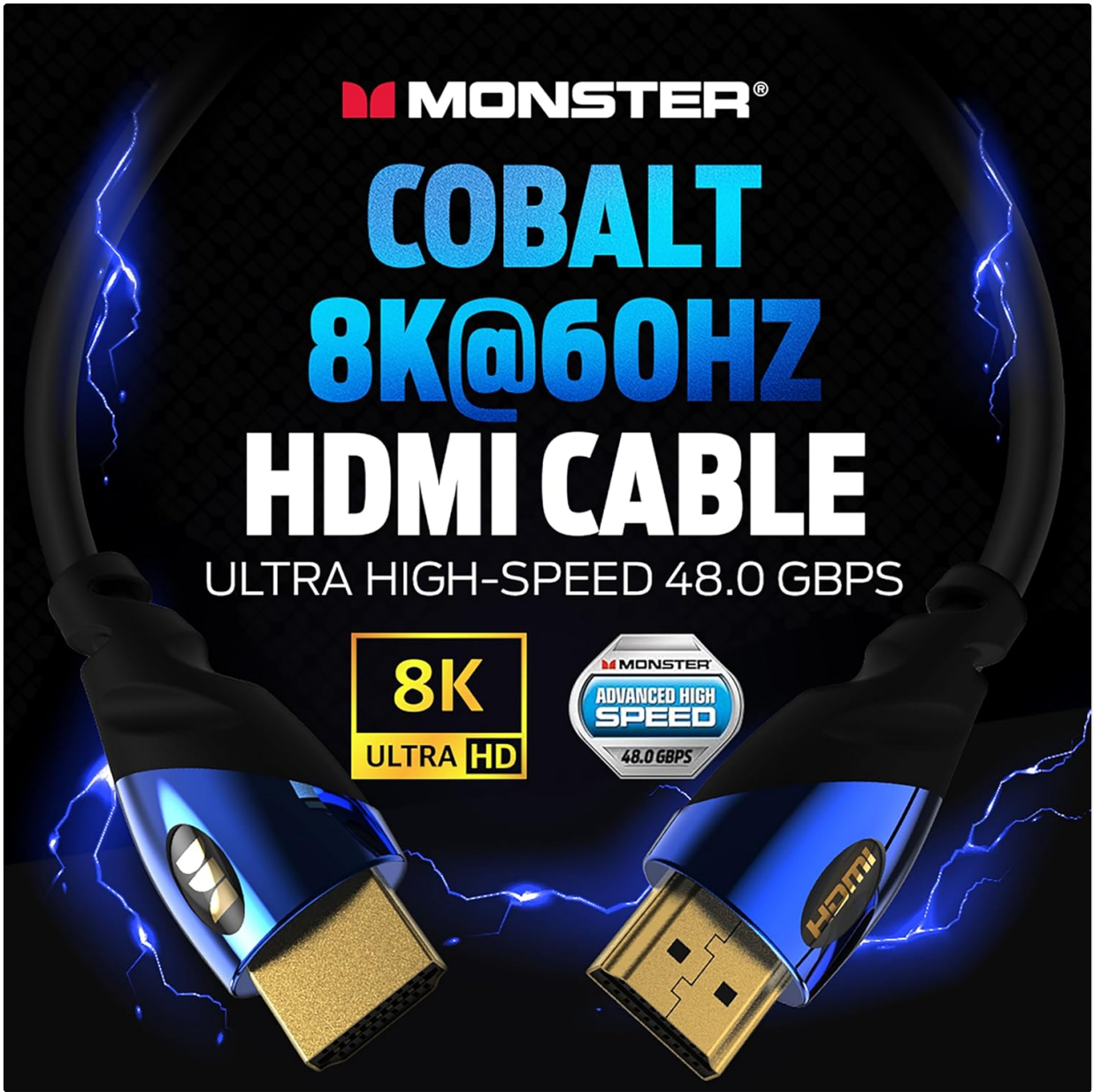
The Monster Cobalt 8K@60Hz HDMI Cable, highlighting its ultra-high-speed capabilities.