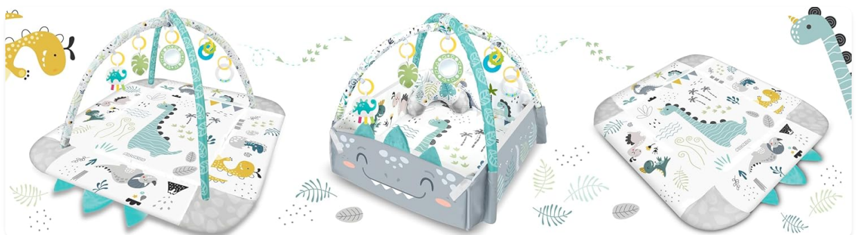
Image: Visual representation of the three possible configurations of the play mat: a flat mat, a mat with its sides raised, and a mat with arches for hanging toys.