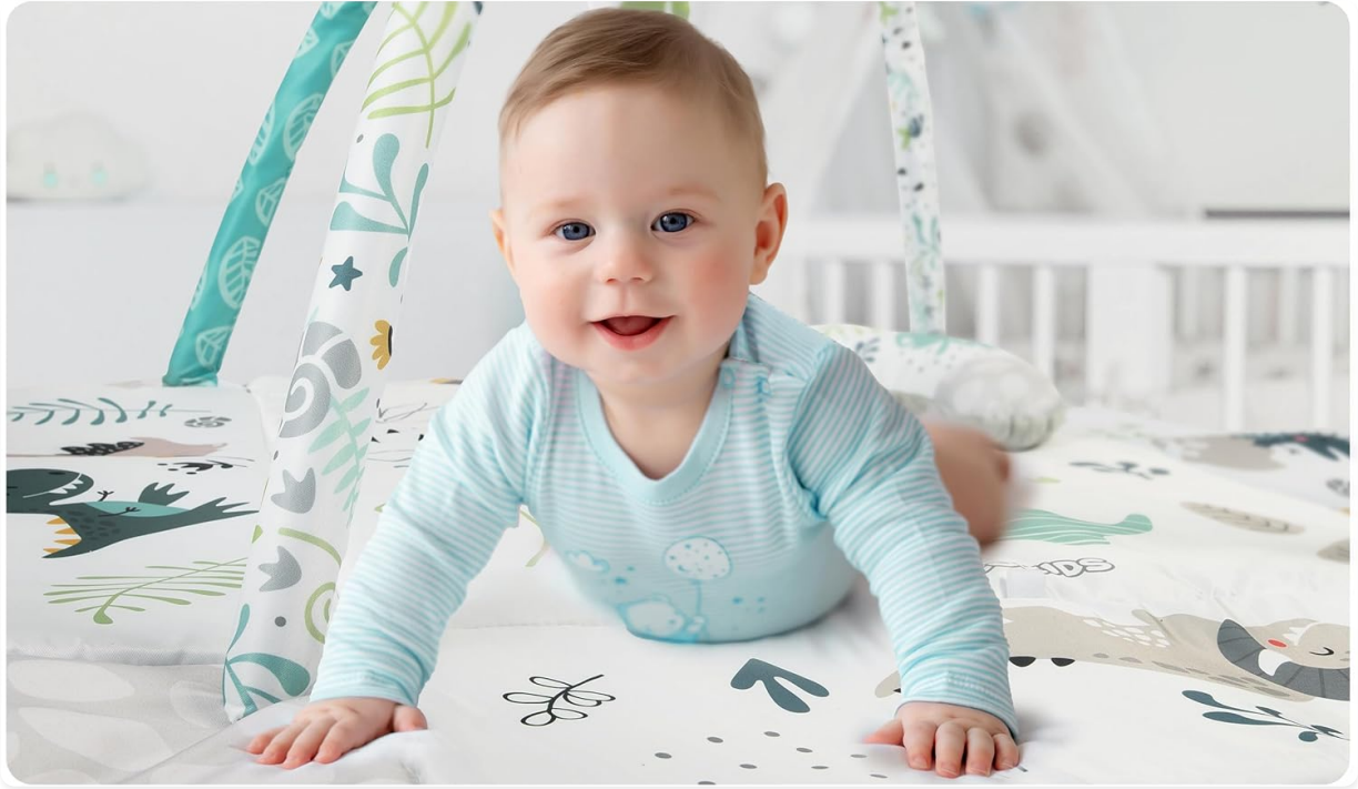
Image: A baby lying on their stomach on the play mat, engaging with the mat's design, demonstrating tummy time use.