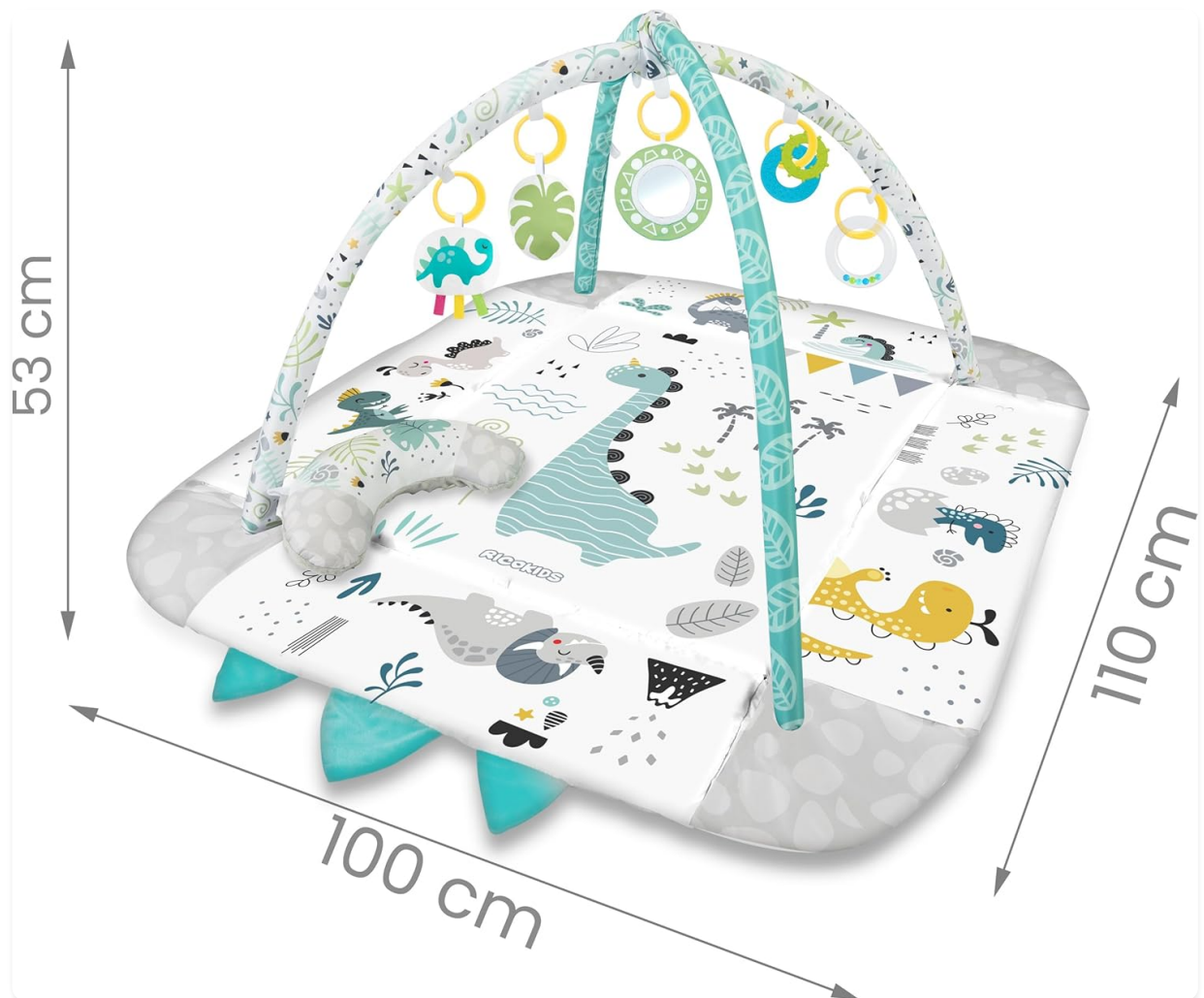
Image: A diagram illustrating the key dimensions of the play mat, including its length, width, and height when assembled.