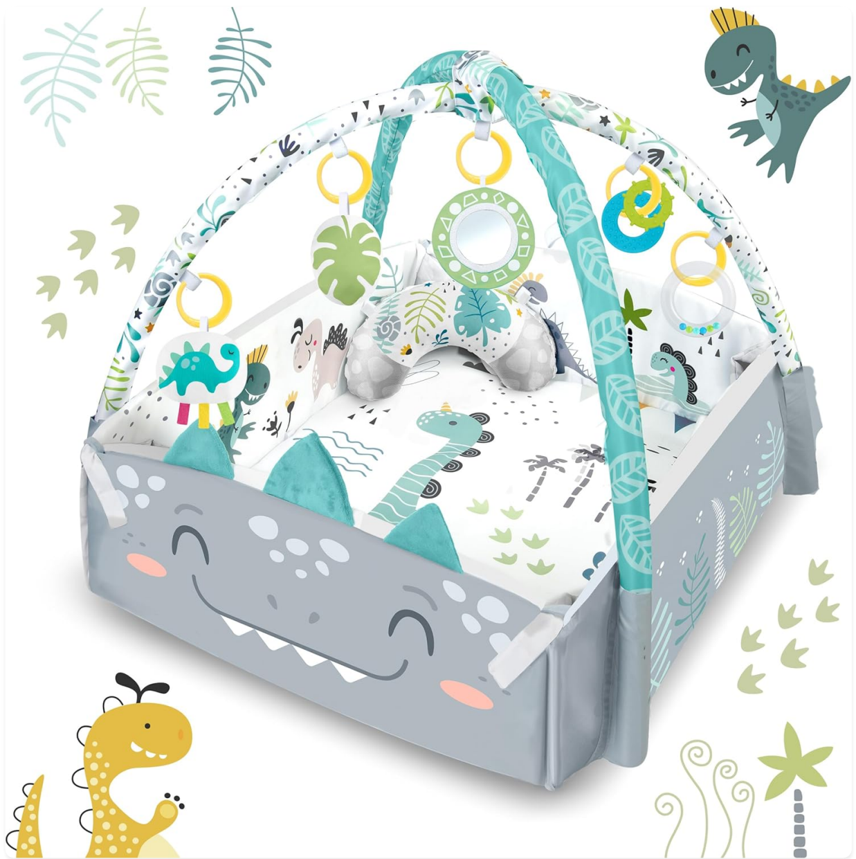
Image: The Ricokids play mat fully assembled in its arch configuration, showing the mat, arches, and hanging toys.