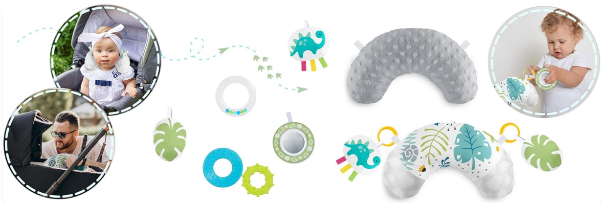
Image: Individual toys from the play mat, such as the mirror, leaf, and rings, are shown being used by a child, demonstrating their versatility.