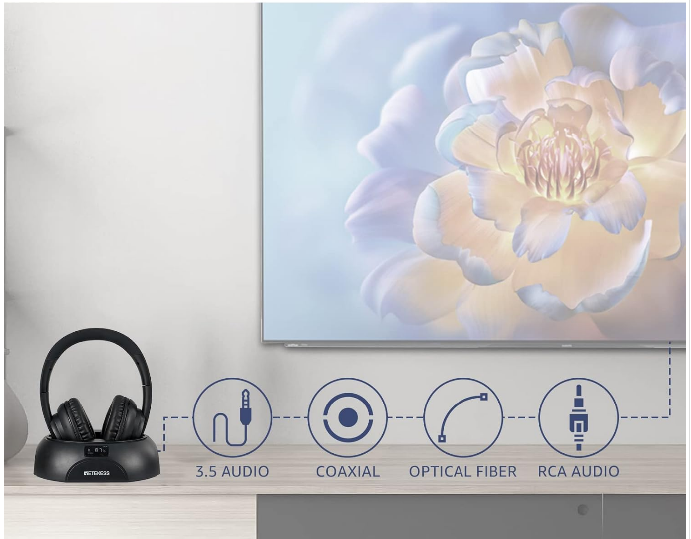
Image: The charging dock and transmitter setup, demonstrating connectivity to a TV via 3.5mm audio, coaxial, optical fiber, and RCA audio inputs.