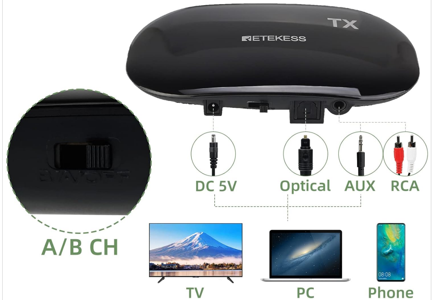
Image: The transmitter's side view, highlighting the A/B channel switch and its power and audio input ports.

Optical, AUX and RCA can work with most TVs, smart or non-smart.