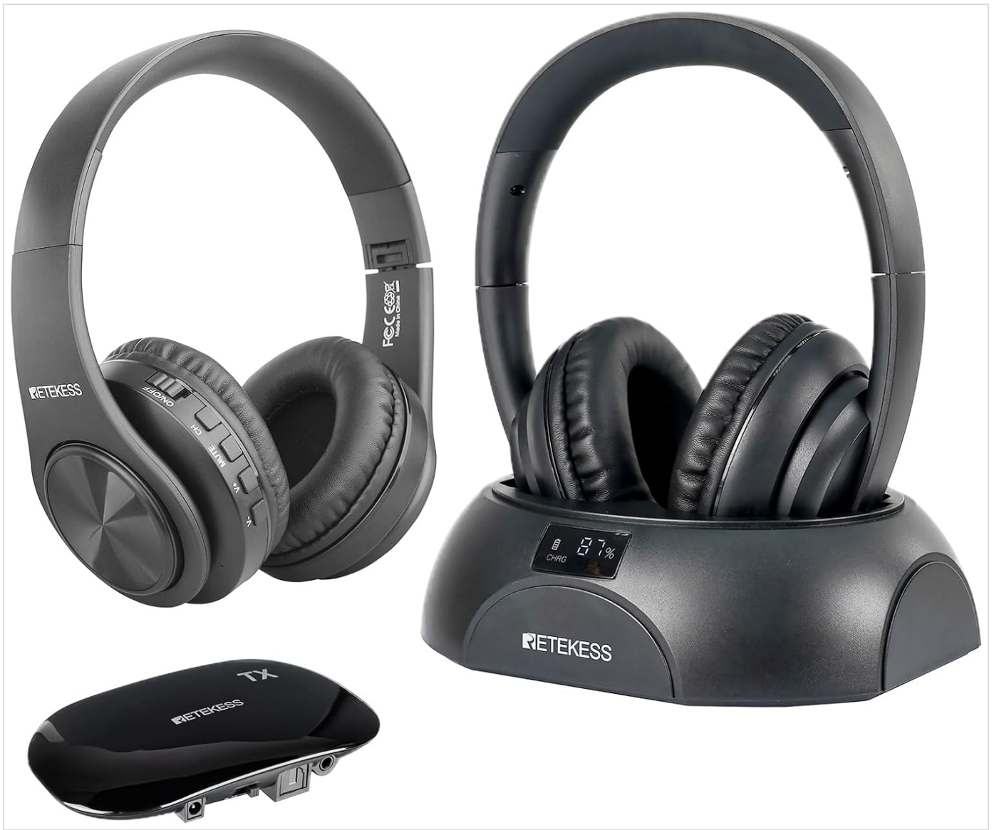
Image: Overview of the Reteless TA005 and TA006 wireless TV headphone system, featuring two headphones, a transmitter, and a charging dock.