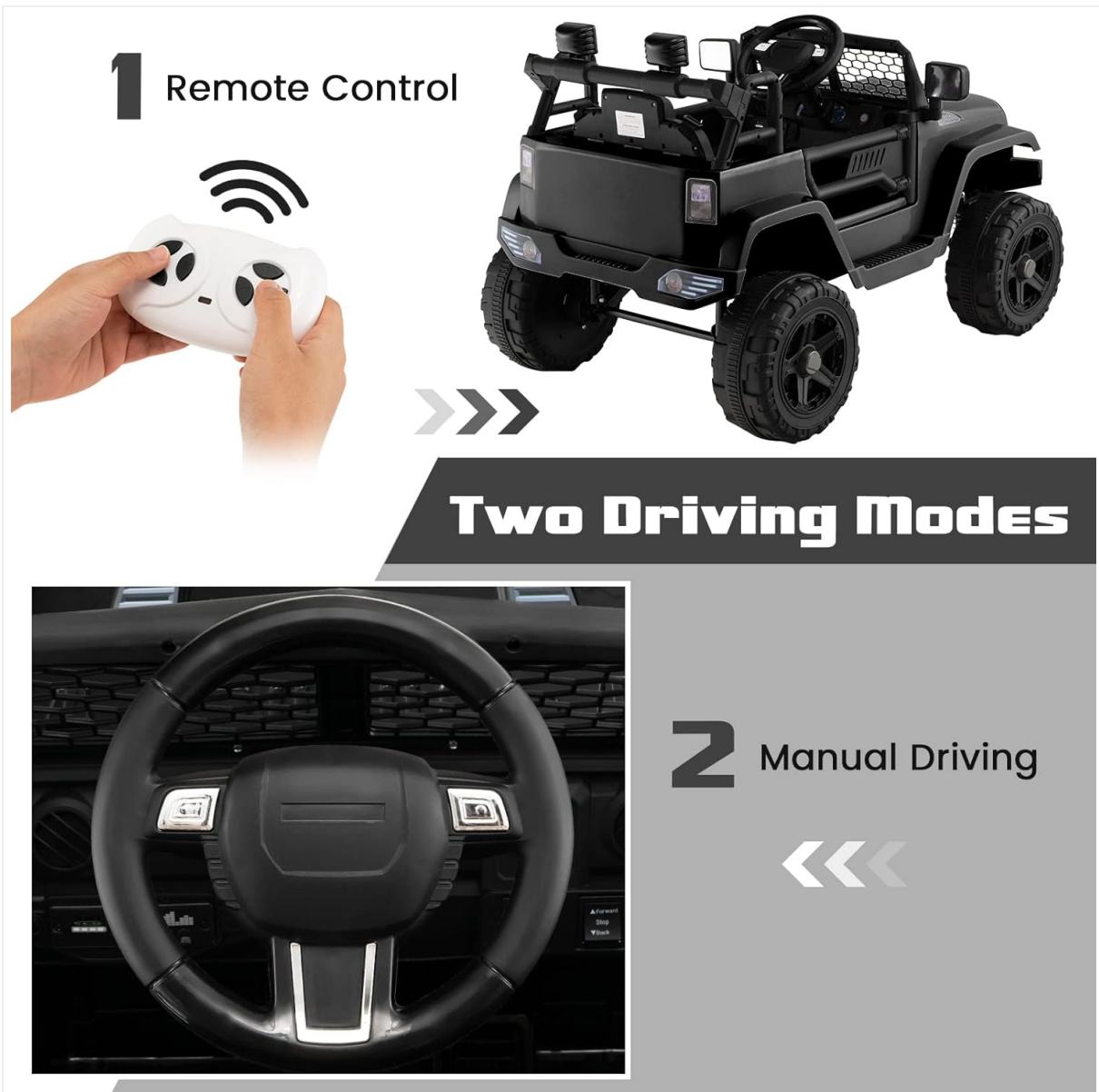
Image: The remote control and a visual representation of the two driving modes: remote control and manual driving.

9. Accessory Attachment: Install the front bumper, windshield, and rear roll bar with lights.