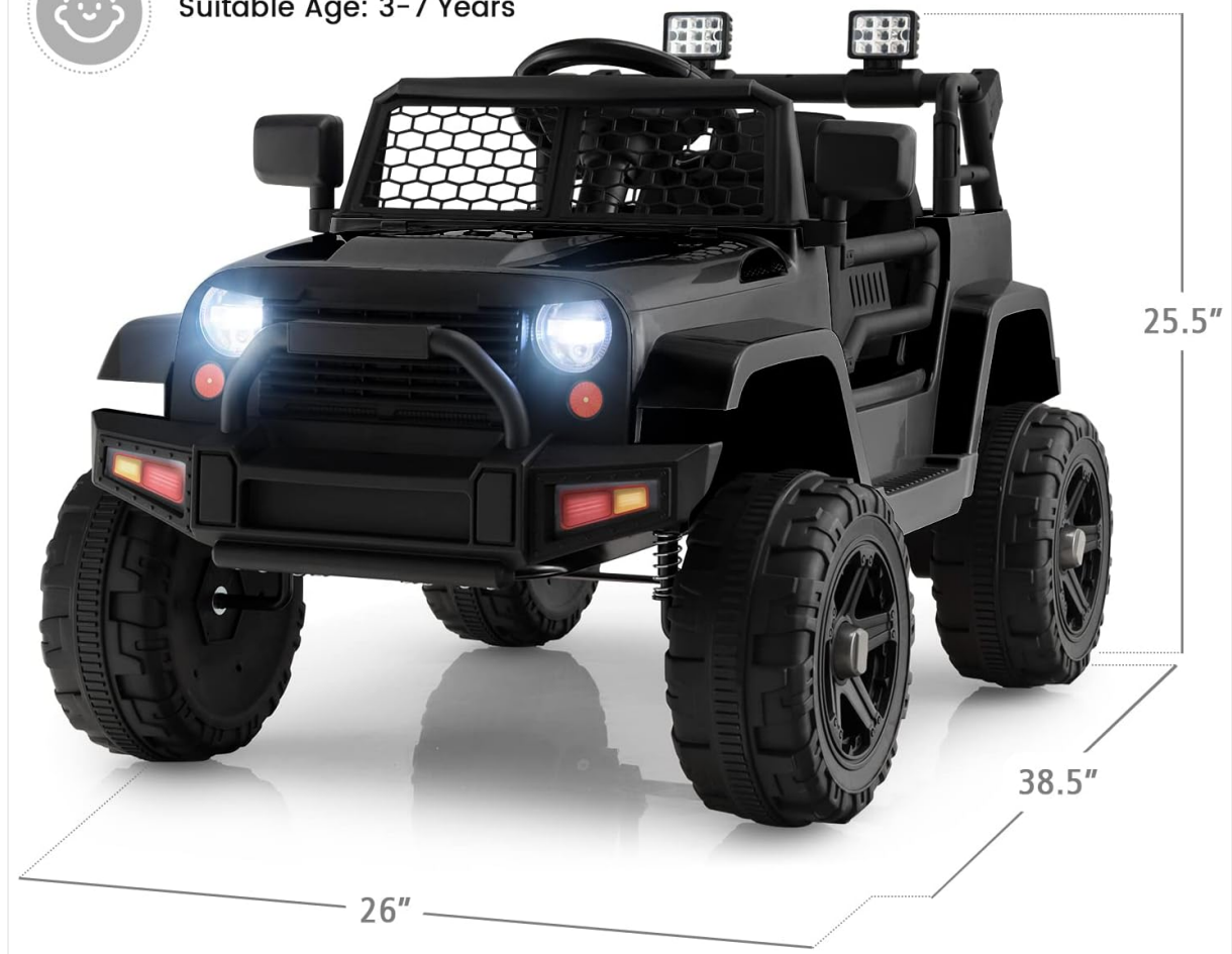
Image: Key specifications including dimensions, weight capacity, and suitable age range.