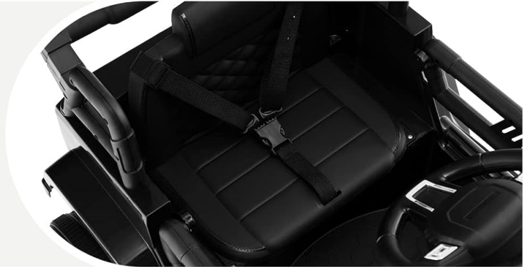
Image: Details of the ride-on truck's safety features: bright LED headlights, lockable doors, and a wide seat with a safety belt.