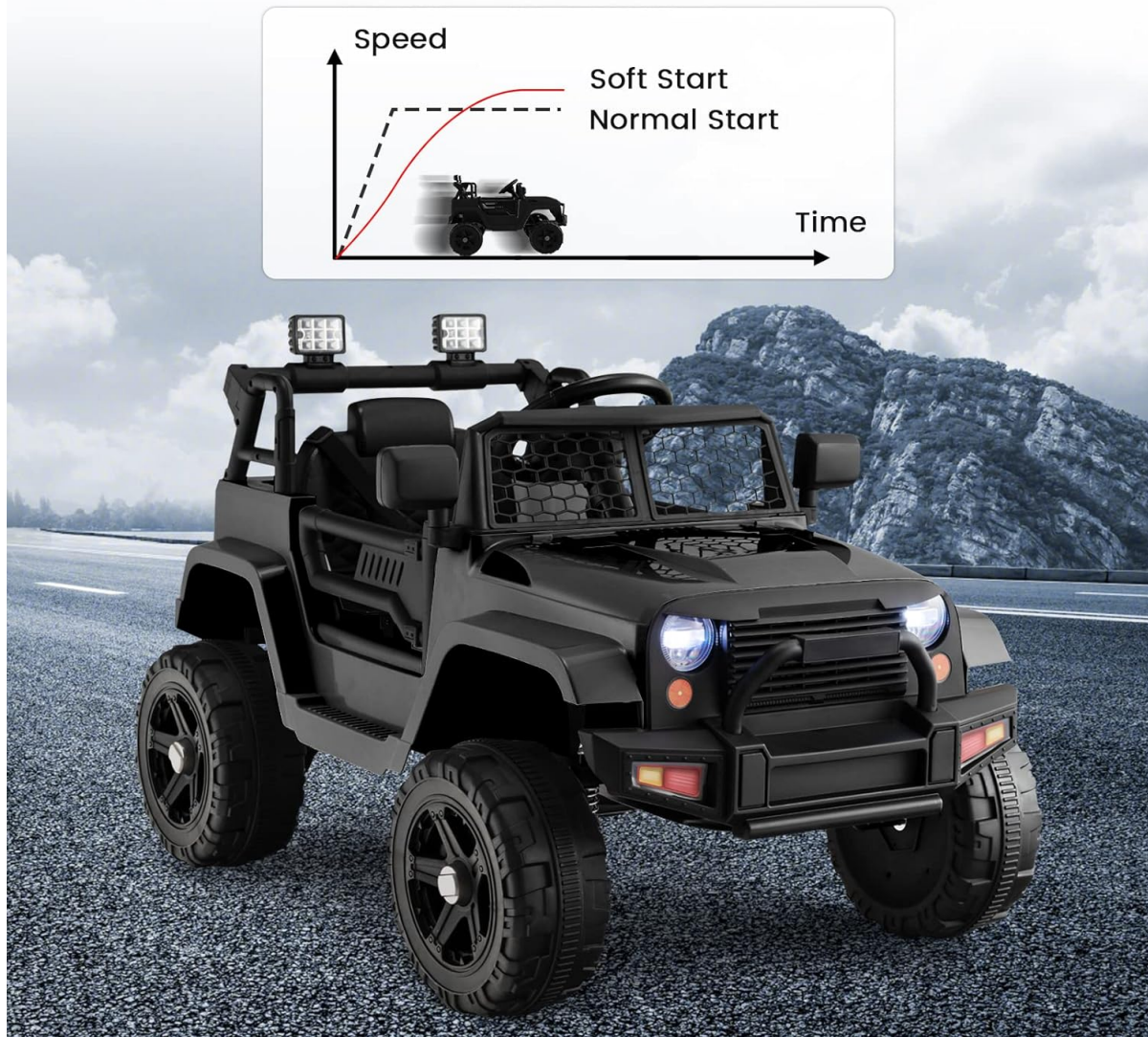
Image: Illustration of the soft start design, demonstrating smooth acceleration.