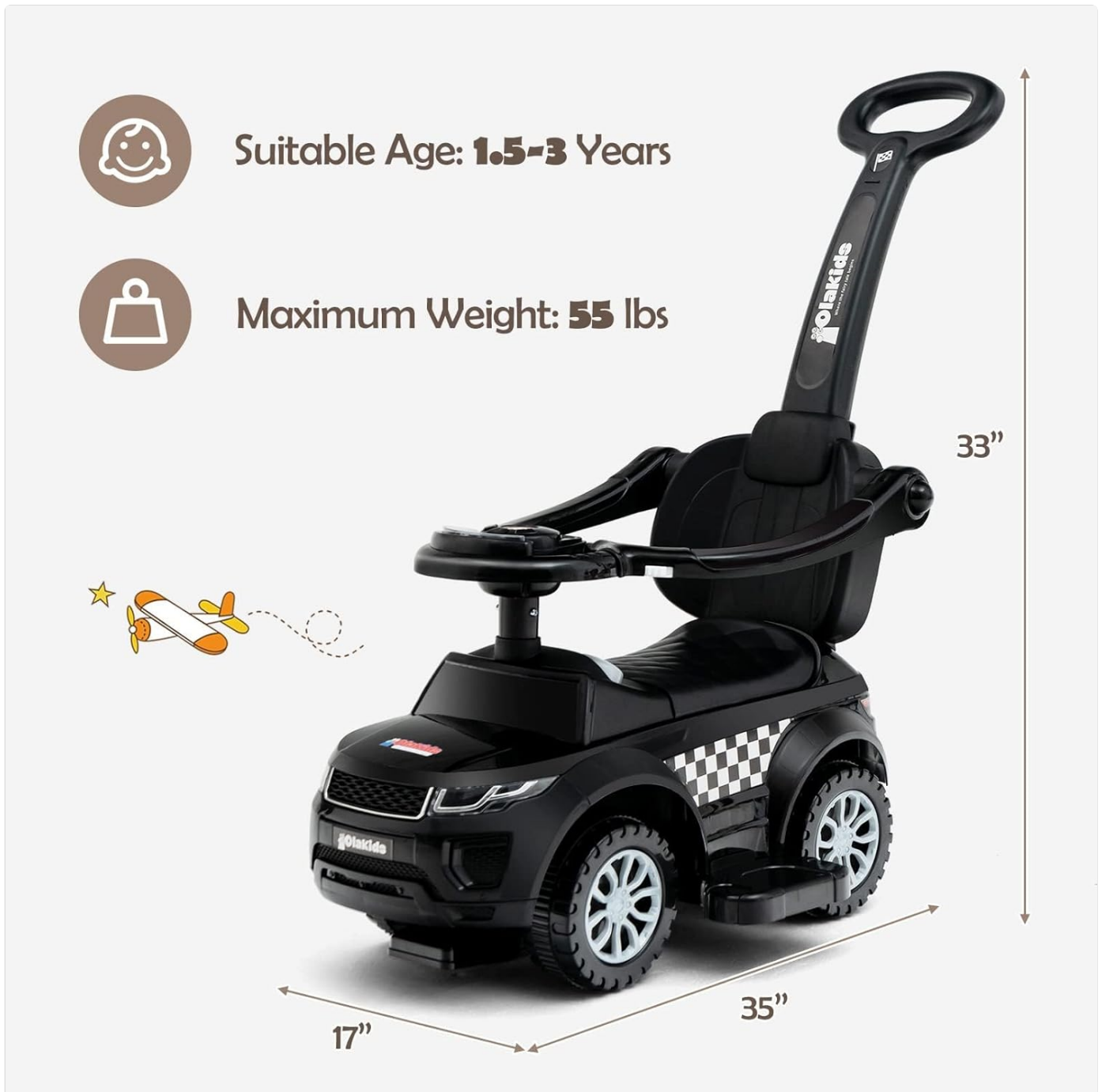
Image: Visual representation of the product's dimensions (35" L x 17" W x 33" H), suitable age range (1.5-3 years), and maximum weight capacity (55 lbs).