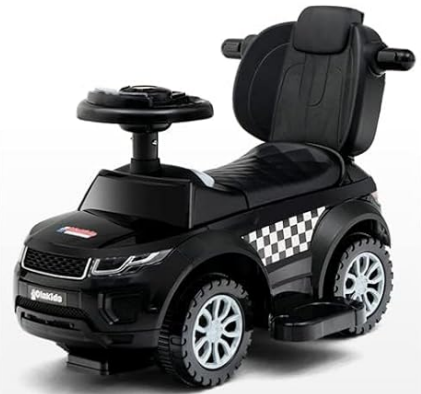
Riding On car

Image: A visual guide demonstrating the three primary modes of the ride-on car: Stroller, Walking Car, and Riding On Car, illustrating how the product adapts to different stages of a child's growth.