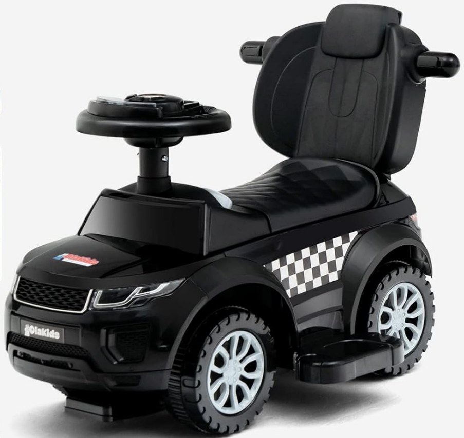
Image: Illustration of the ride-on car's wear-resistant wheels, suitable for various indoor and outdoor surfaces like wood floors, asphalt, and paved areas.