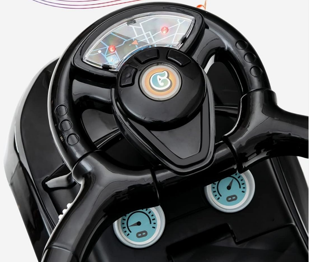
Image: A detailed view of the steering wheel, highlighting the buttons for music, horn, and lights, which provide interactive driving fun.