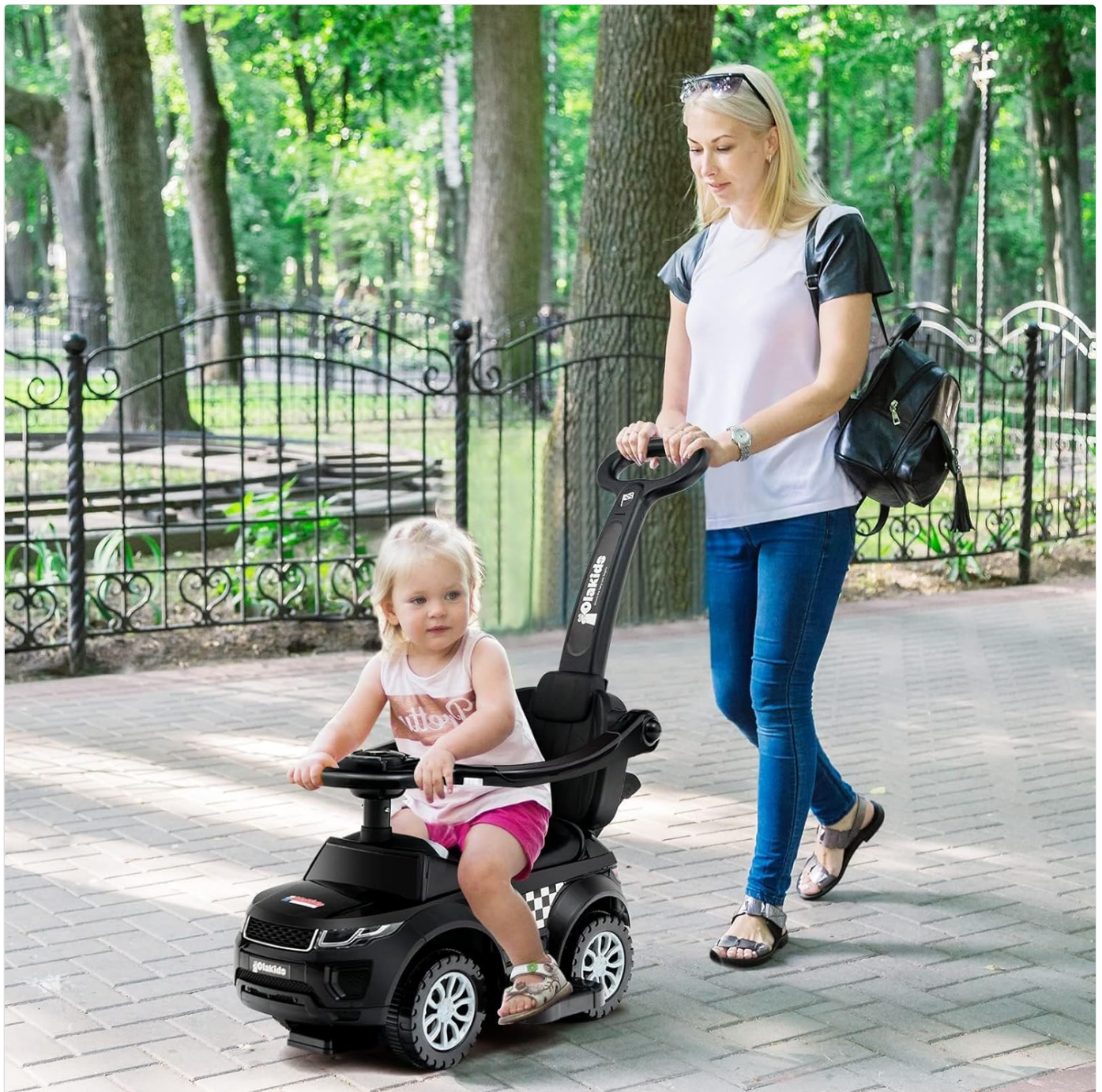
Image: A parent pushing a child in the OLAKIDS ride-on car, demonstrating the stroller mode in an outdoor setting.