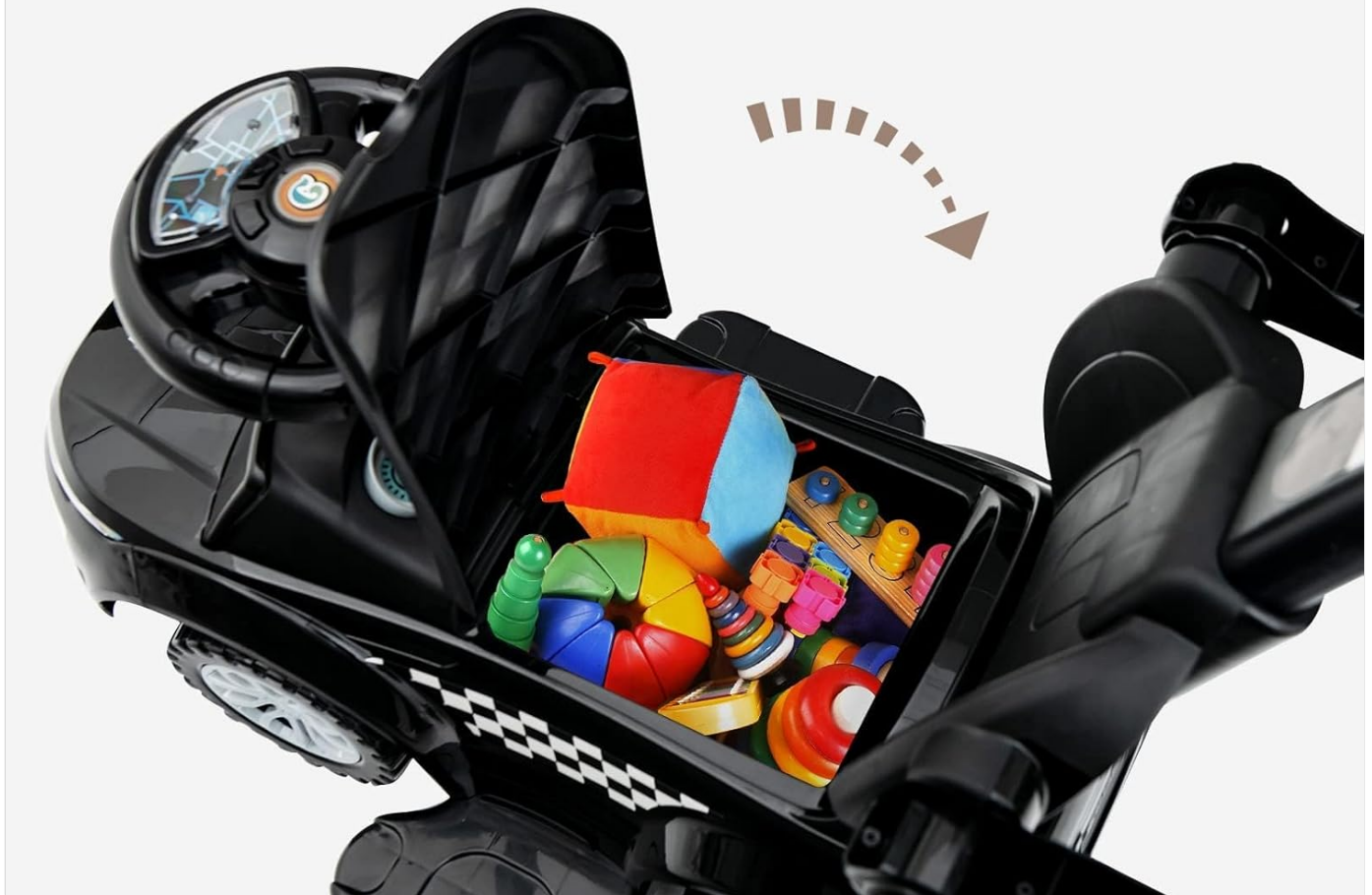
Image: The underneath storage space with the seat lifted, showing it filled with various small toys, demonstrating its utility for carrying items.