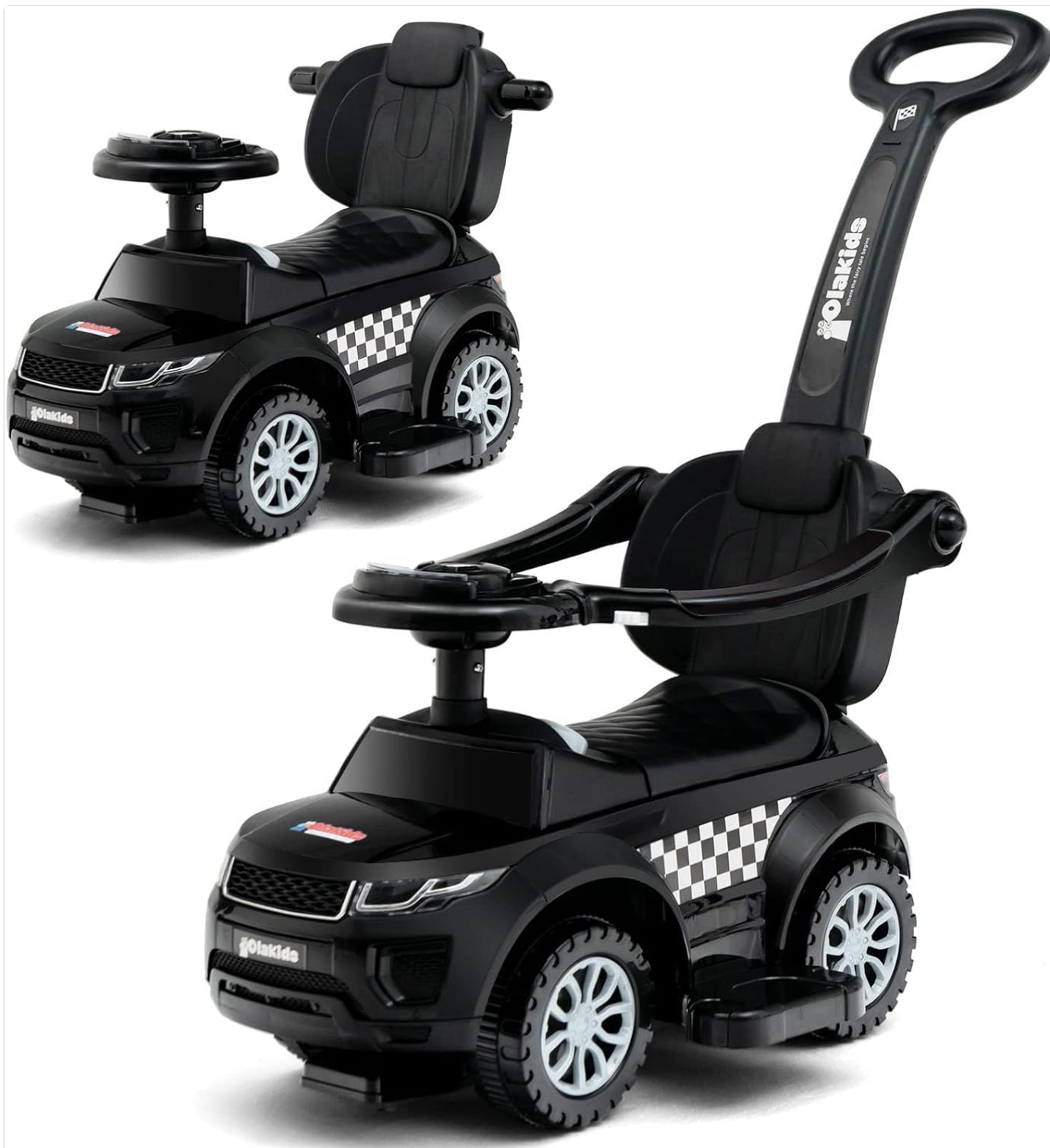
Image: The OLAKIDS 4 in 1 Ride on Push Car in its dark color, showcasing its sleek design and multi-functional capabilities.