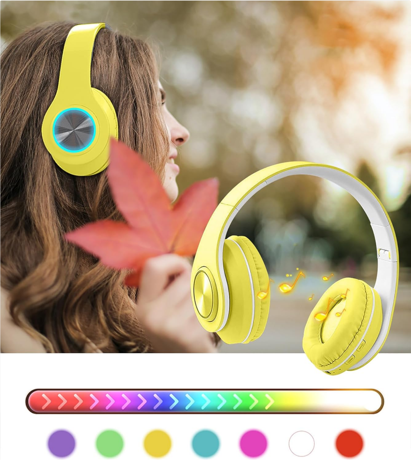
Image: Details of the ergonomic and scalable design with comfortable earcups.