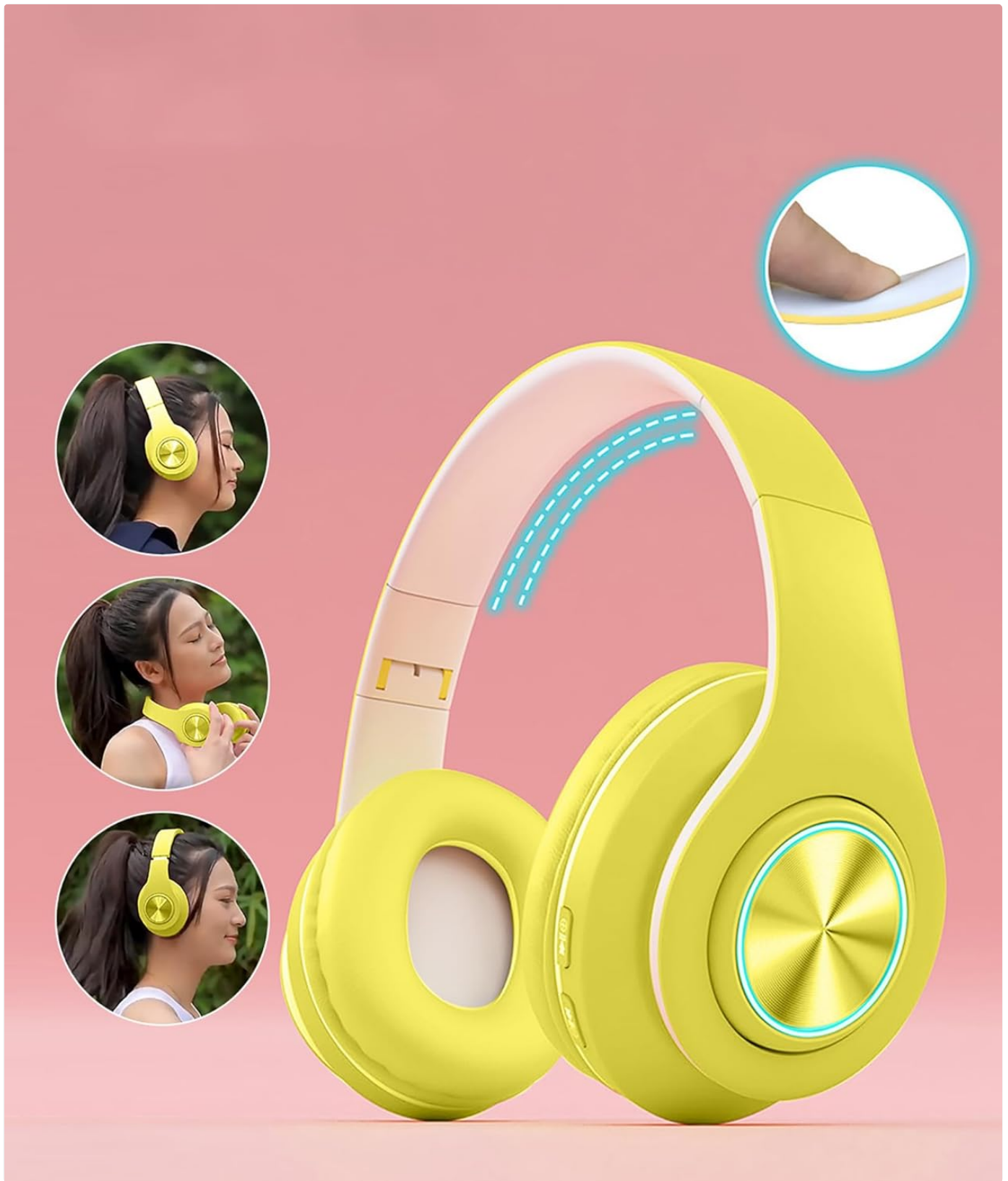
Image: E-Greetshopping B39 headphones featuring dynamic LED lighting.

The LED lights on the earcups are designed to sync with the rhythm of your music. Specific controls for changing LED patterns or turning them off are not detailed in the product information. They are generally activated automatically when the headphones are powered on and playing music.