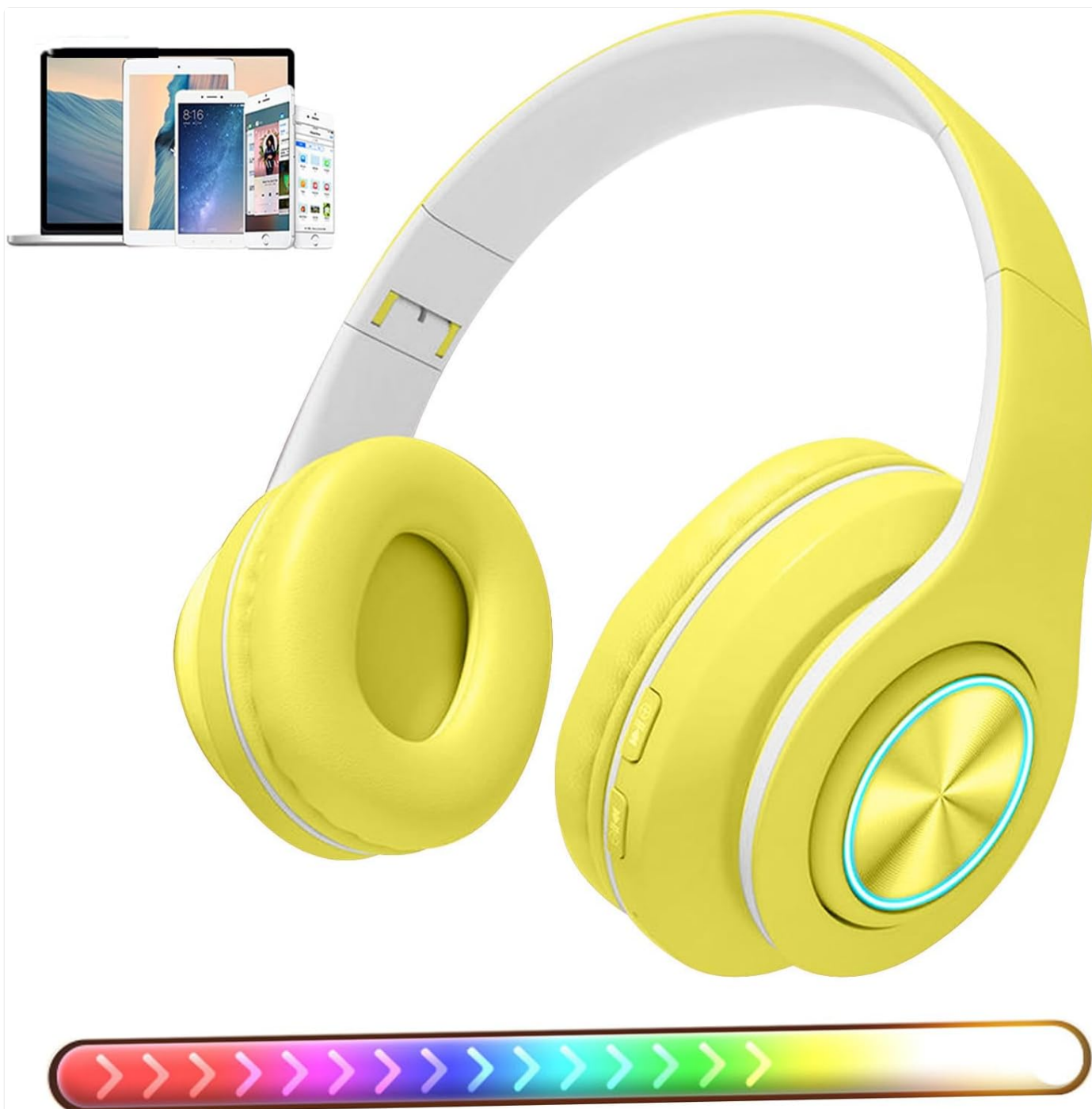
Image: E-Greetshopping B39 Bluetooth Over-Ear Headphones in yellow.

Thank you for choosing the E-Greetshopping B39 Bluetooth Over-Ear Headphones. This manual provides essential information for setting up, operating, and maintaining your headphones. Please read it carefully to ensure optimal performance and longevity of your device.