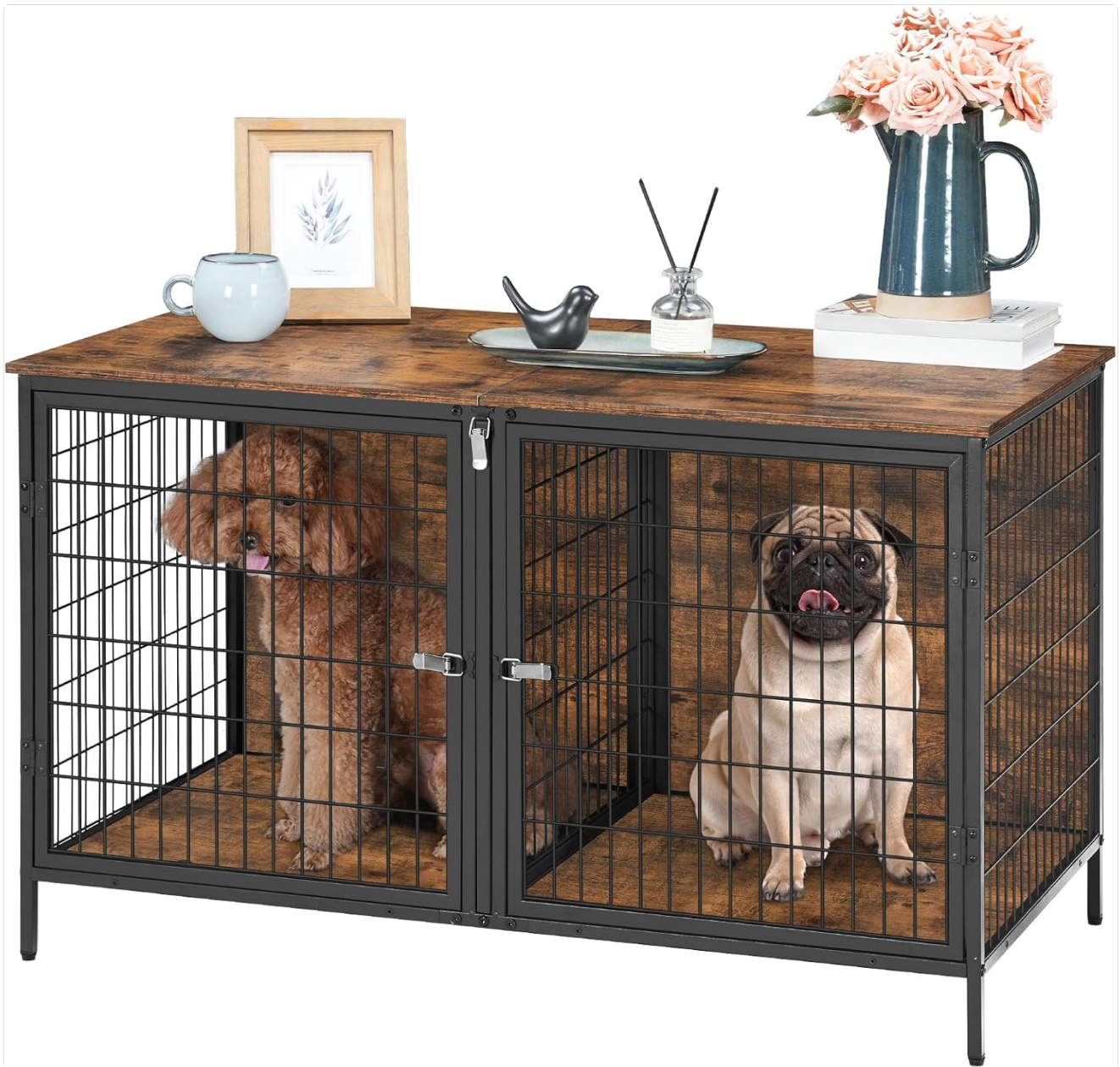
Figure 5.3: Two dogs inside the crate, demonstrating door access.