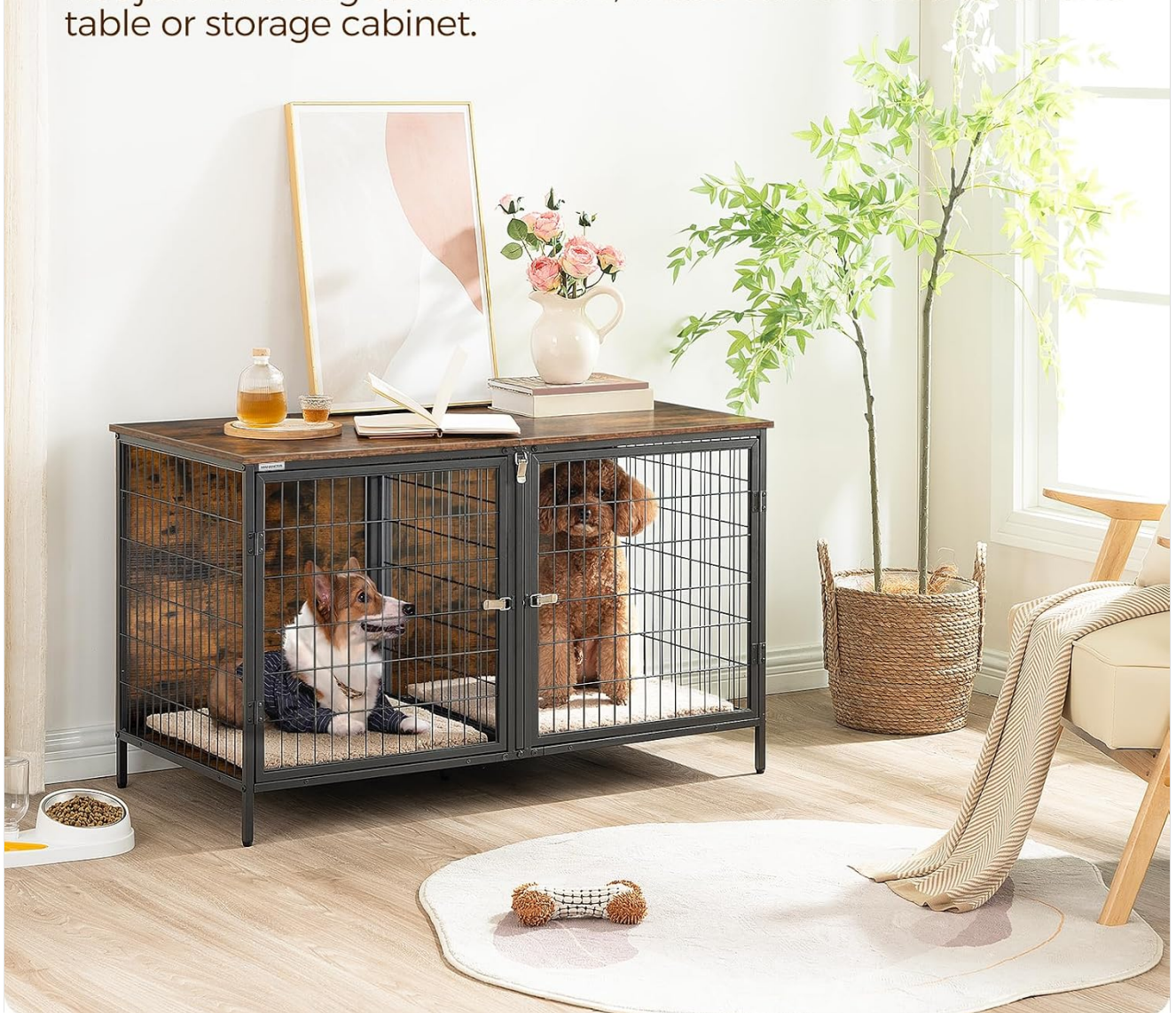
Figure 4.1: Assembled MAHANCRISS DCHR1201 Dog Crate Furniture.

Not just for a dog crate furniture, It also can be used as an end table or storage cabinet.