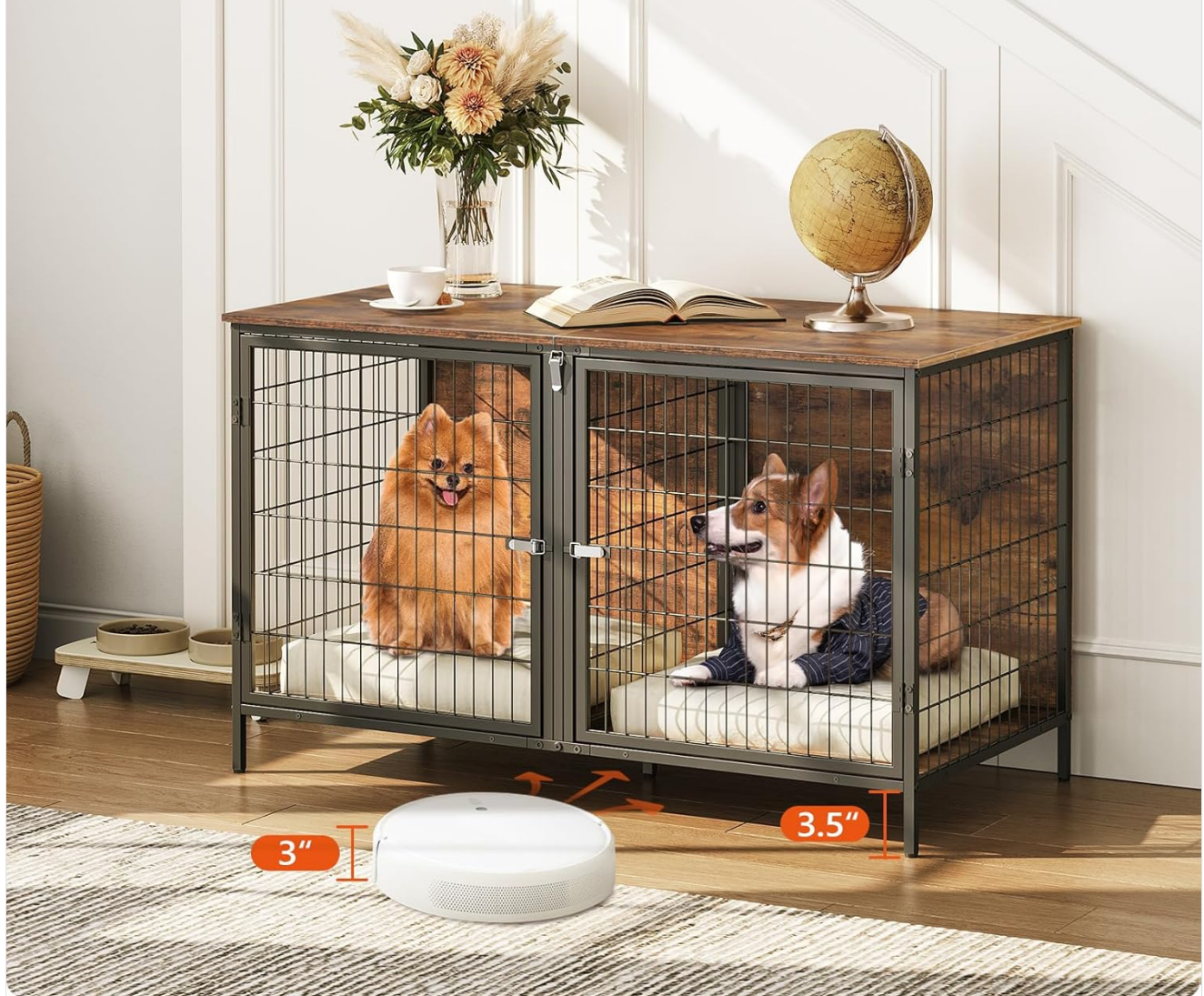
Figure 6.1: Elevated design allows for easy cleaning underneath the crate.

Ample spacing at the bottom simplifies daily cleaning.