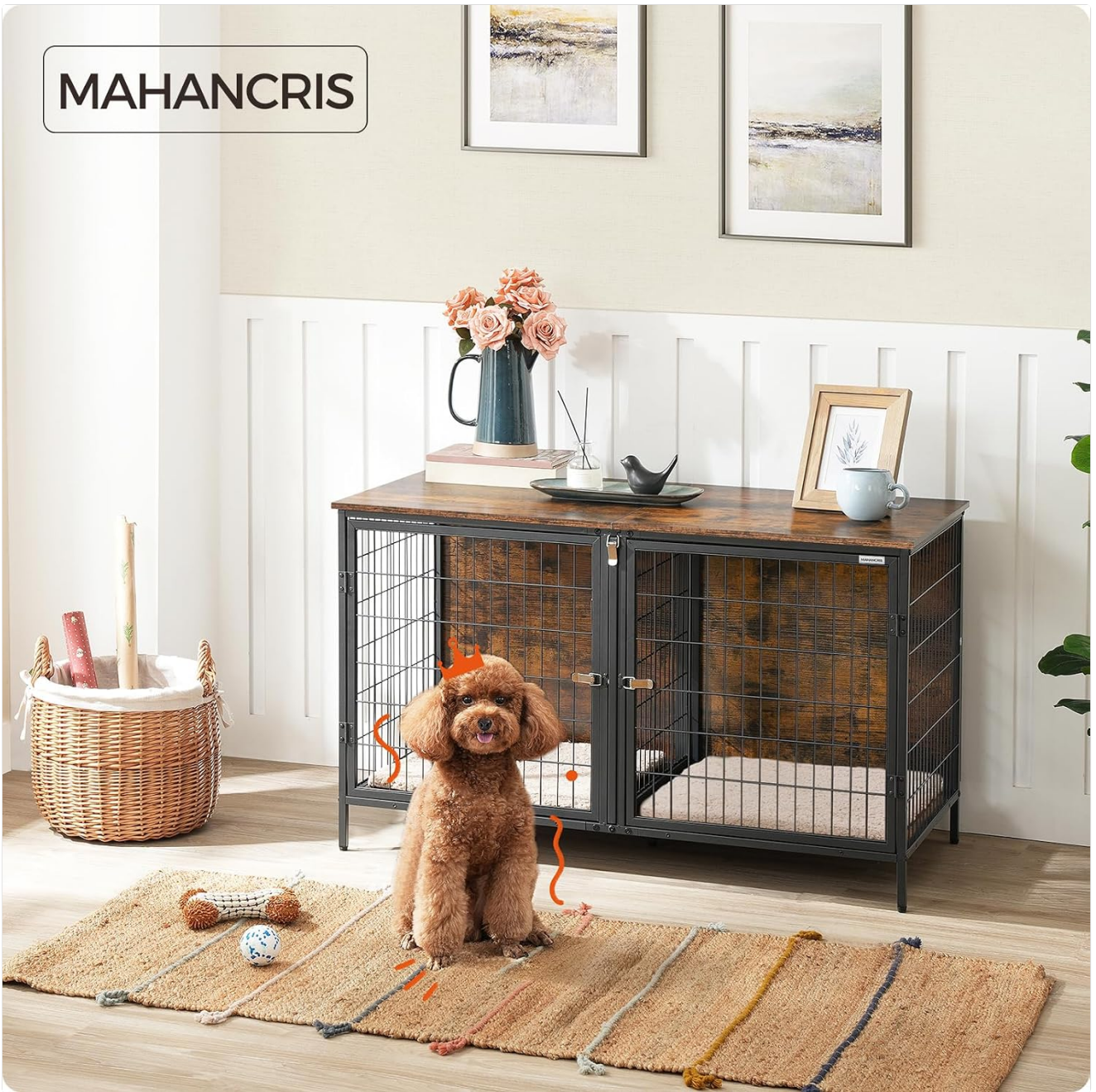
Figure 4.2: The DCHR1201 crate integrated into a home environment.