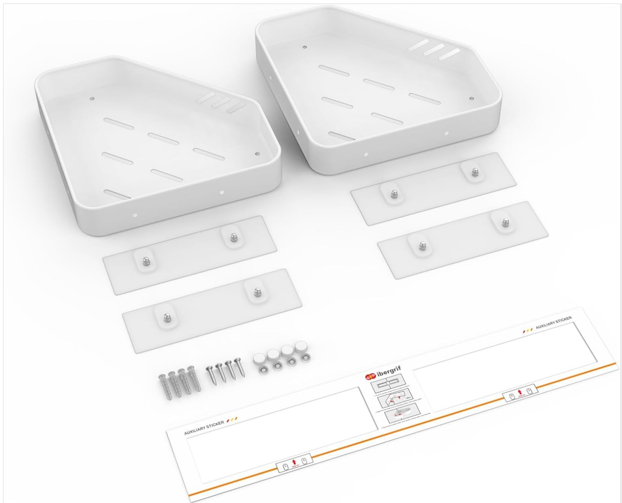
Image: A visual representation of all components provided in the package, including the two shelves and various mounting hardware.