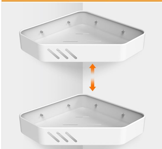
The spacing can be adjusted freely