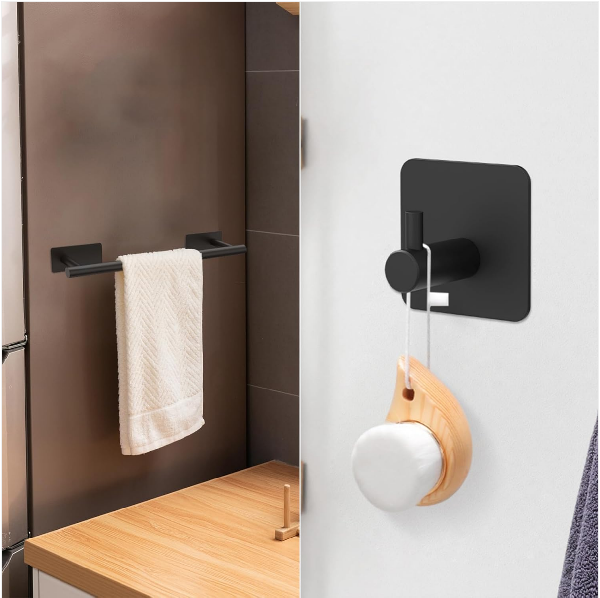
Image: Examples of the towel rail and wall hook in use within a bathroom setting.