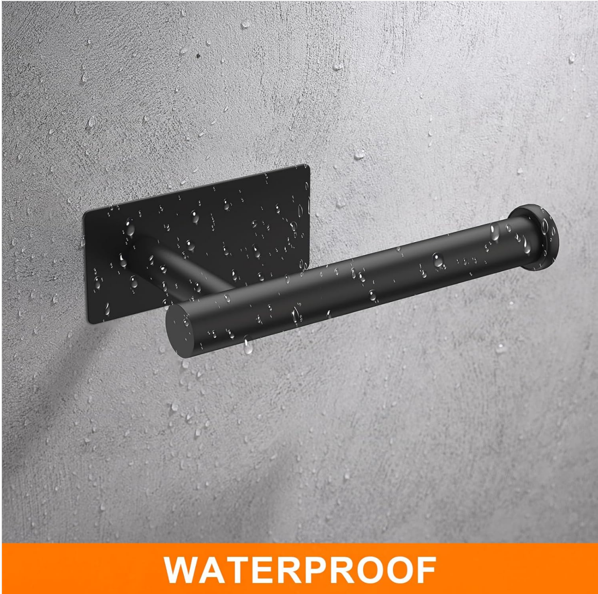
Image: The toilet paper holder demonstrating its waterproof properties, suitable for bathroom environments.