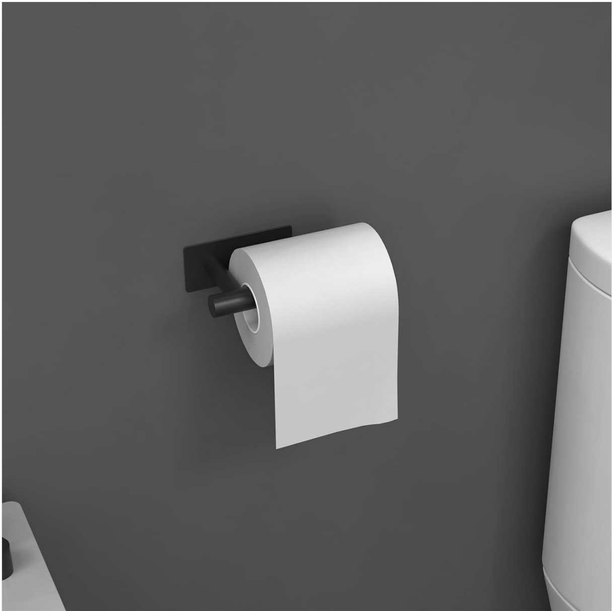
Image: The toilet paper holder installed and holding a standard toilet paper roll.