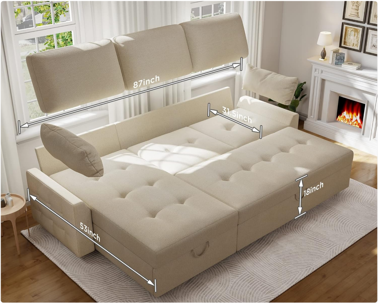
Image: Dimensional drawing of the sofa bed, indicating overall length, width, and height.

Detailed product specifications for the VanAcc Pull Out Sofa Bed.