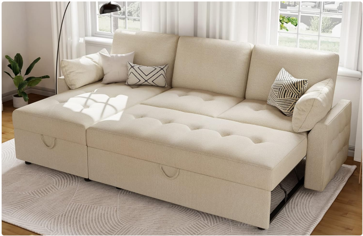
Image: The VanAcc Pull Out Sofa Bed in its sofa configuration within a living room.