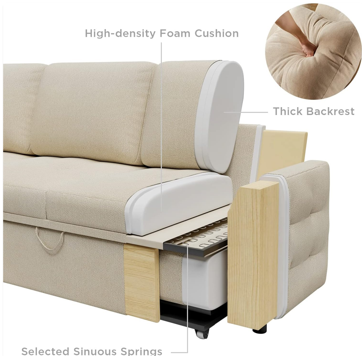
Image: An exploded view illustrating the internal components, including high-density foam cushions, thick backrest, and sinuous springs.

Image: Detailed view highlighting the elegant tufted design, high-density sponge, and arm pillow features.