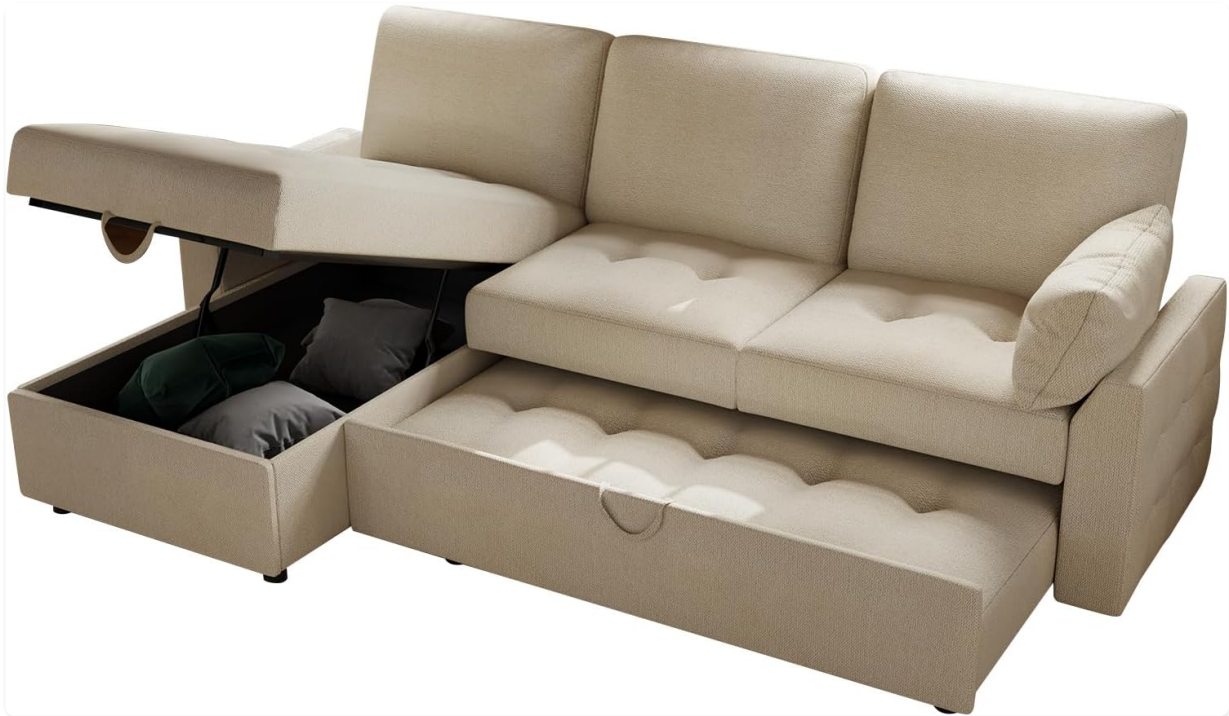
Image: The chaise section with its top lifted to show the internal storage, and the pull-out bed mechanism partially extended.