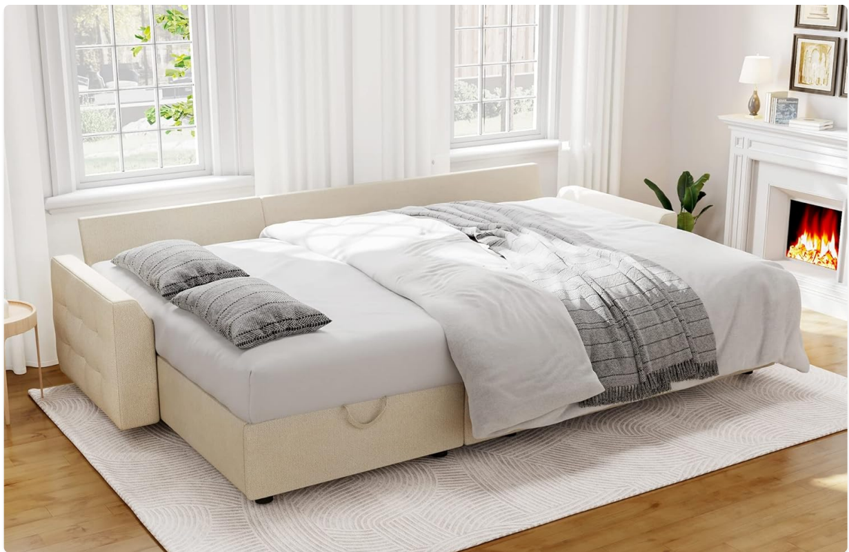
Image: The sofa bed in its fully extended sleeping position, ready for use.