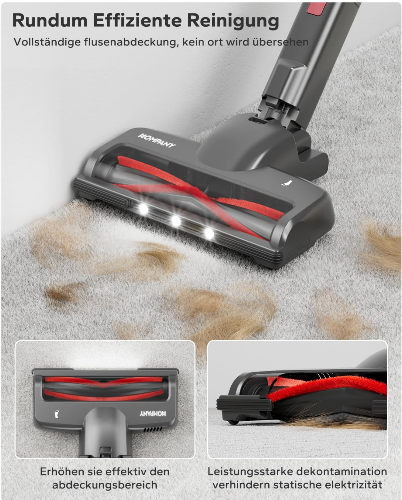
Figure 3.3: The motorized floor brush effectively removes pet hair and debris from carpeted surfaces, ensuring thorough cleaning.

Vollständige flusenabdeckung, kein ort wird übersehen