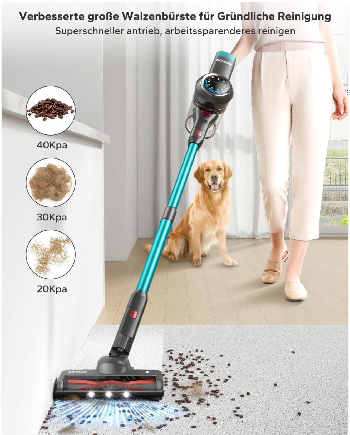
Figure 3.2: The vacuum demonstrates its ability to pick up various debris sizes, from fine dust to larger particles like coffee beans, across different suction levels.