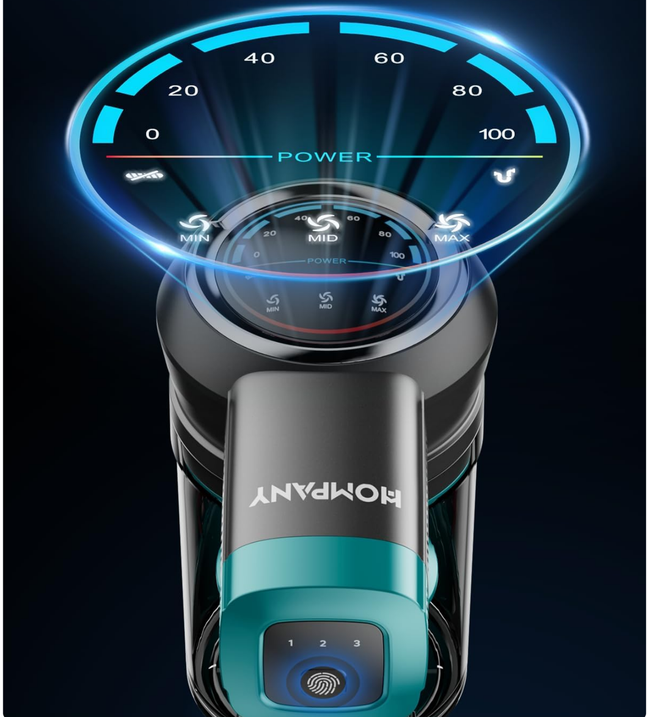
Figure 3.1: The intelligent LED display shows real-time battery level, current suction mode (MIN, MID, MAX), and error messages.

Erhalten sie den status des vakuums in echtzeit