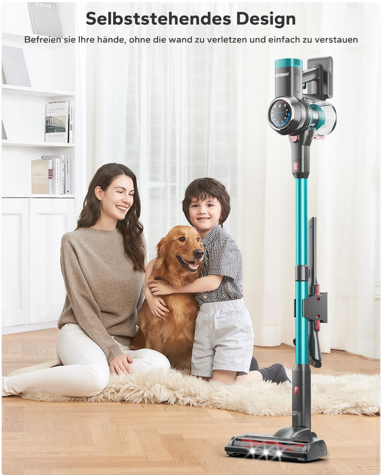
Figure 3.4: The vacuum stands freely, offering hands-free convenience during cleaning breaks or for easy storage.

Befreien sie Ihre hände, ohne die wand zu verletzen und einfach zu verstauen