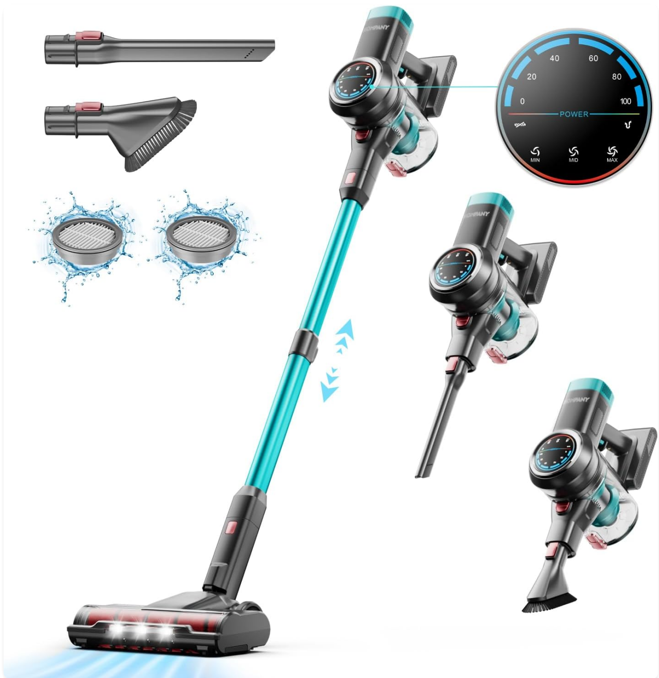
Figure 1.1: HOMPANY SmartVac 12 Cordless Vacuum Cleaner and included accessories. This image displays the main vacuum unit, extension wand, floor brush, crevice tool, dusting brush, and washable filters.