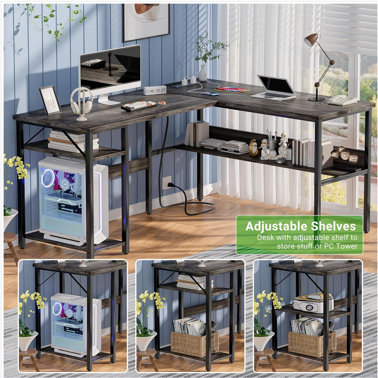
Figure 3: Adjustable shelves provide versatile storage for books, devices, or a computer tower.