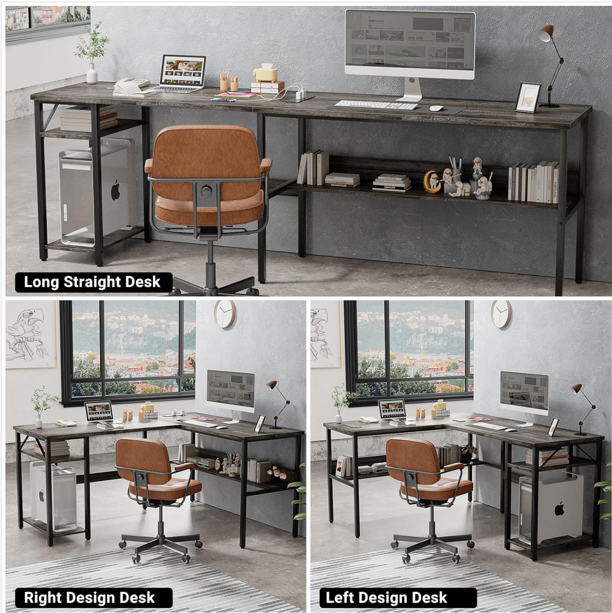
Figure 5: The desk can be assembled as a long straight desk, a right-oriented L-shaped desk, or a left-oriented L-shaped desk.