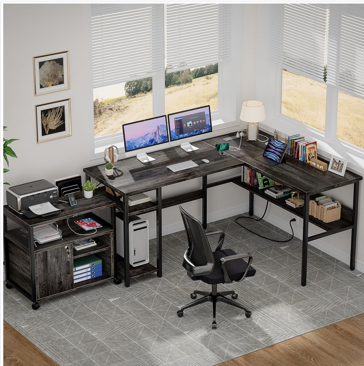
Figure 7: Example of the desk configured for a home office environment.