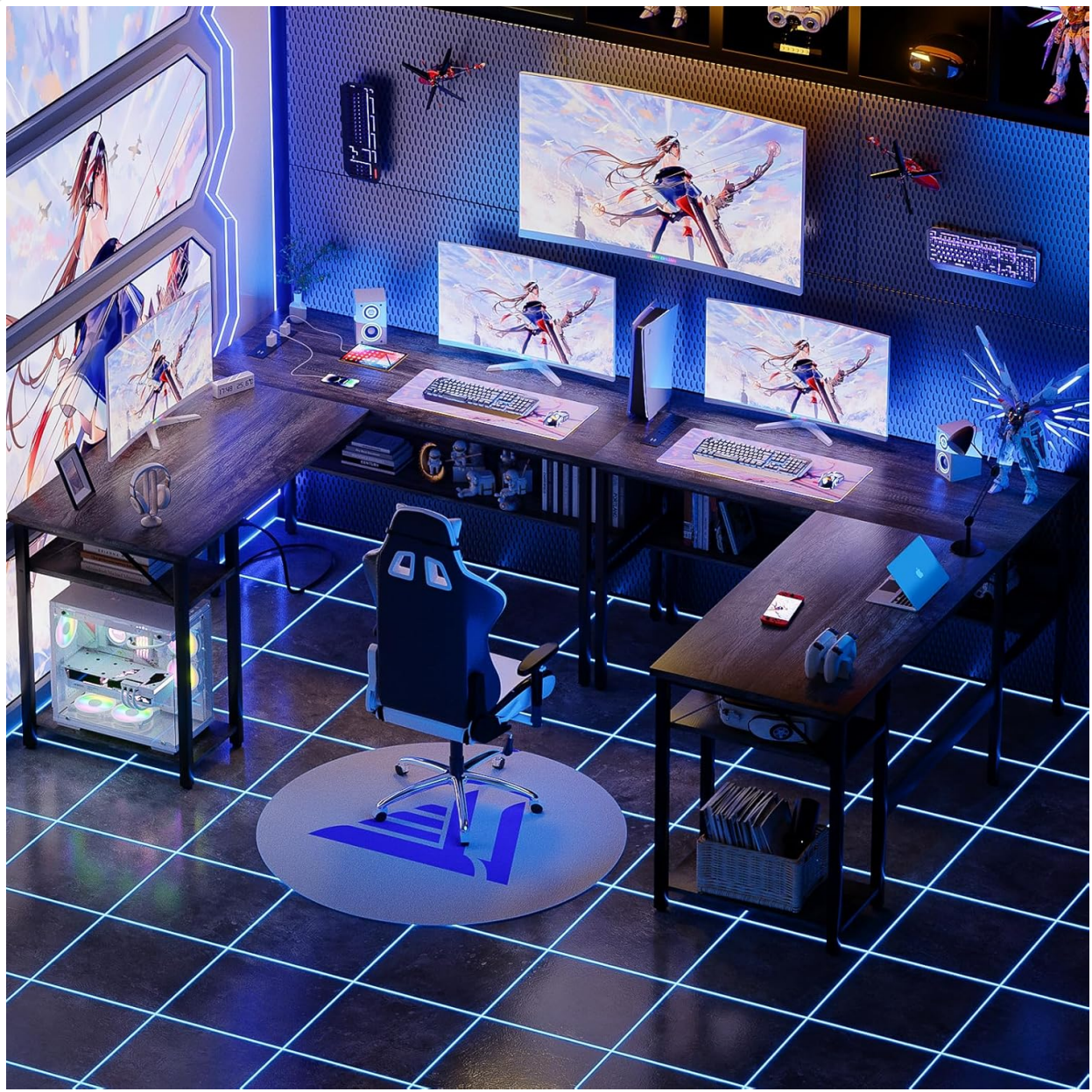
Figure 8: Example of the desk configured for a gaming setup.