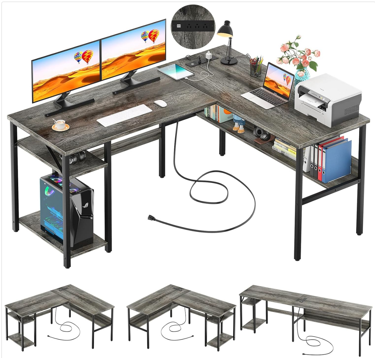
Figure 1: Overview of the Unikito L Shaped Desk, highlighting its reversible design and integrated power features.

Carefully unpack all components and lay them out on a clean, soft surface to prevent scratches. Identify each part using the provided labels and the parts list in your manual.