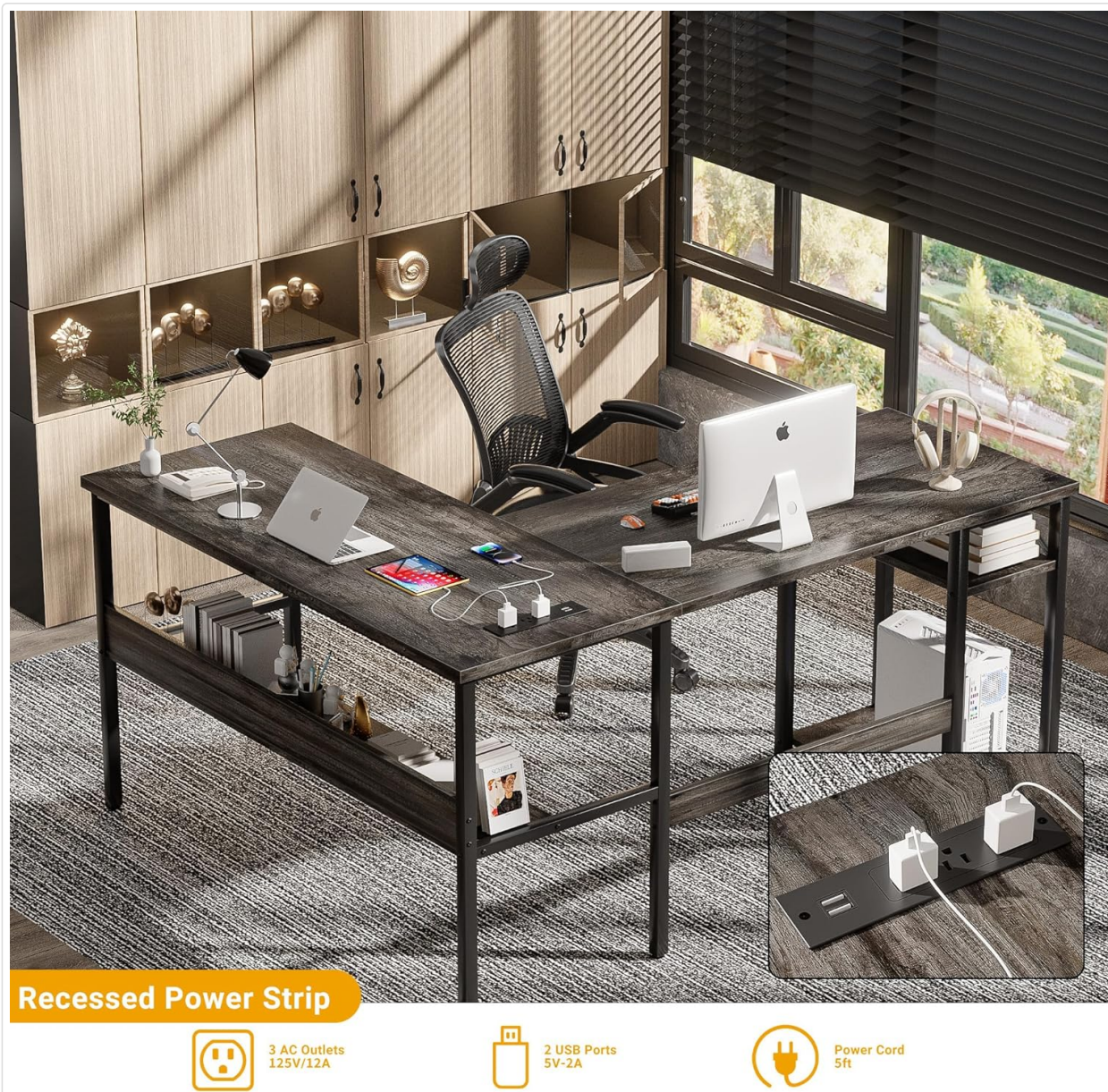
Figure 4: The integrated power strip offers convenient access to charging for multiple devices.