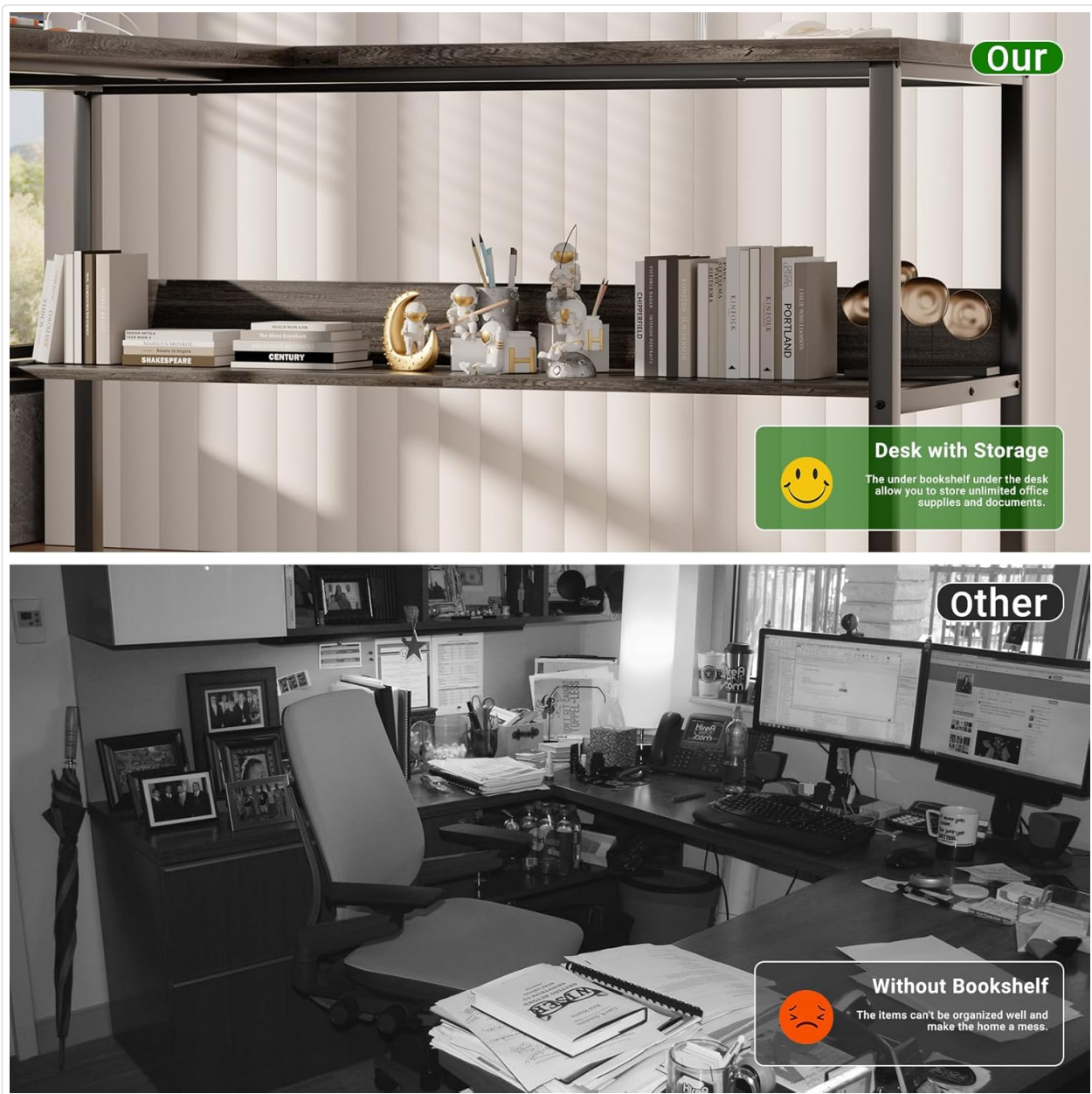
Figure 6: The under-desk shelves provide convenient storage, keeping your workspace organized.