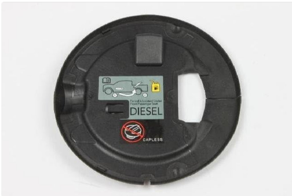
Figure 2: Mopar 68158887AH Seal Detail

This diagram illustrates typical components of a fuel filler door assembly. 1: Fuel Filler Door, 2: Mounting Hardware, 3: Fuel Filler Neck, 4: Fuel Filler Door Seal (Mopar 68158887AH).