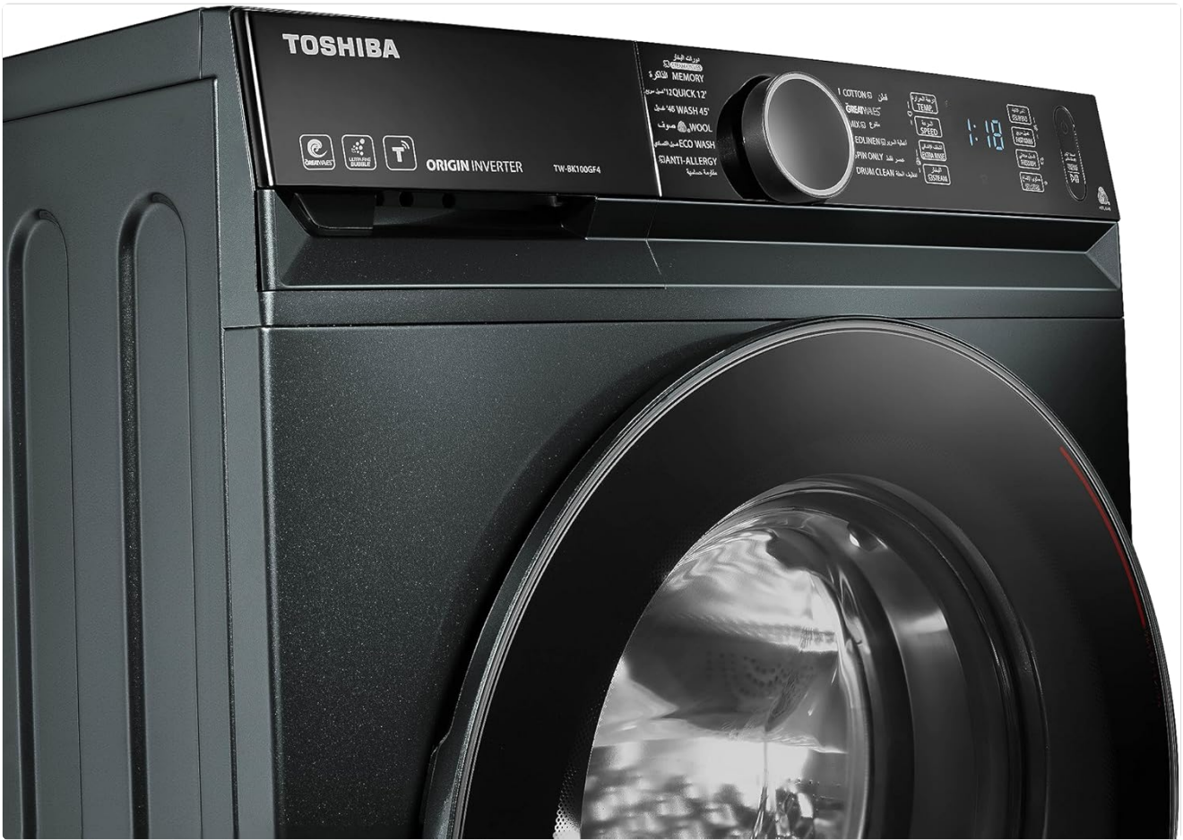
Image: Detailed view of the control panel, showing the program dial, buttons, and digital display.

The washing machine features a control console with buttons for program selection and settings adjustment.