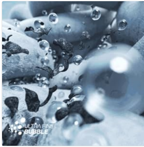
Image: Visual representation of Ultra Fine Bubbles working to clean fabrics.