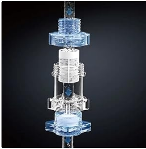
Image: Cross-section diagram of the Water Shield Filter, showing its multi-layered design to prevent debris entry.