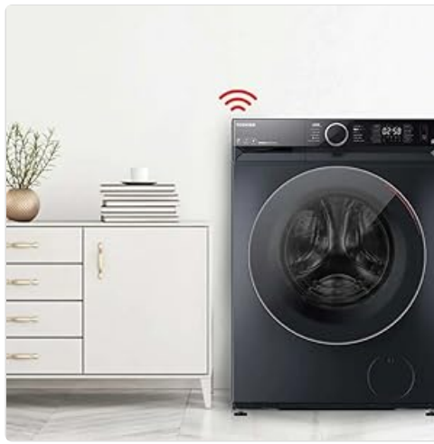
Image: The washing machine positioned in a room, with a Wi-Fi symbol above it, illustrating its smart connectivity feature.