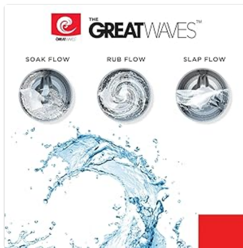
Image: Diagram showing the different water flow patterns (Soak, Rub, Slap) utilized by GREAT WAVES technology.