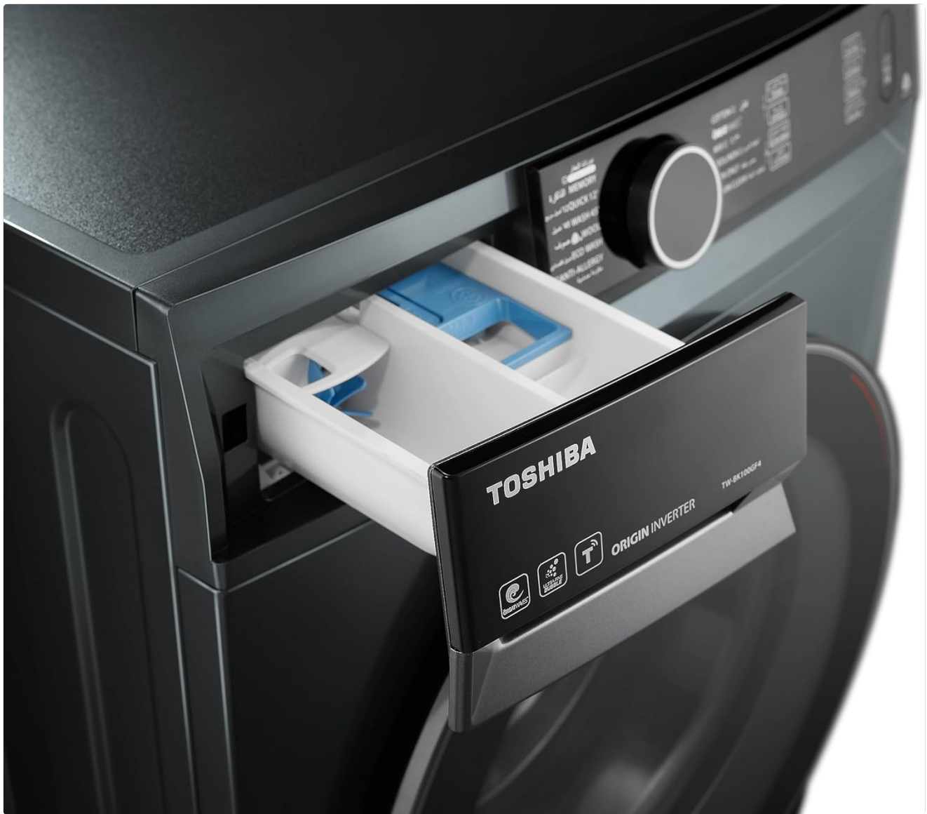
Image: The detergent dispenser drawer, showing compartments for detergent and softener.