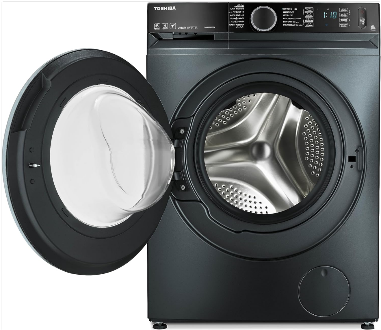
Image: The washing machine with its door open, revealing the stainless steel drum and interior.