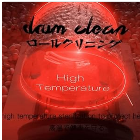
Image: Graphic depicting the high-temperature Drum Clean cycle for sterilization.

Regularly use the Drum Clean function to maintain hygiene and prevent odor buildup. This cycle uses high temperatures for sterilization.