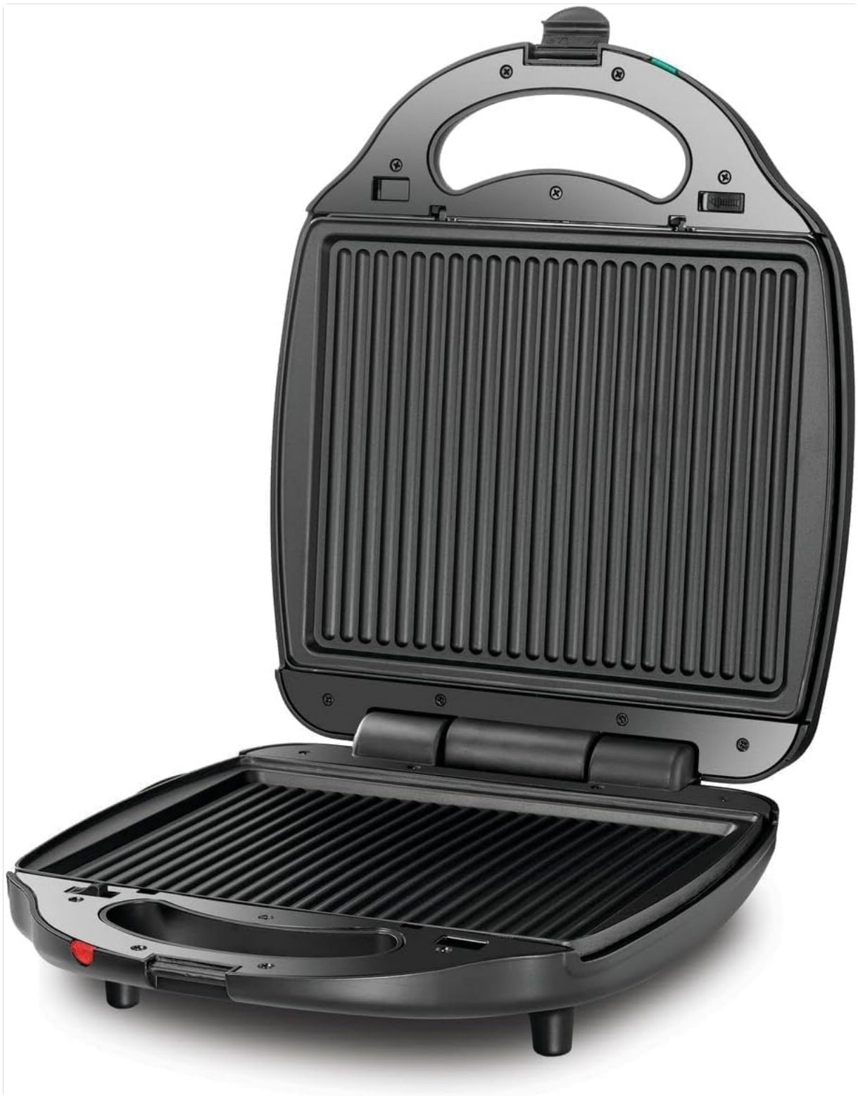
Figure 3: The appliance shown in an open position with the grill plates securely installed. This view highlights the non-stick surface and the heating elements.