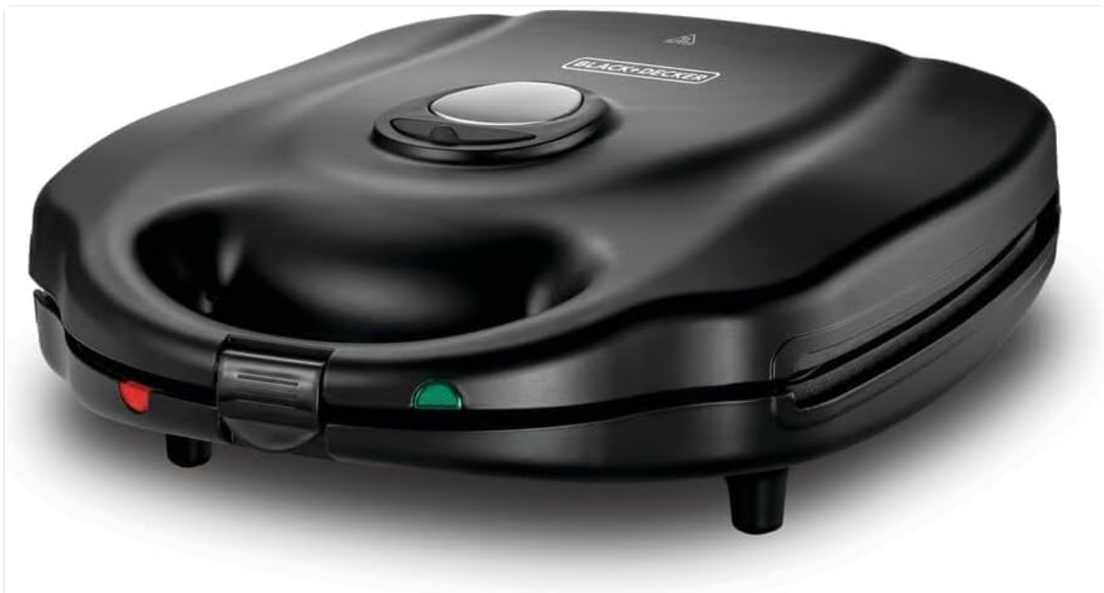
Figure 1: The Black & Decker TS4130-B5 3-in-1 appliance in its closed, compact form. This image displays the sleek black exterior with indicator lights and the central latch mechanism.

This manual provides essential instructions for the safe and efficient operation, maintenance, and care of your Black & Decker TS4130-B5 3-in-1 appliance. This versatile unit functions as a grill, waffle maker, and sandwich maker, featuring interchangeable non-stick plates for various culinary tasks. Please read this manual thoroughly before first use and retain it for future reference.