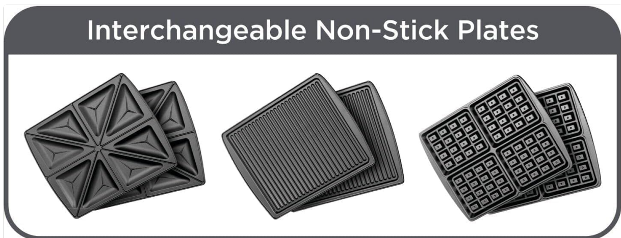
Figure 2: The three types of interchangeable non-stick plates included with the appliance: sandwich plates (left), grill plates (center), and waffle plates (right).