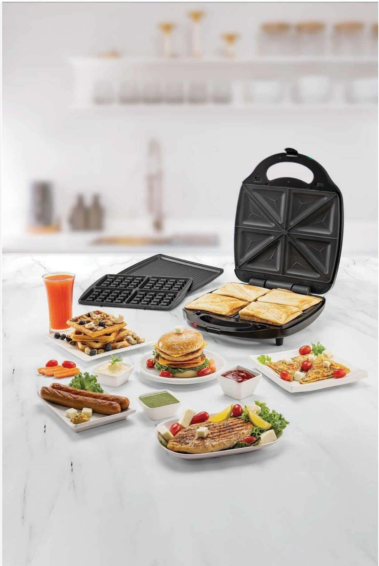
Figure 5: A display of various dishes, including waffles, grilled meats, and toasted sandwiches, illustrating the versatility of the Black & Decker 3-in-1 appliance.