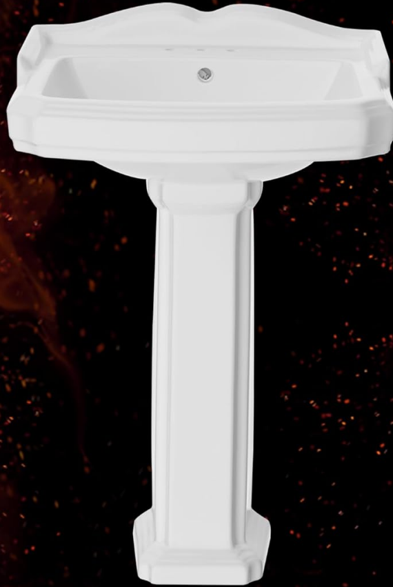
Image 5.1: The high-temperature firing process ensures low water absorption, easy cleaning, stain resistance, a glossy white finish, and fadeless color.