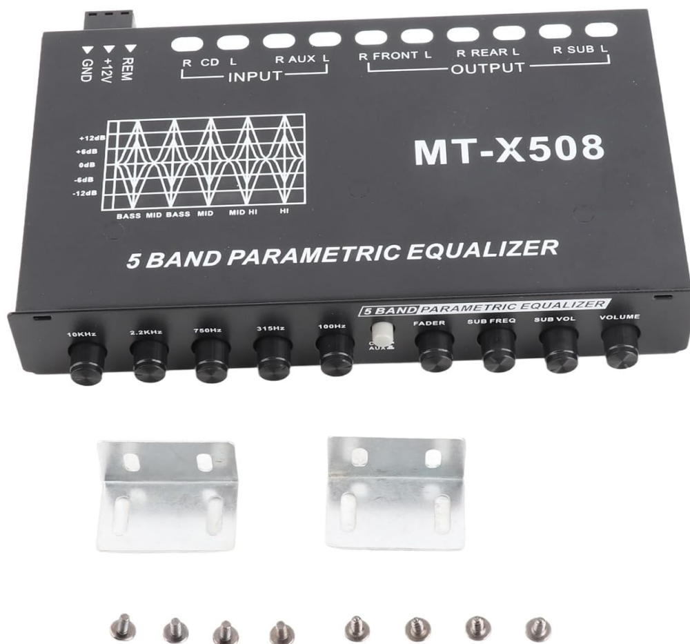
Figure 2: Tbest MT-X508 Equalizer and Included Accessories