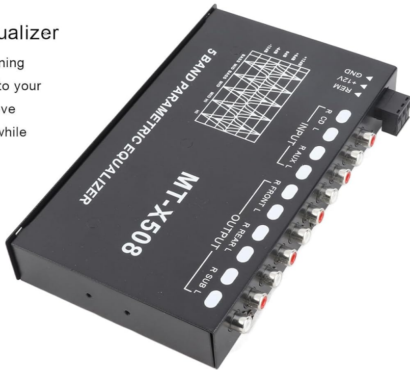
Figure 5: Front Panel Controls

5 bands for precise tuning Customize the sound to your preferences and achieve optimal audio quality while driving