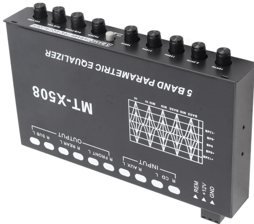
Figure 4: Rear Panel Connections