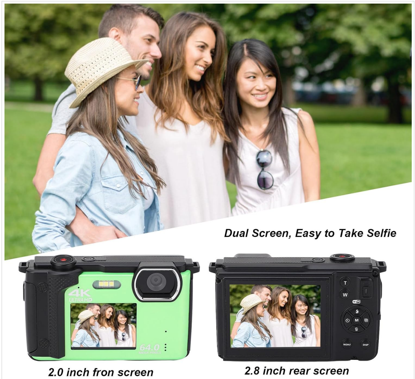
Image: Illustration of the dual screen functionality, showing how the front screen aids in taking selfies or group photos.

The camera features a 2.8-inch rear screen and a 2-inch front screen, ideal for self-portraits and vlogging.