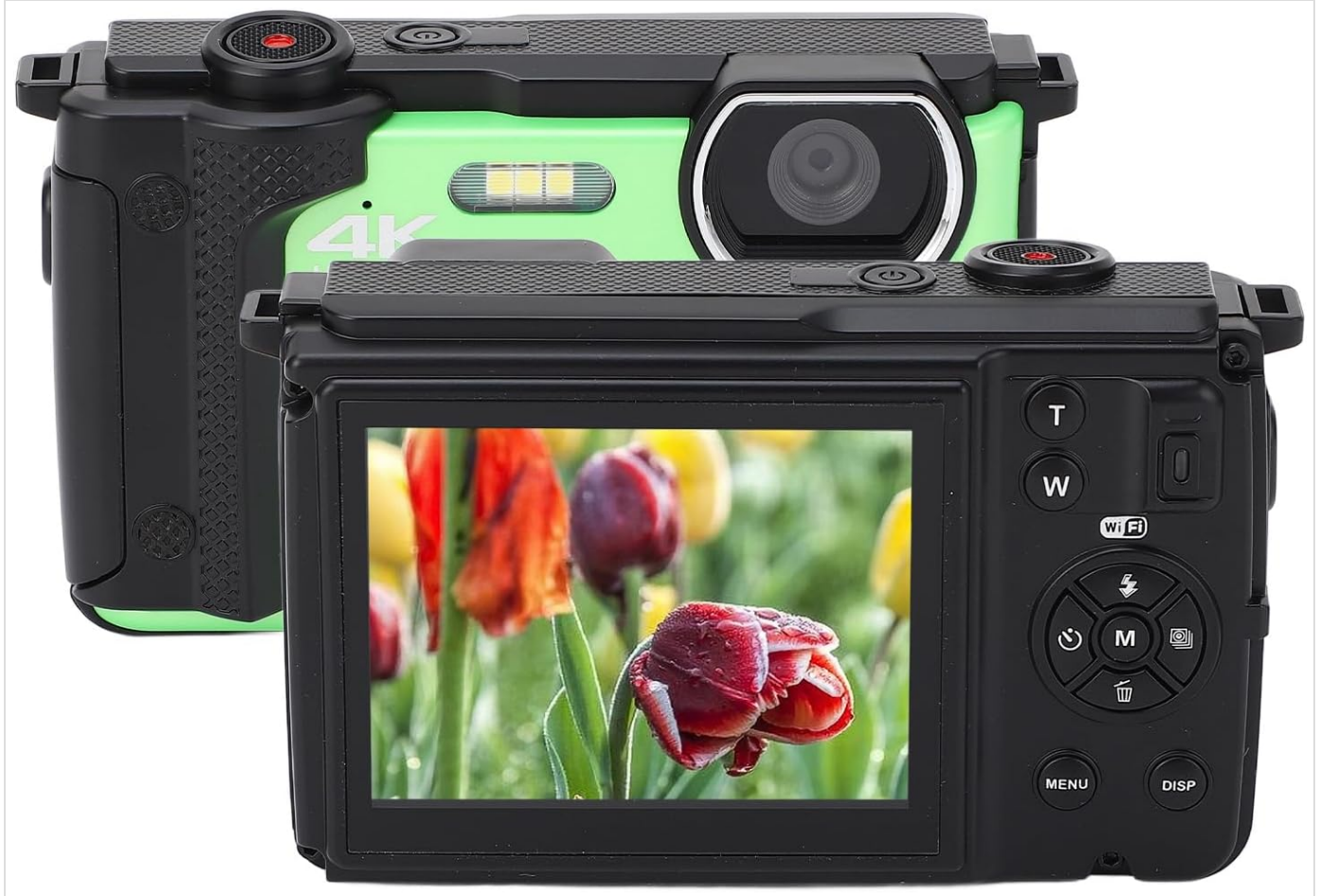
Image: Front and rear view of the Cuifati FS01 Digital Camera, showcasing the dual screens and main controls.

Familiarize yourself with the camera's components and controls.