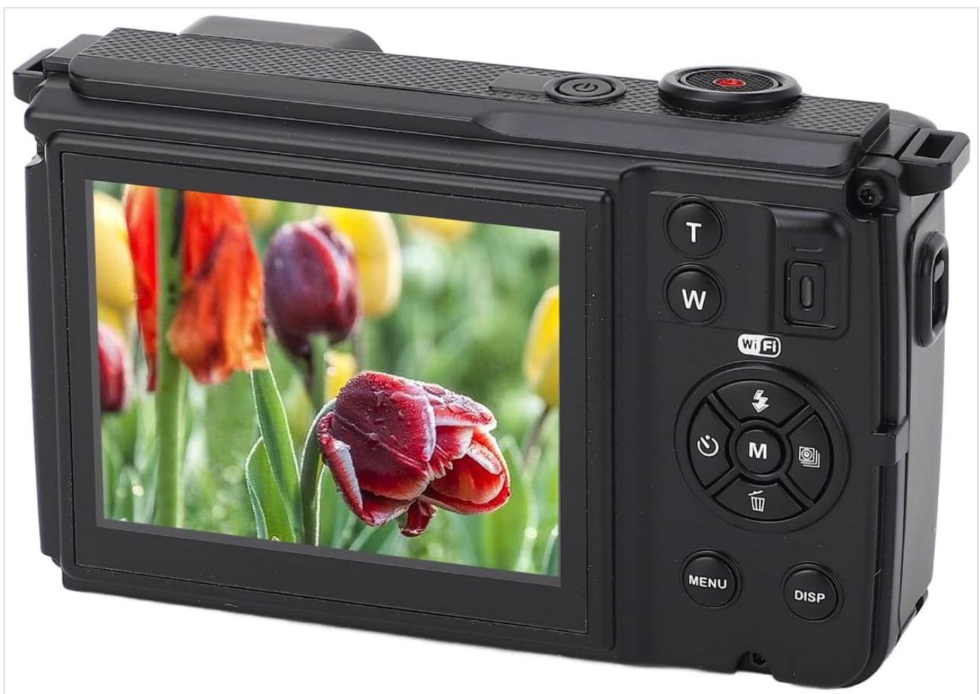
Image: Rear view of the camera, showing the main LCD screen and control buttons (T/W for zoom, WiFi, Flash, Mode, Delete, Menu, Display).