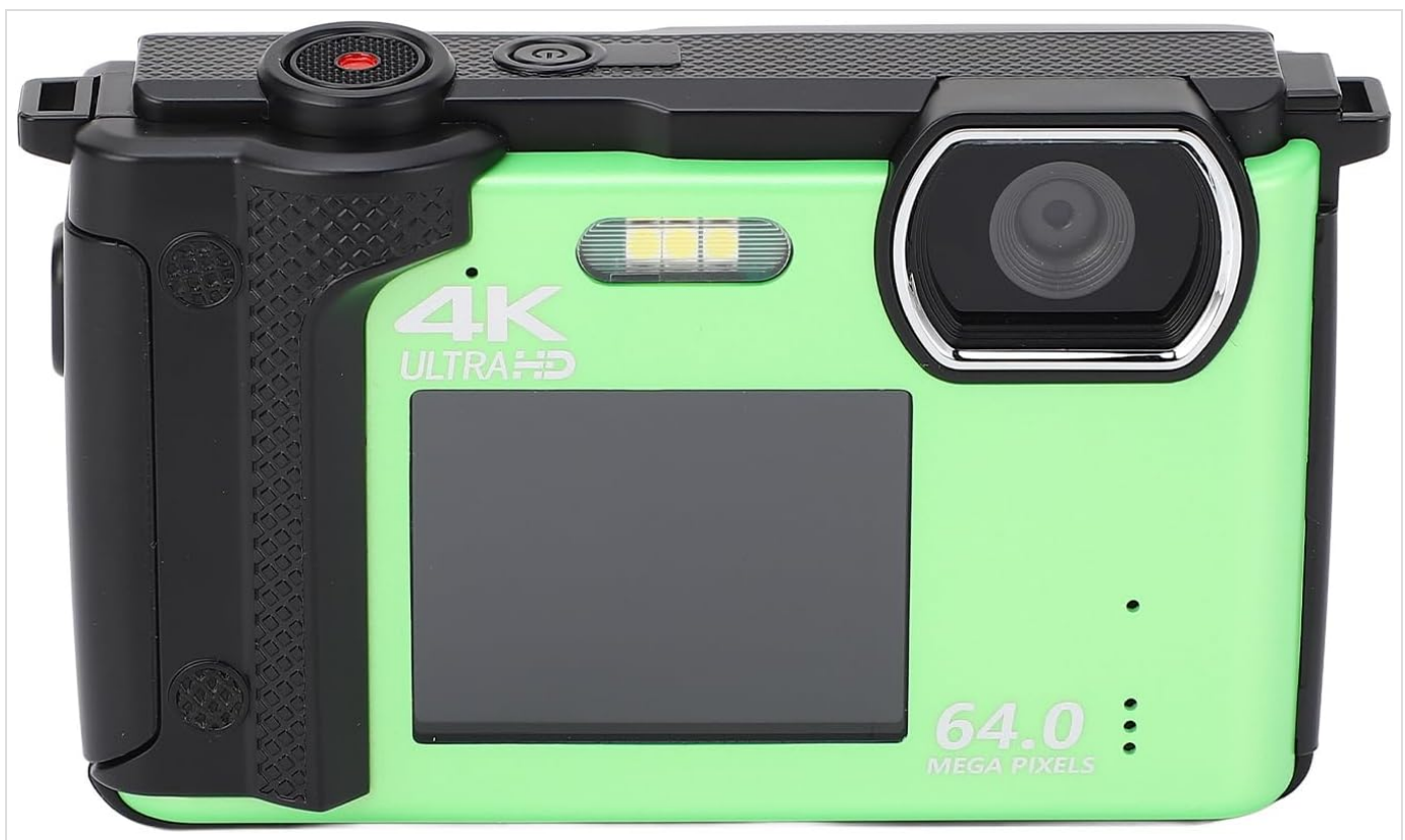
Image: Front view of the camera, highlighting the lens, flash, and front display.