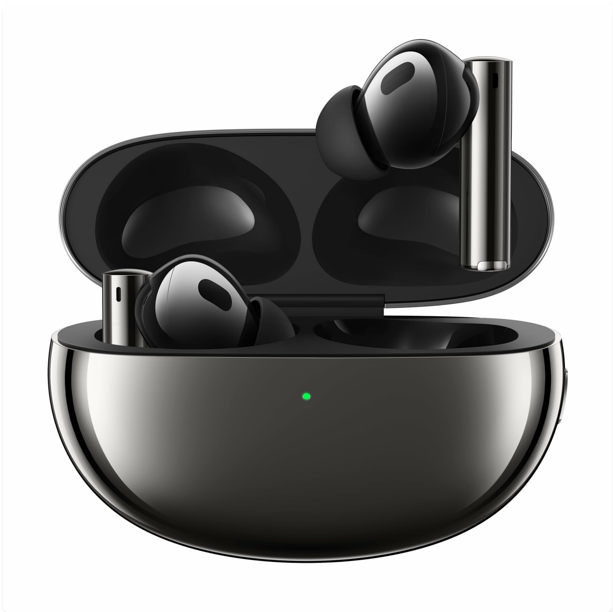
Image: realme Buds Air 5 Pro earbuds and charging case in Astral Black.