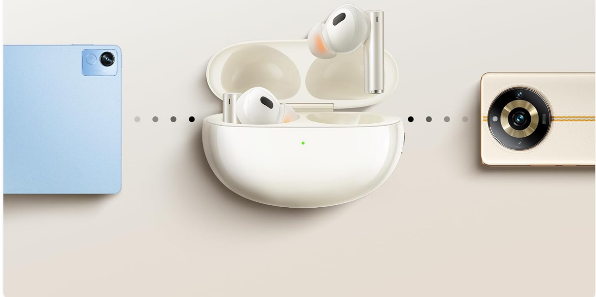
Image: Earbuds providing 40ms Super Low Latency for gaming.