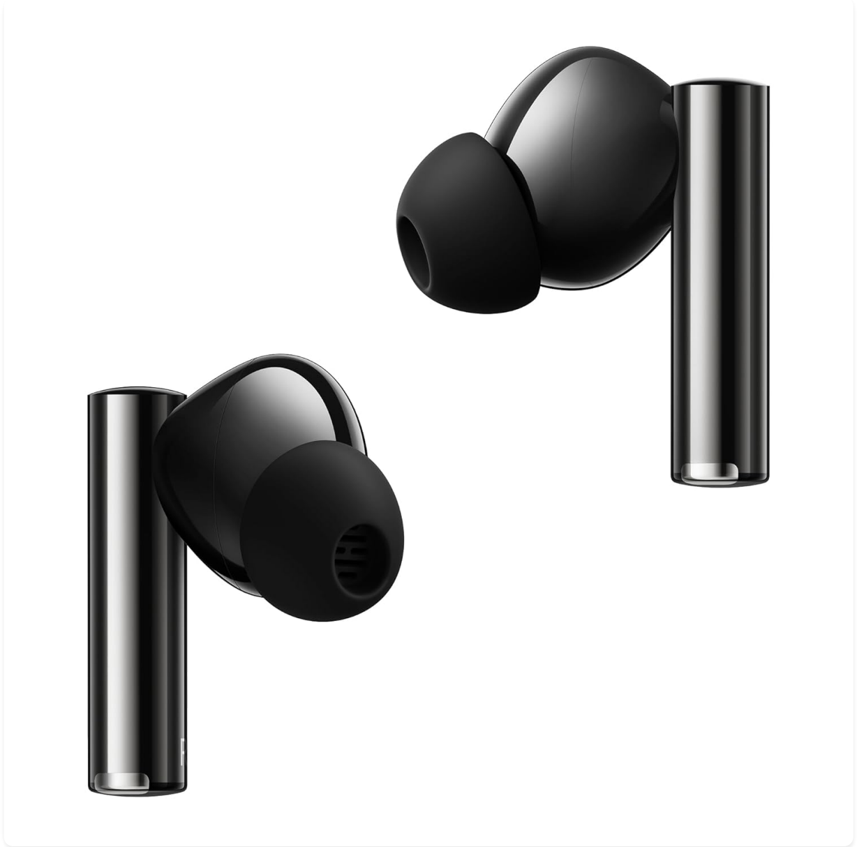
Image: Illustration of dual-device connection capability.