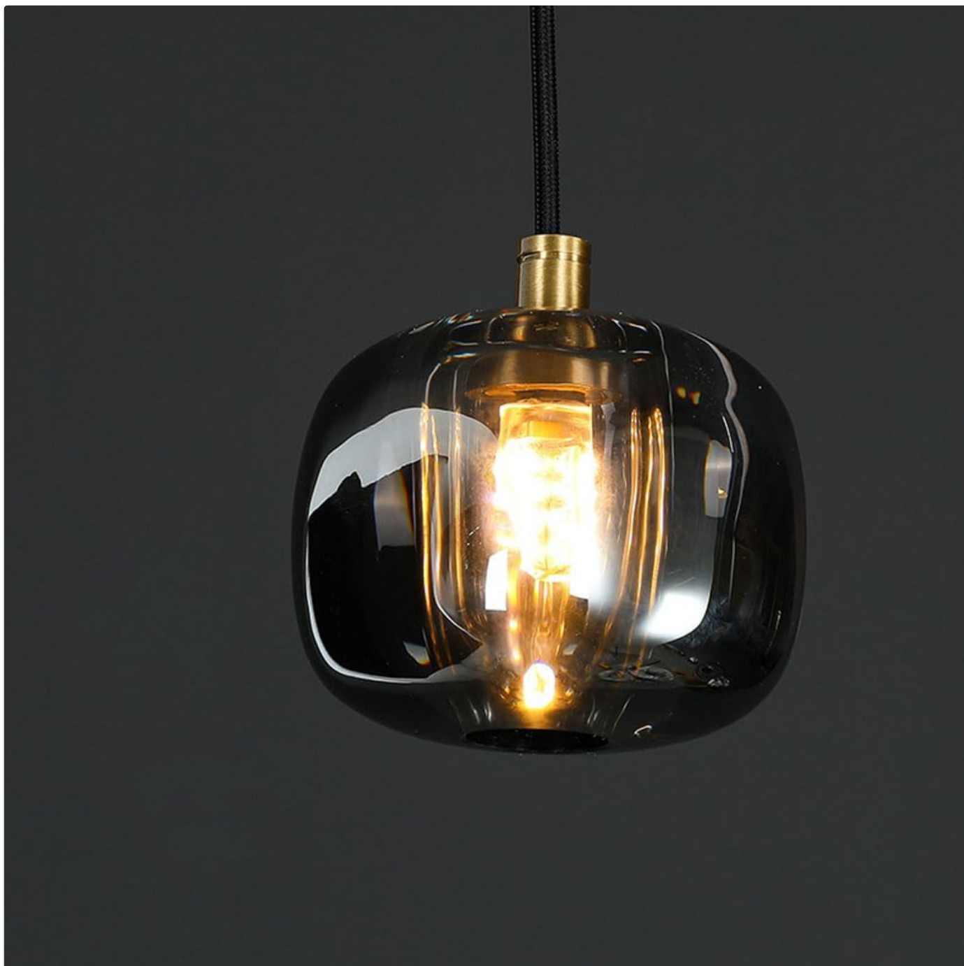
Image 5.1: Close-up of the G9 bulb socket within the crystal lampshade, illustrating where the bulb should be inserted during installation.