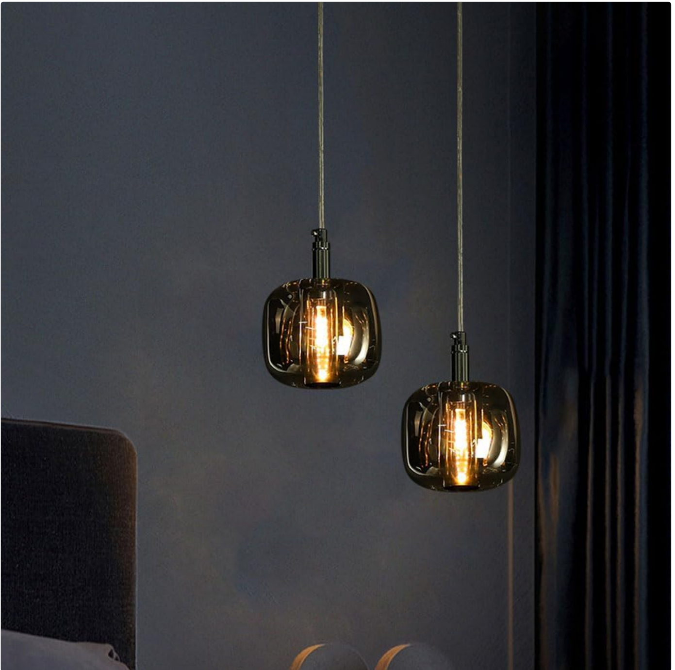
Image 6.1: The pendant lights in operation, showcasing their aesthetic appeal and the warm light they emit in a bedroom setting.