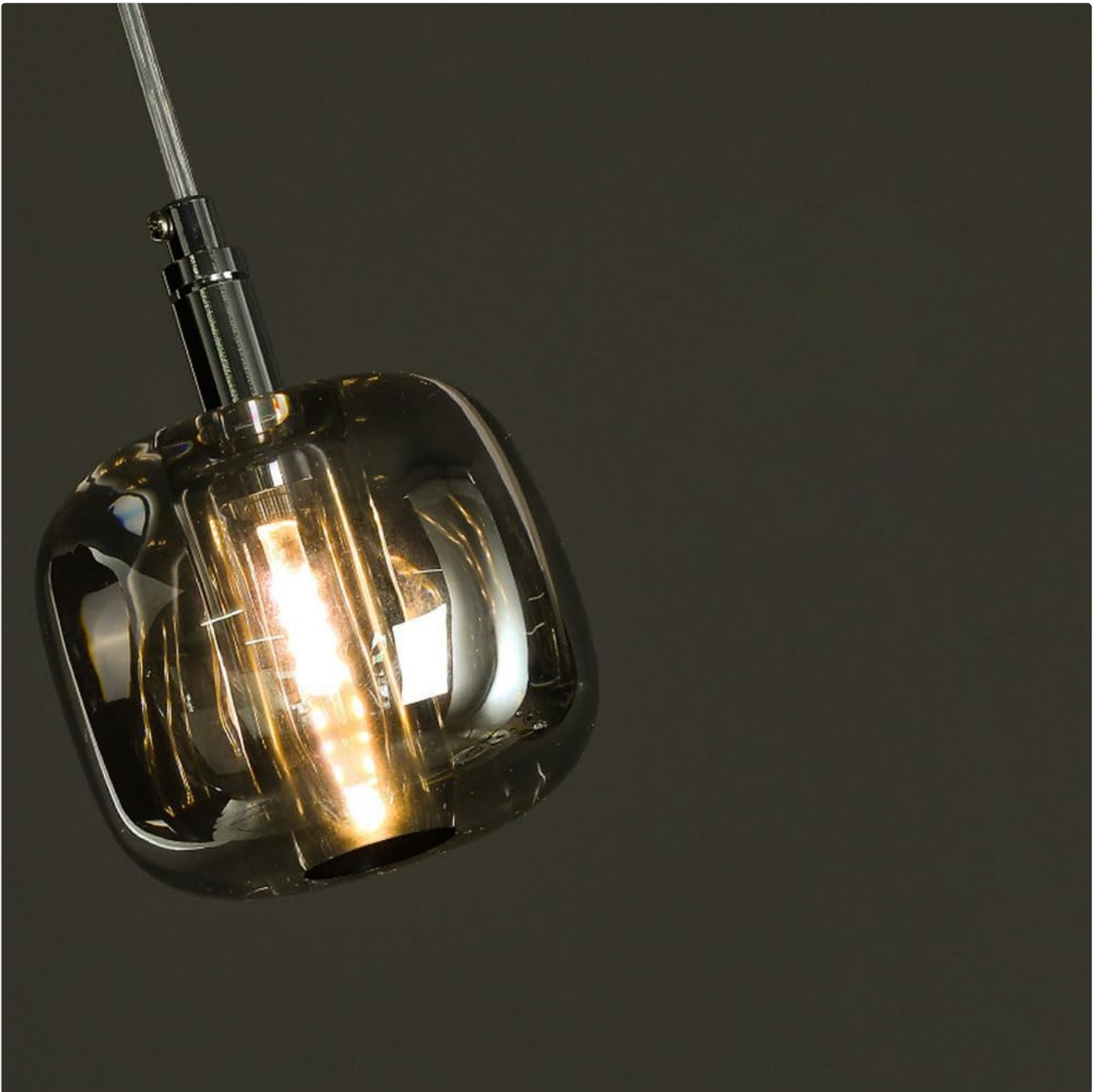
Image 7.1: Angled view of the pendant light, highlighting the crystal and brass elements that require regular cleaning to maintain their luster.