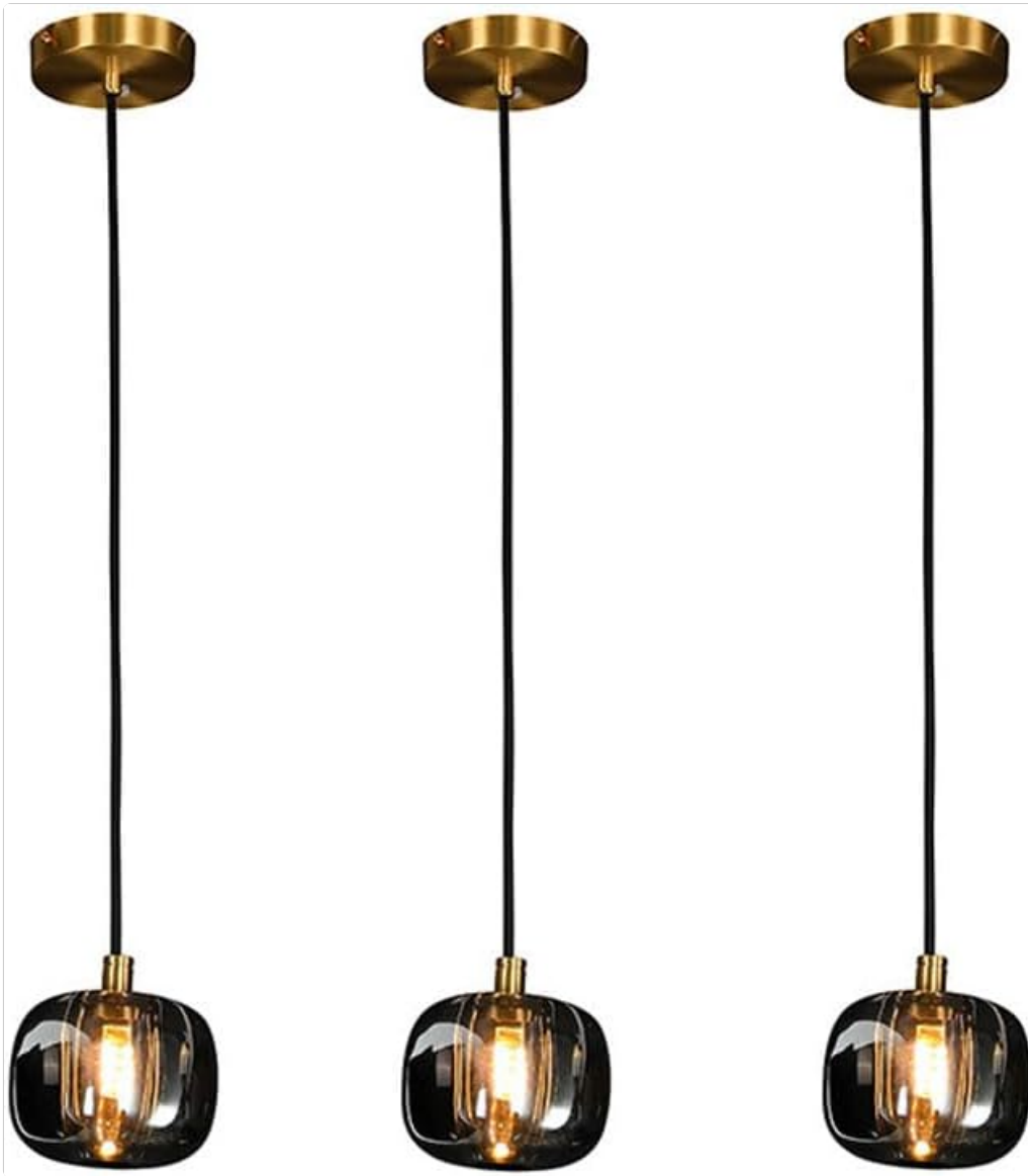
Image 1.1: Overview of the MODEBHD American Modern Pendant Light (3-Pack). These elegant fixtures feature a black crystal lampshade and brass-colored ceiling mounts, designed to provide ambient lighting.