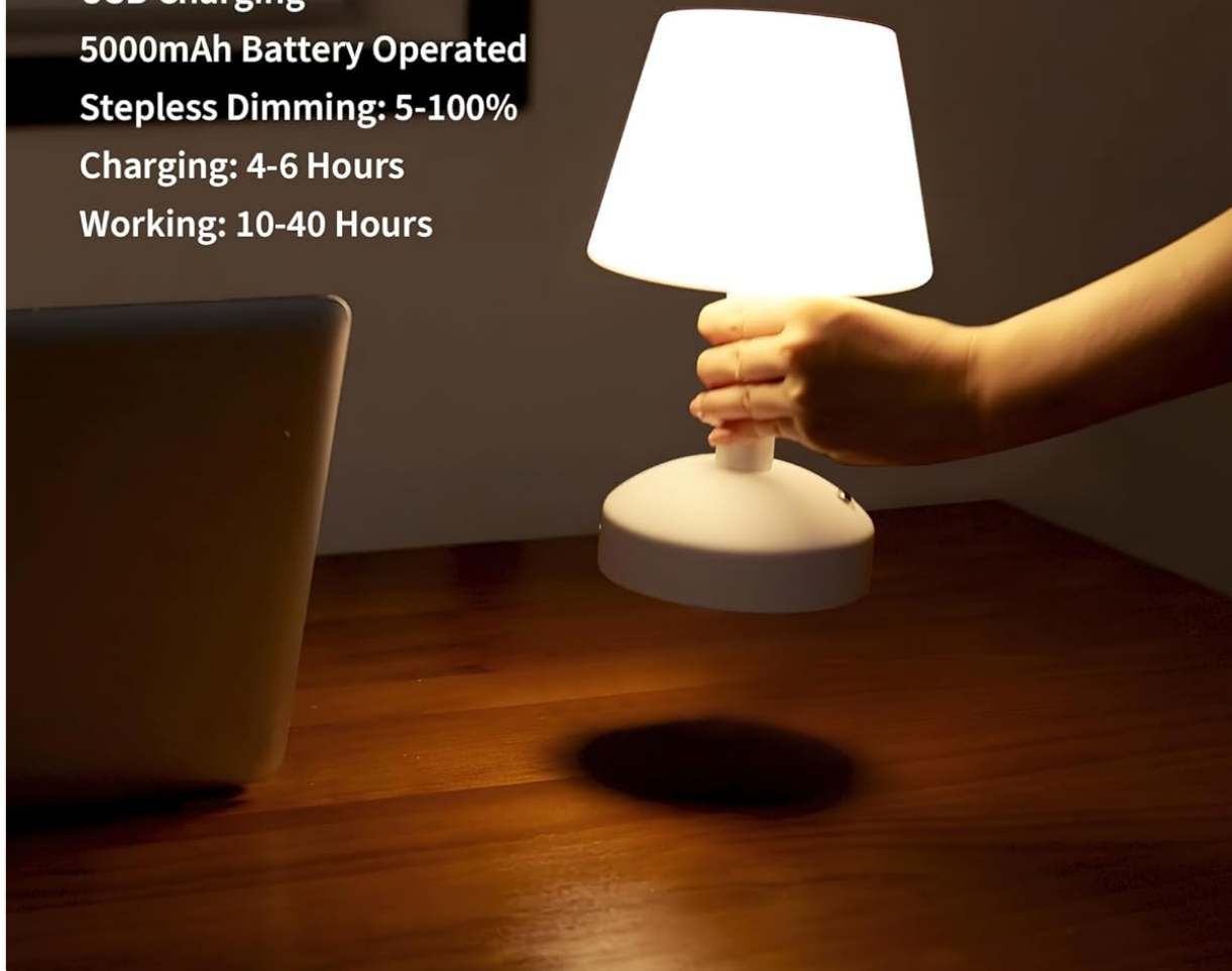
Image 2.1: Key features of the KDG Cordless Table Lamp, including warm light, USB charging, and dimming capabilities.