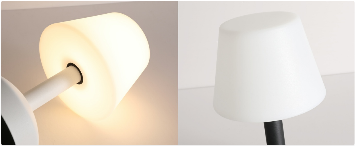
Image 6.1: Visual representation of the lamp's stepless dimming capability.