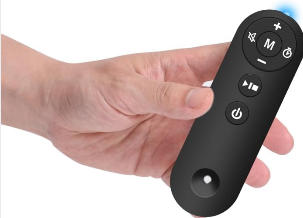
Image: A hand holding the remote control with instructions for pairing: 1. Turn on the power, 2. Hold the "+" button on the remote for 3 seconds, 3. The remote will beep until connected.