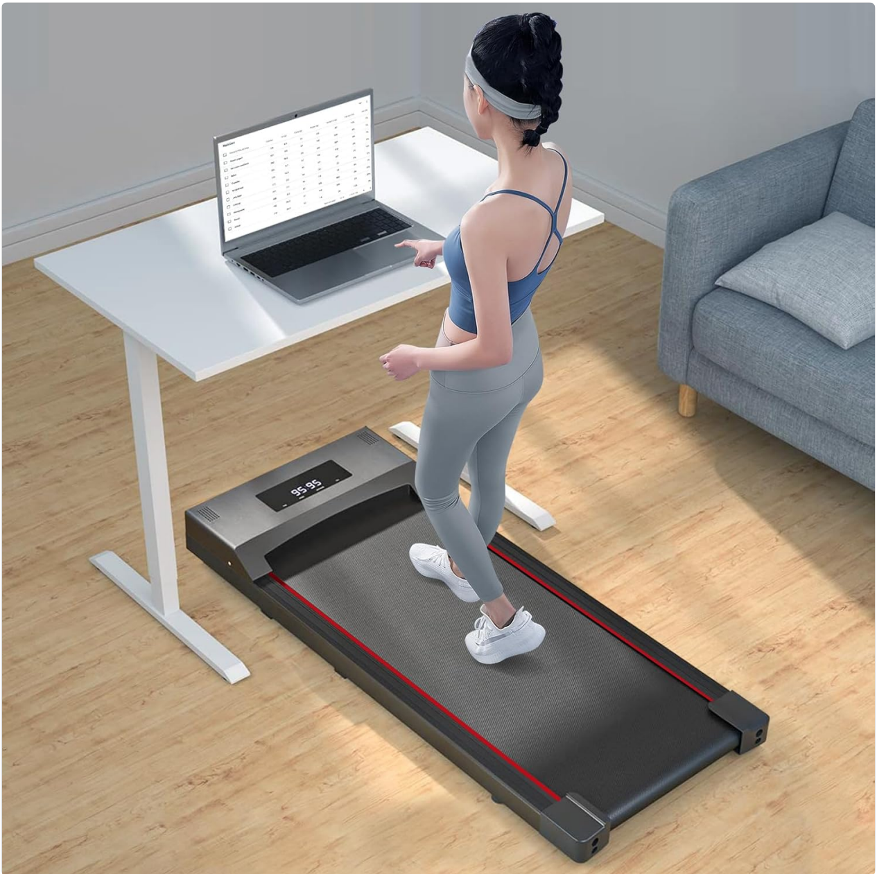
Image: A person walking on the Tvdu gim CR-A1 treadmill positioned under a standing desk, demonstrating its use in an office or home environment.