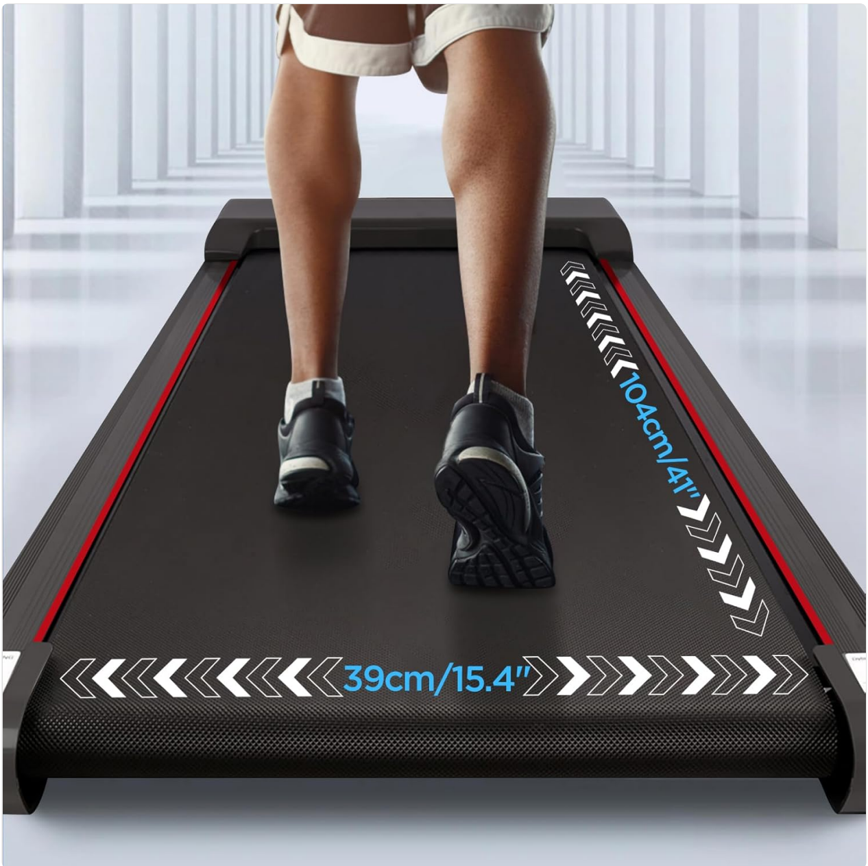
Image: Close-up view of the treadmill belt, indicating a walking area length of 104 cm (41 inches) and a width of 39 cm (15.4 inches).