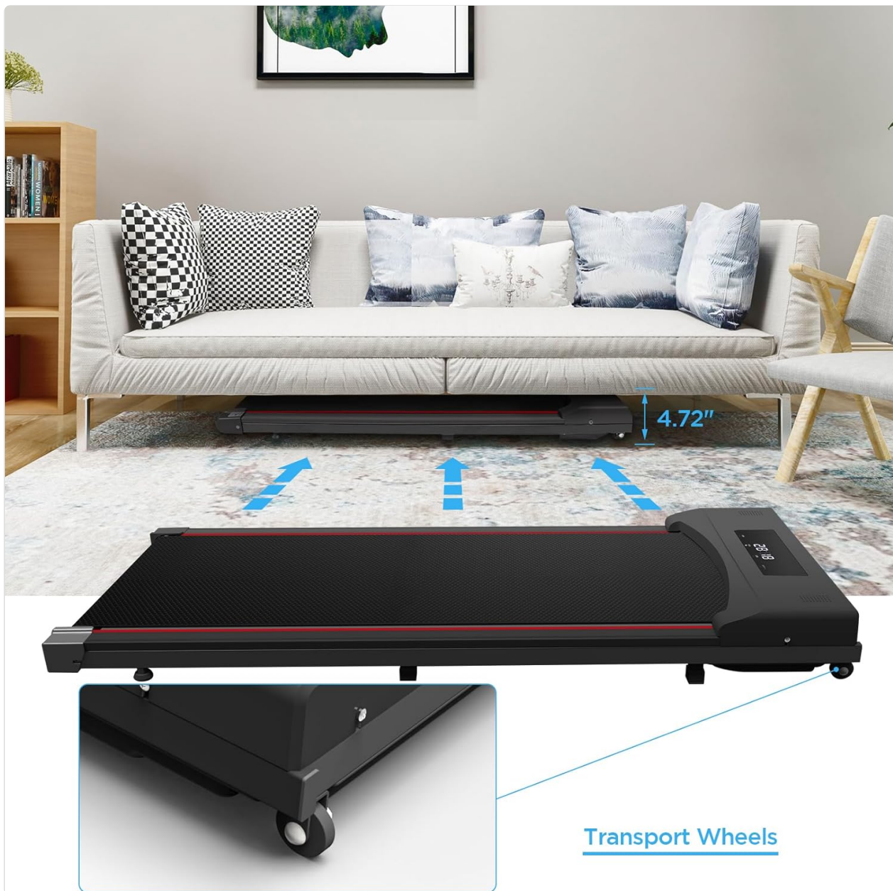
Image: The treadmill shown being stored underneath a sofa, illustrating its compact design. An inset image highlights the built-in transport wheels for easy relocation.

The Tvdugim CR-A1 is designed for easy storage and portability.