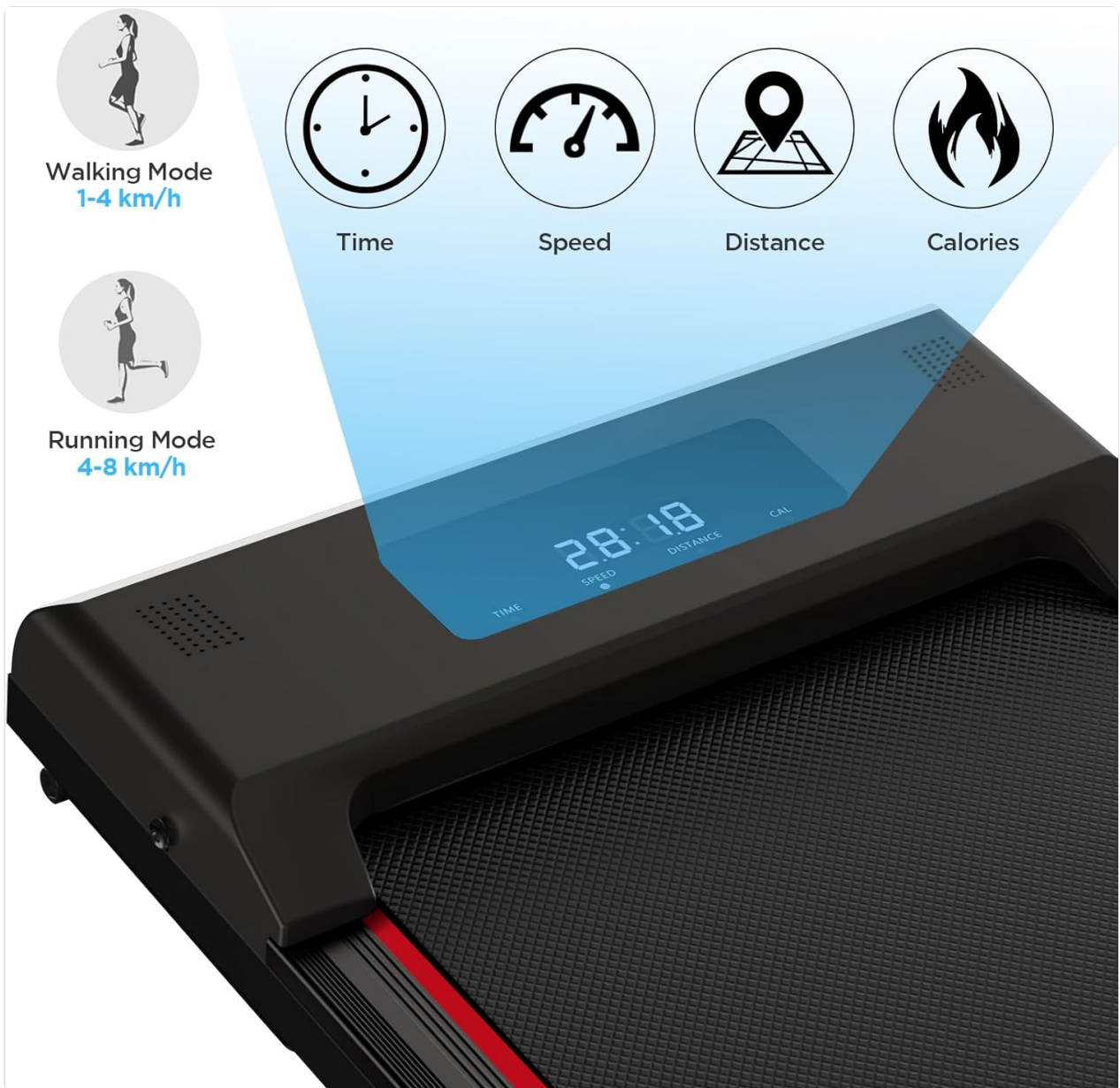
Image: The treadmill's LCD display showing workout data such as Time, Speed, Distance, and Calories. Illustrations indicate a walking mode (1-4 km/h) and a running mode (4-8 km/h).