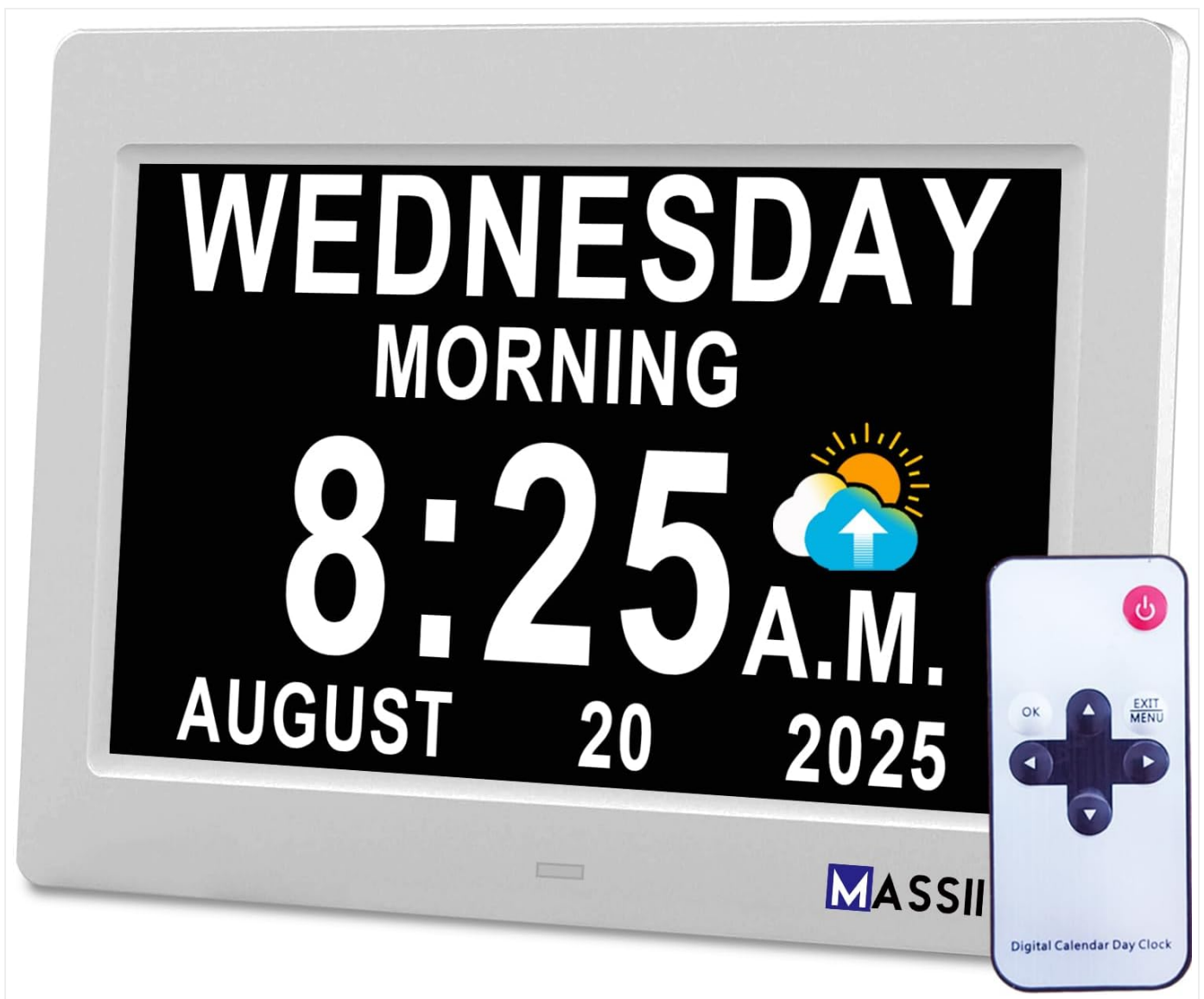
Figure 1.1: The MASSII Digital Talking Clock and its remote control. The clock displays "WEDNESDAY MORNING 8:25 A.M. AUGUST 20 2025" with a sun and cloud icon.