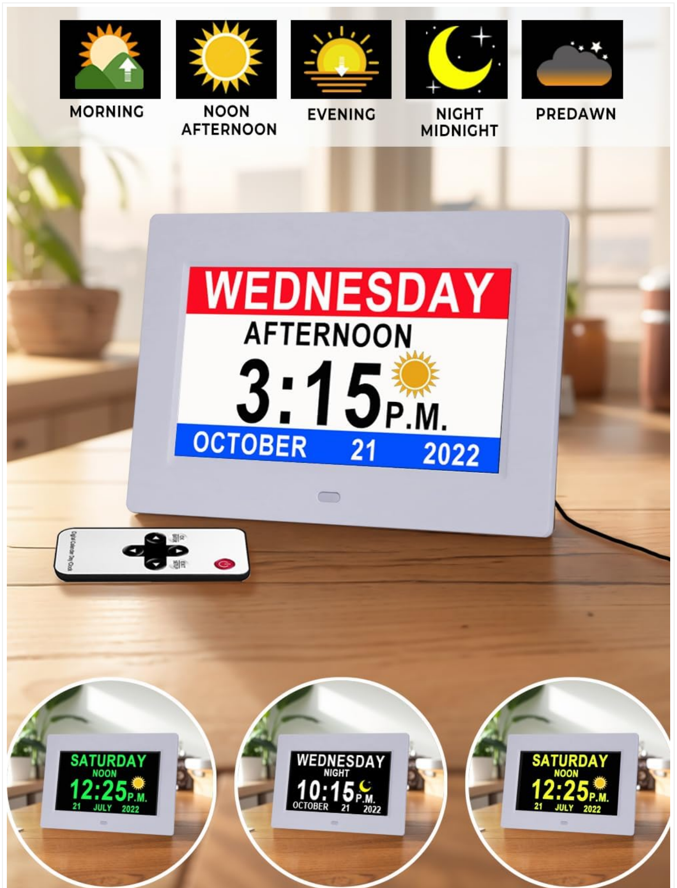
Figure 4.3: The clock displaying different visual themes and time-of-day indicators, including "WEDNESDAY AFTERNOON 3:15 P.M. OCTOBER 21 2022" and various color options.