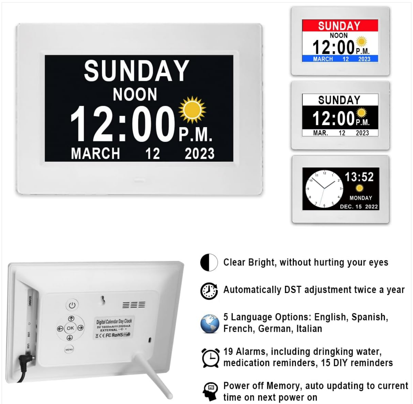
Figure 2.2: Rear view of the clock, showing the power input, control buttons, and the retractable stand for table placement.