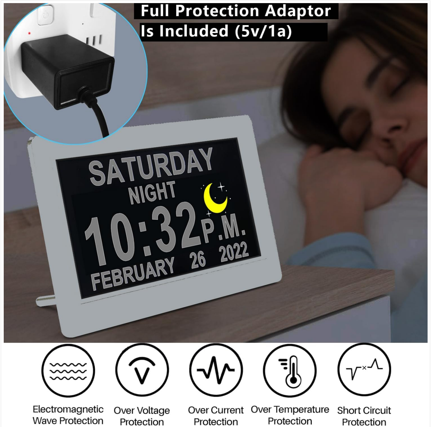
Figure 4.2: The clock displaying "SATURDAY NIGHT 10:32 P.M. FEBRUARY 26 2022" with a moon icon, illustrating its dimming capability for nighttime use.