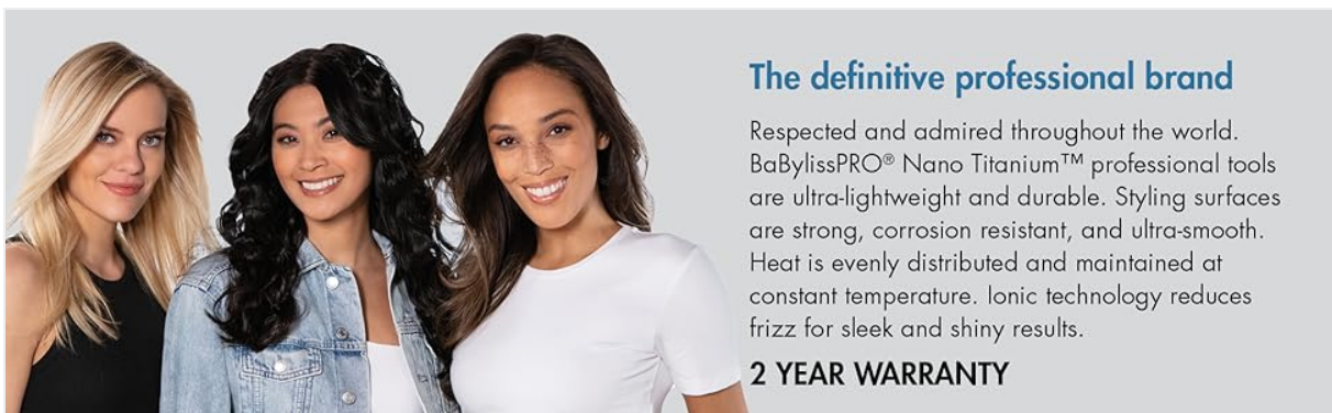
Image 2: Key features of the BaBylissPRO Nano Titanium Extended Barrel Curling Iron.