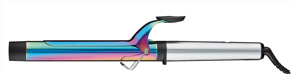
Image 1: The BaBylissPRO Nano Titanium Professional Curling Iron, 1 1/4 inch, in iridescent finish.

Thank you for choosing the BaBylissPRO Nano Titanium Professional Curling Iron. This appliance is designed to provide professional-grade hair styling with advanced technology for optimal results. Please read this manual thoroughly before use to ensure safe and effective operation.