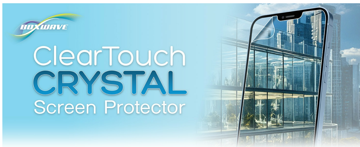
Image: The ClearTouch Crystal Screen Protector offers 99% transparency for clear screen protection.

The BoxWave ClearTouch Crystal Screen Protector is designed to provide superior protection for your INNOCN Ultrawide Monitor 34C1Q (34 inch) while maintaining optimal screen clarity and color vibrancy. This instruction manual will guide you through the installation process, usage, maintenance, and provide troubleshooting tips to ensure the best performance from your screen protector.