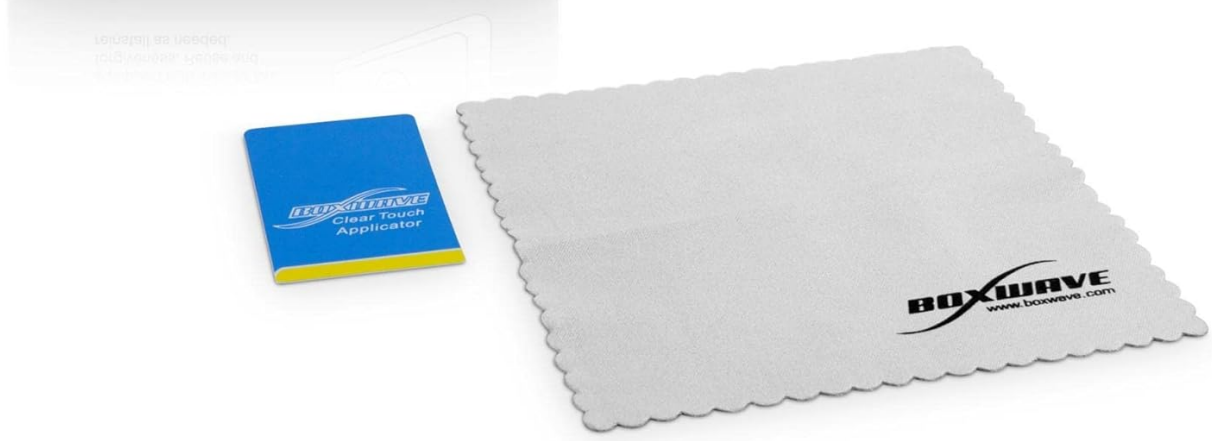
Image: The screen protector ensures high definition clarity, preserving original screen quality.