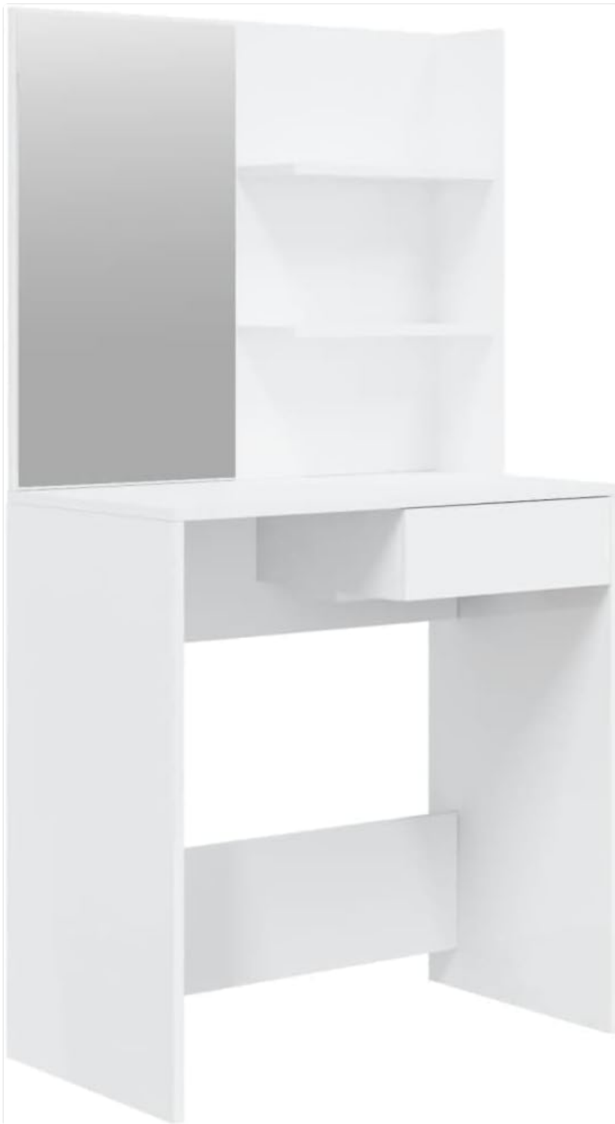
Figure 1: Front view of the vidaXL Dressing Table with Mirror.