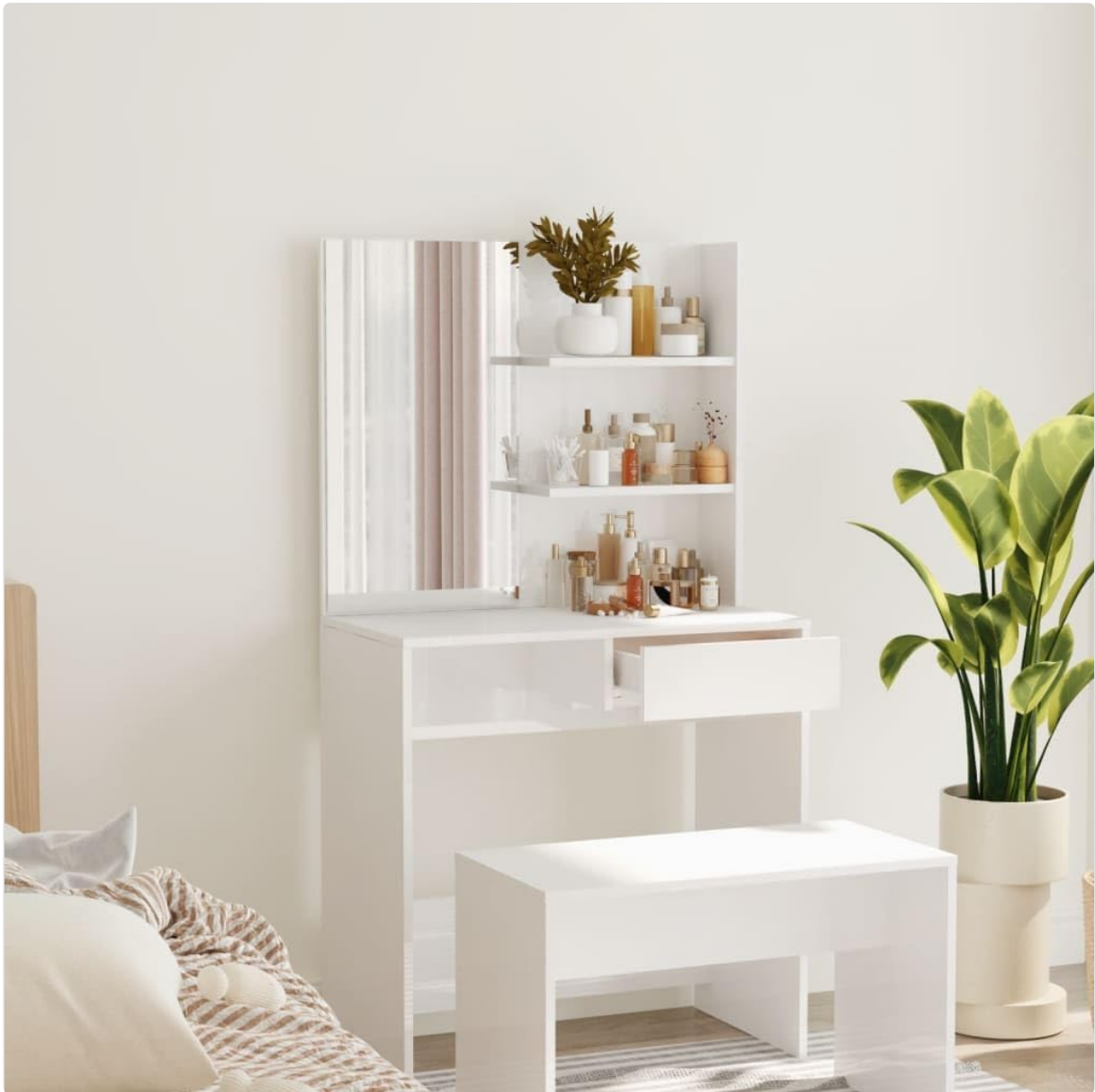
Figure 5: The dressing table integrated into a room, demonstrating typical usage.