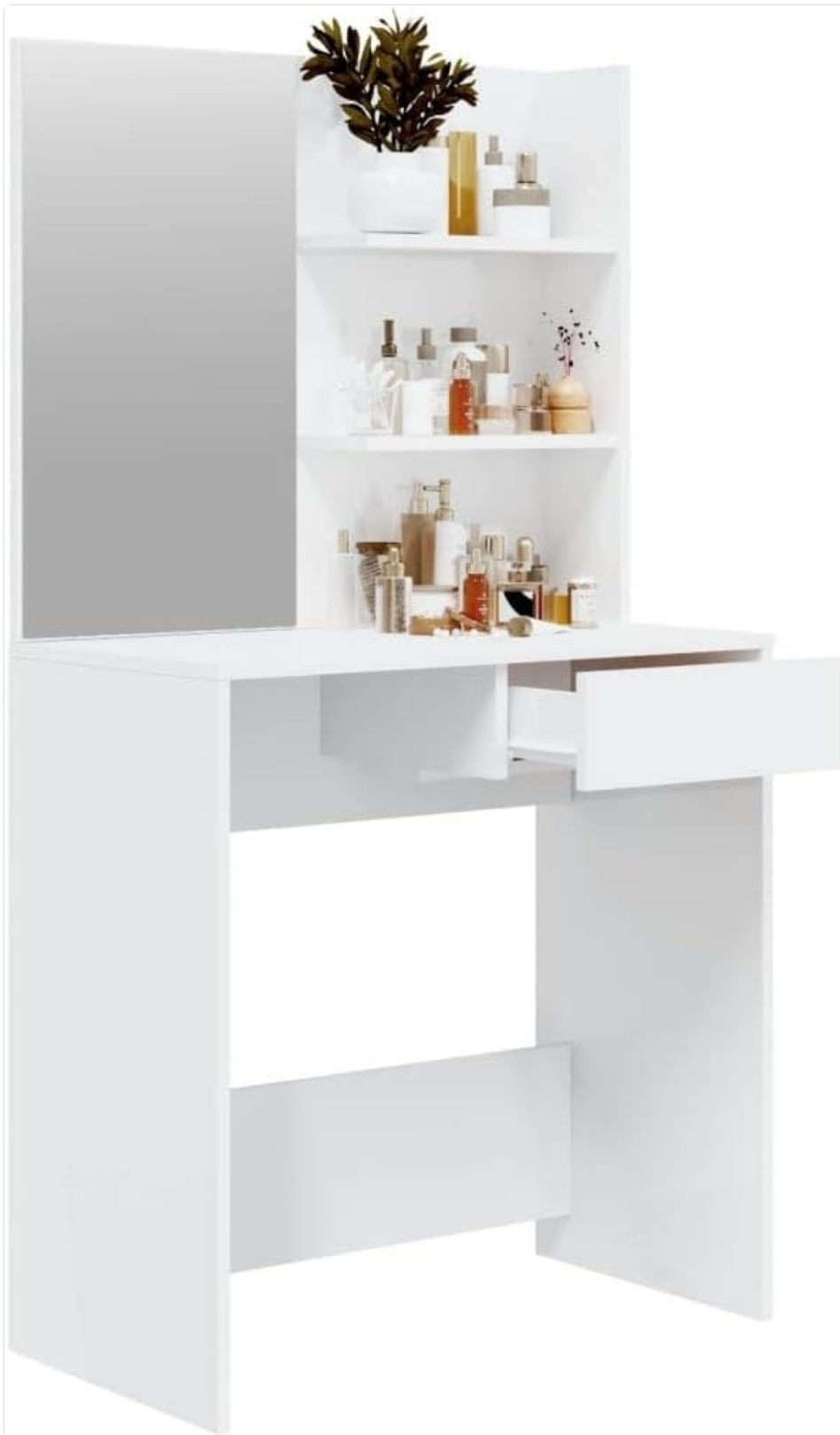
Figure 4: The dressing table with its single drawer partially open, revealing storage space.