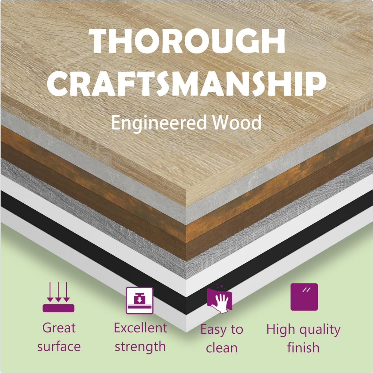
Figure 6: Illustration of the engineered wood material, highlighting its smooth surface and durability for easy cleaning.