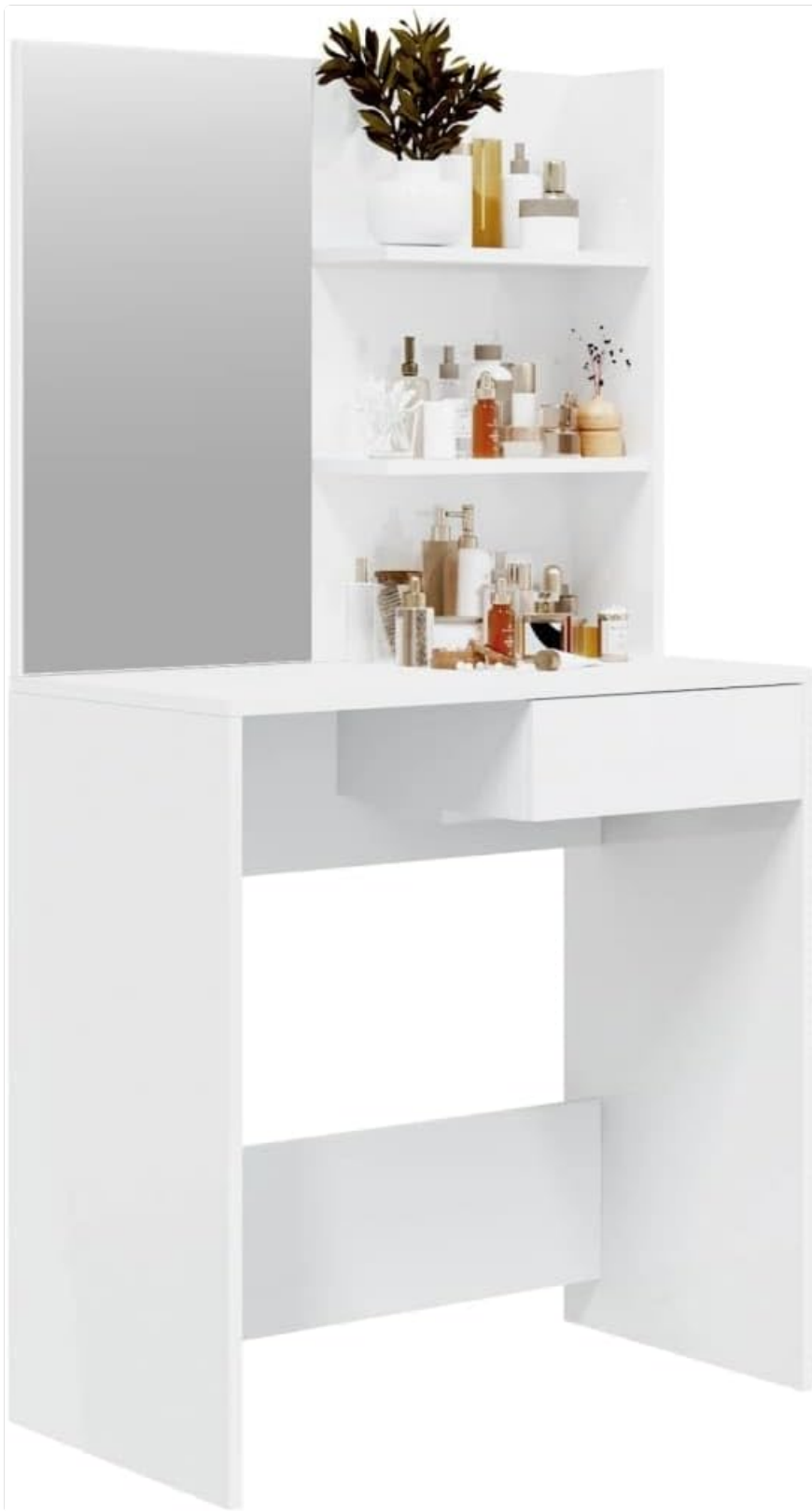
Figure 3: The dressing table showcasing its mirror, shelves, and tabletop with items.