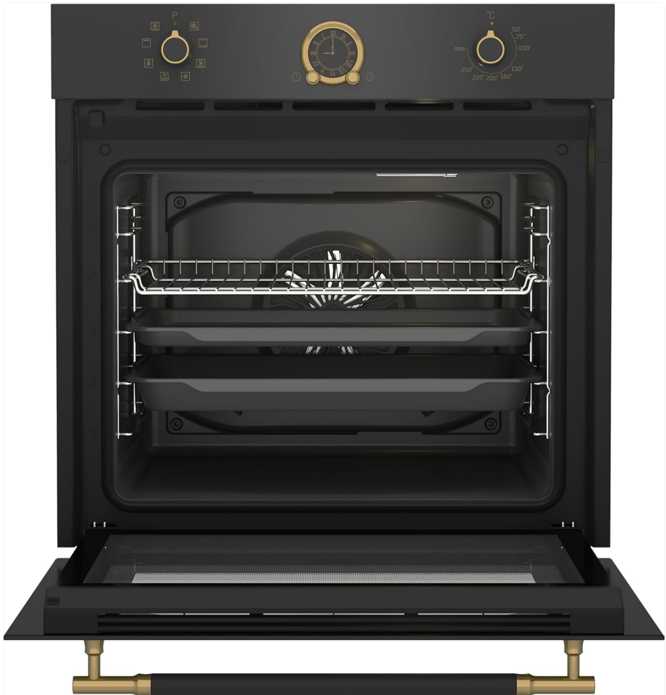
Figure 3: Oven Interior. This image shows the oven with its door fully open, revealing the spacious 72-liter interior, multiple rack positions, and included baking trays.