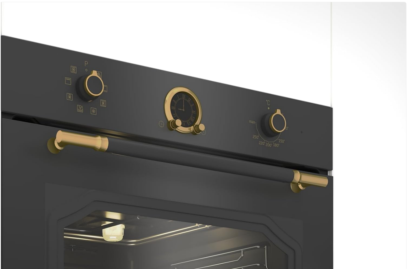
Figure 1: Oven Control Panel. This image shows a close-up of the oven's control knobs, including the function selector, temperature control, and the central analog clock.

Your Beko RBIM19200AD oven is equipped with intuitive controls for various cooking functions.