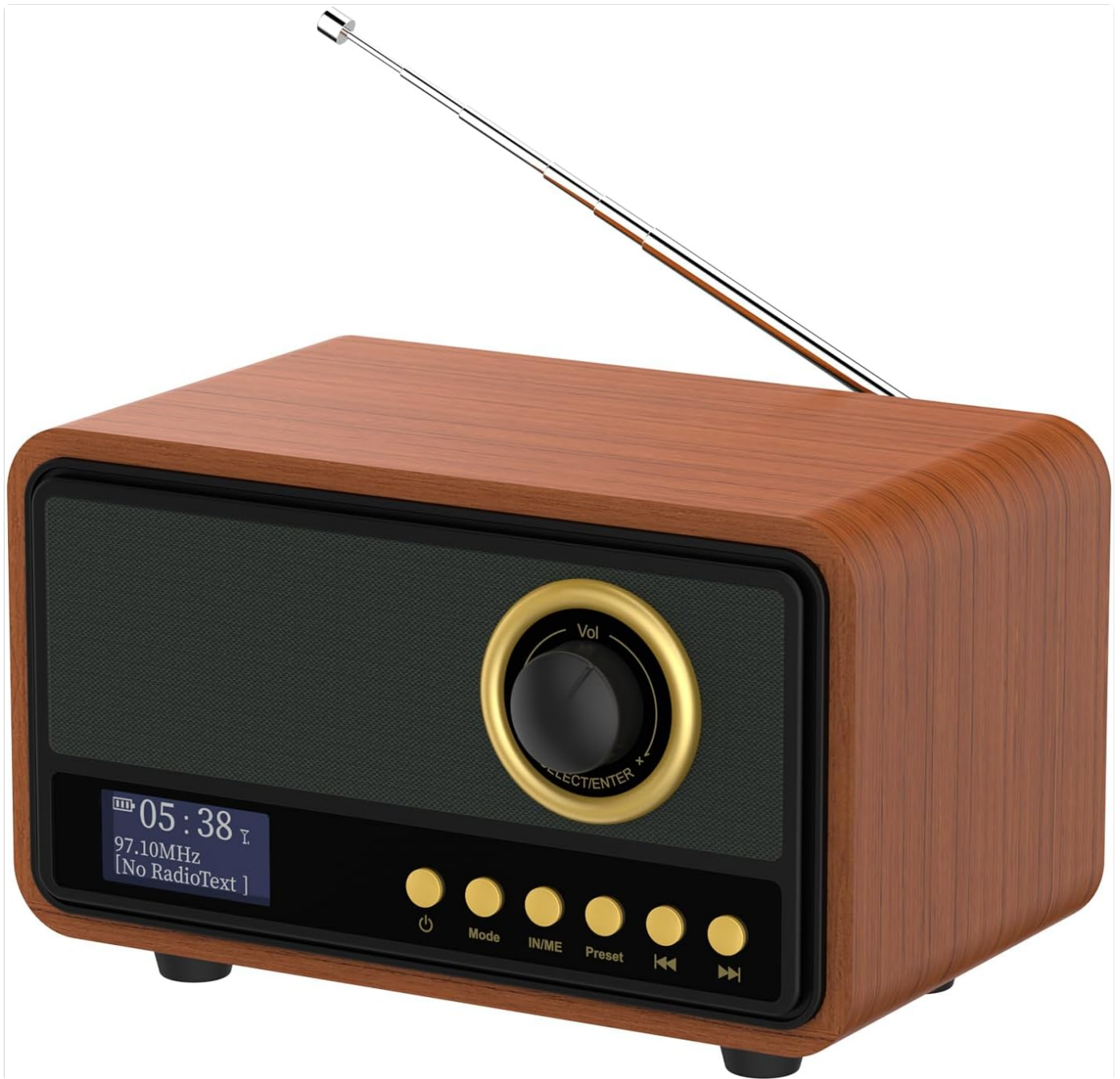
Figure 1: Front view of the Mycket Digital DAB/DAB+ Radio, showcasing its wood finish, display screen, and control buttons.