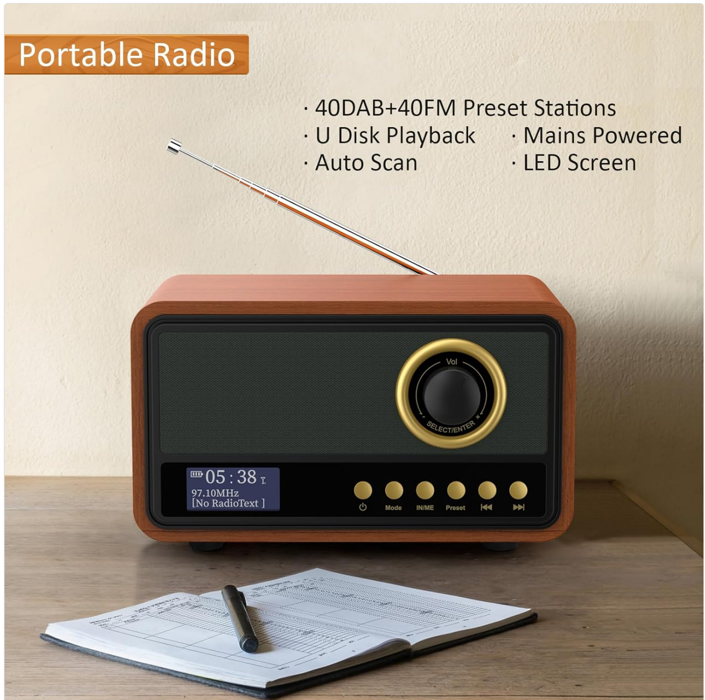
Figure 3: The portable radio with its key features highlighted, including 80 preset stations and an LED screen.