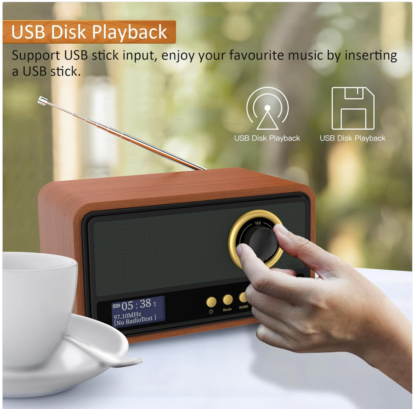
Figure 4: Demonstrating USB Disk Playback functionality, allowing users to enjoy music from a USB stick.

Insert a USB flash drive (U disk) containing audio files into the radio's USB port. Switch the radio to U Disk mode to play music directly from the drive. The radio supports various audio formats.