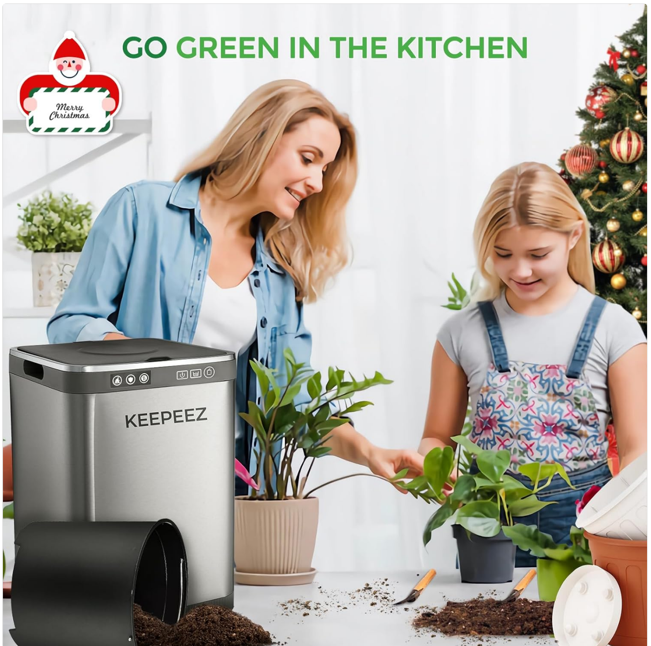
Image: Composted material from the KEEPEEZ composter being used to enrich soil for plants.