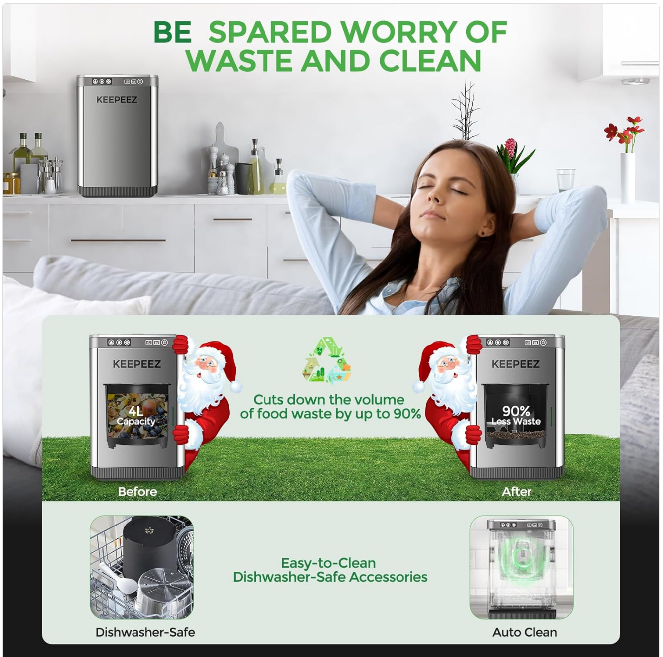
Image: Visual representation of the composter's dishwasher-safe accessories and auto-clean feature.