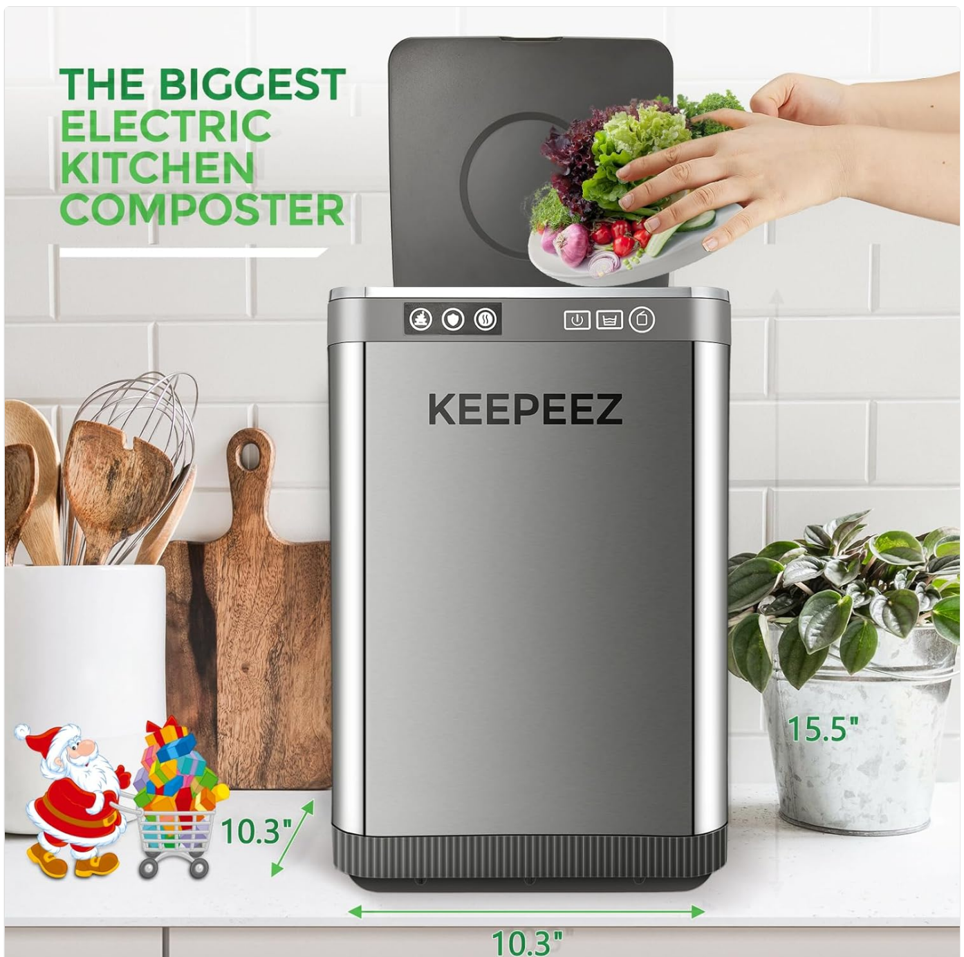
Image: The KEEPEEZ Electric Composter with key dimensions (10.3" width, 15.5" height) highlighted.