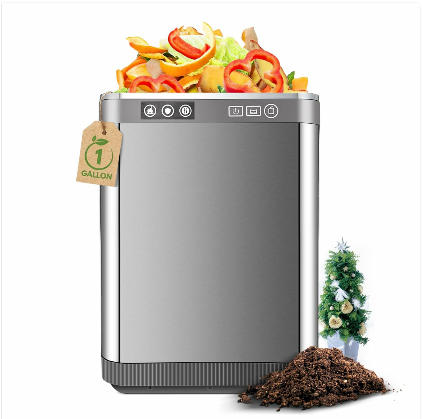
Image: The KEEPEEZ Electric Composter, a compact countertop appliance.