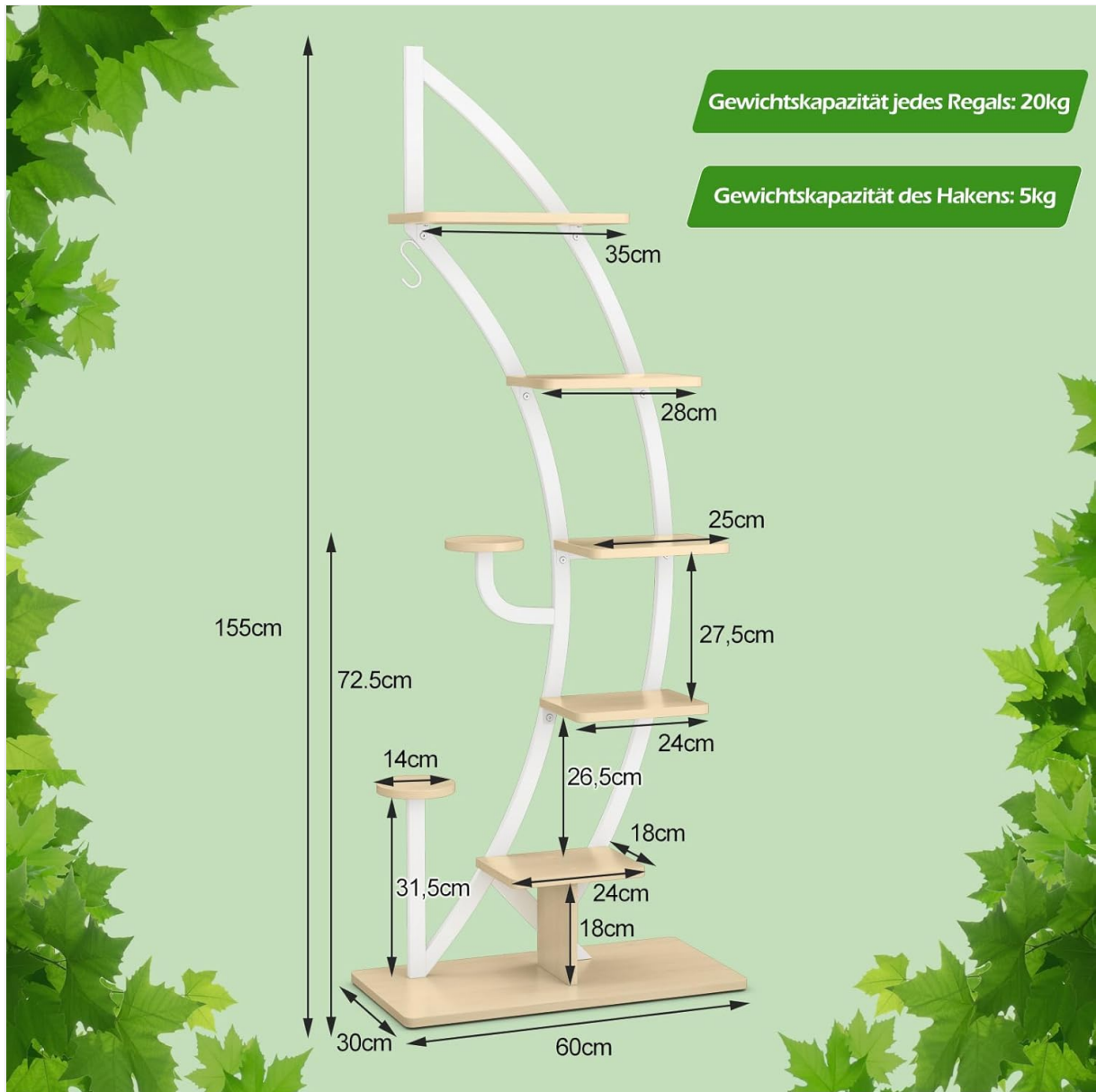
Figure 5: Product Dimensions. This diagram provides detailed measurements of the plant stand, including height, width, depth, and individual shelf dimensions.