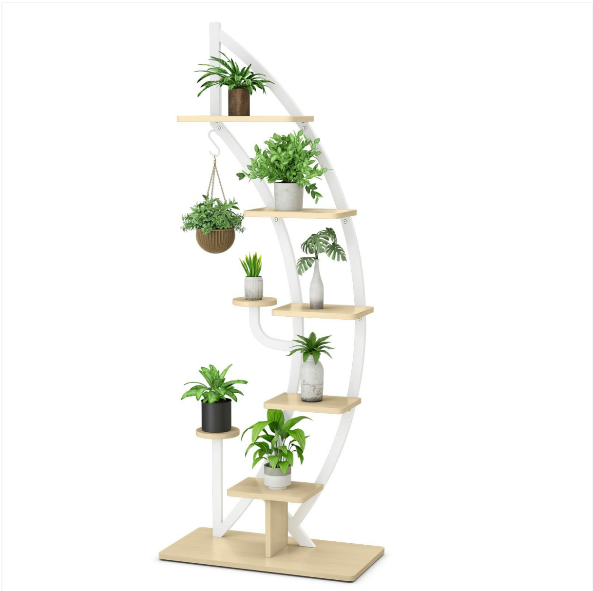
Figure 2: Assembled Plant Stand. This image shows the fully assembled plant stand, ready for use, displaying its half-moon design and multiple tiers.