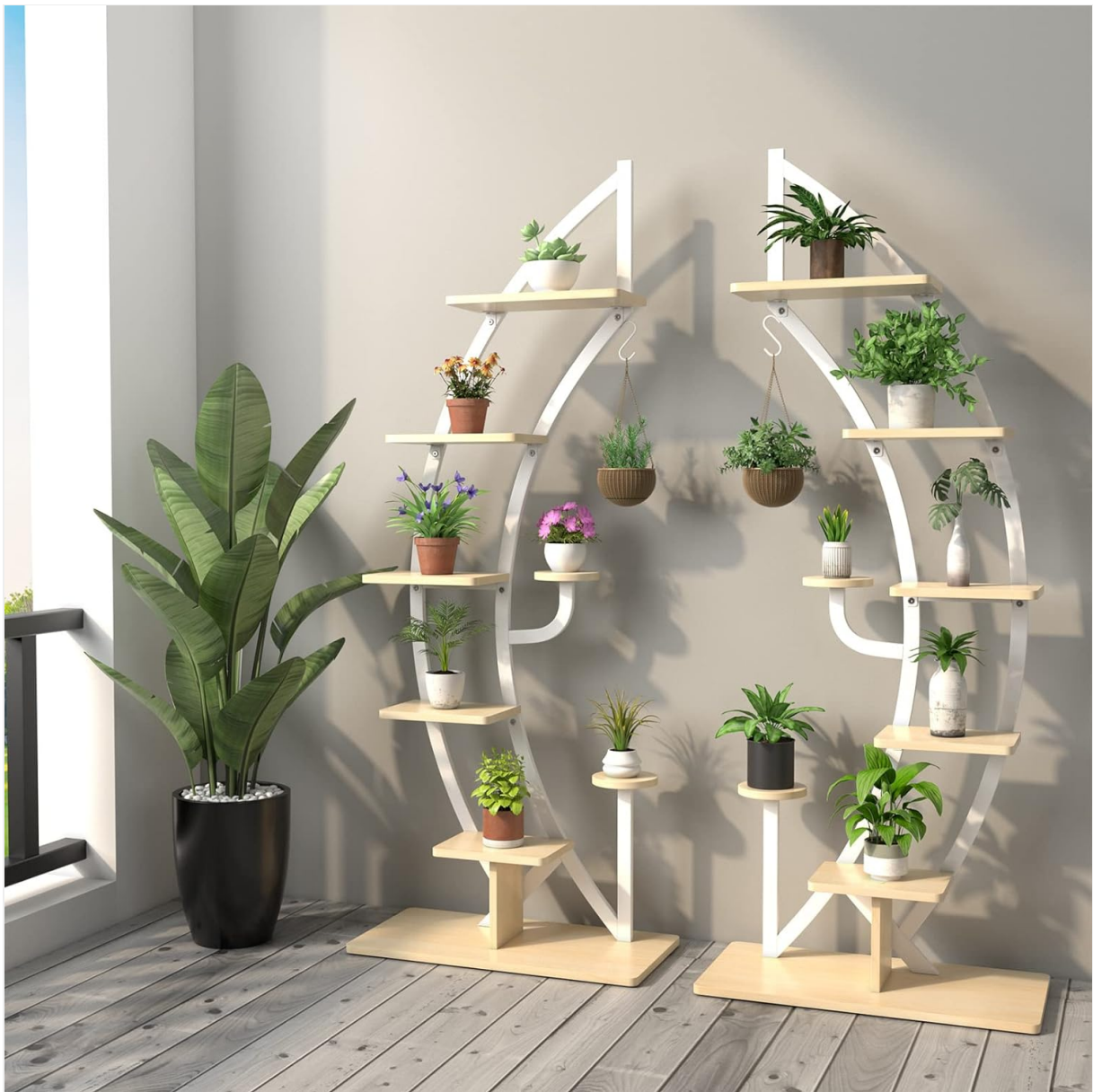
Figure 4: Combined Display. This image shows two half-moon plant stands arranged together to create a complete circular display, offering an expanded and symmetrical presentation.