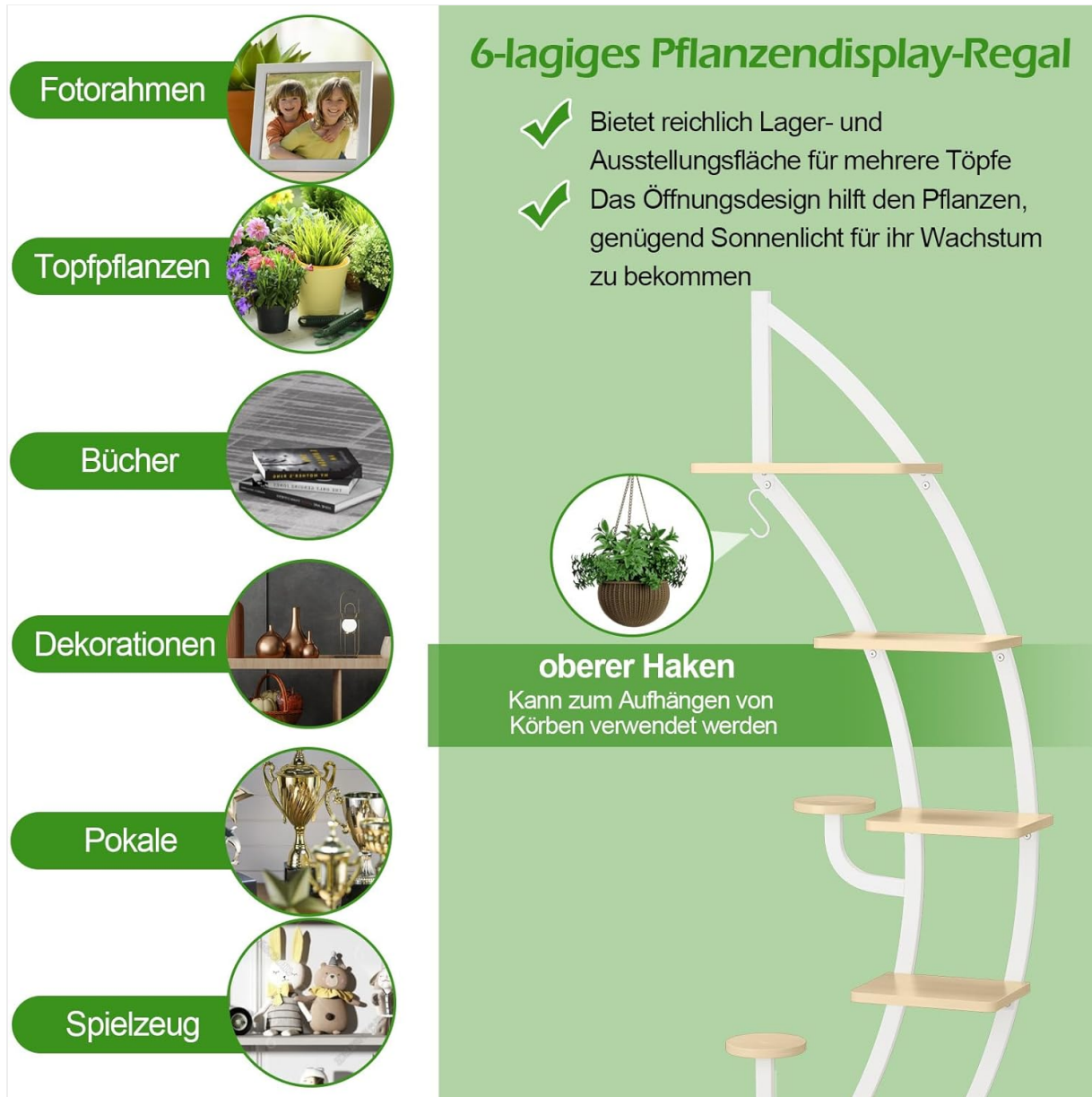
Figure 3: Versatile Usage. This image demonstrates how the plant stand can be used to display a variety of items, including potted plants, books, and decorative objects.