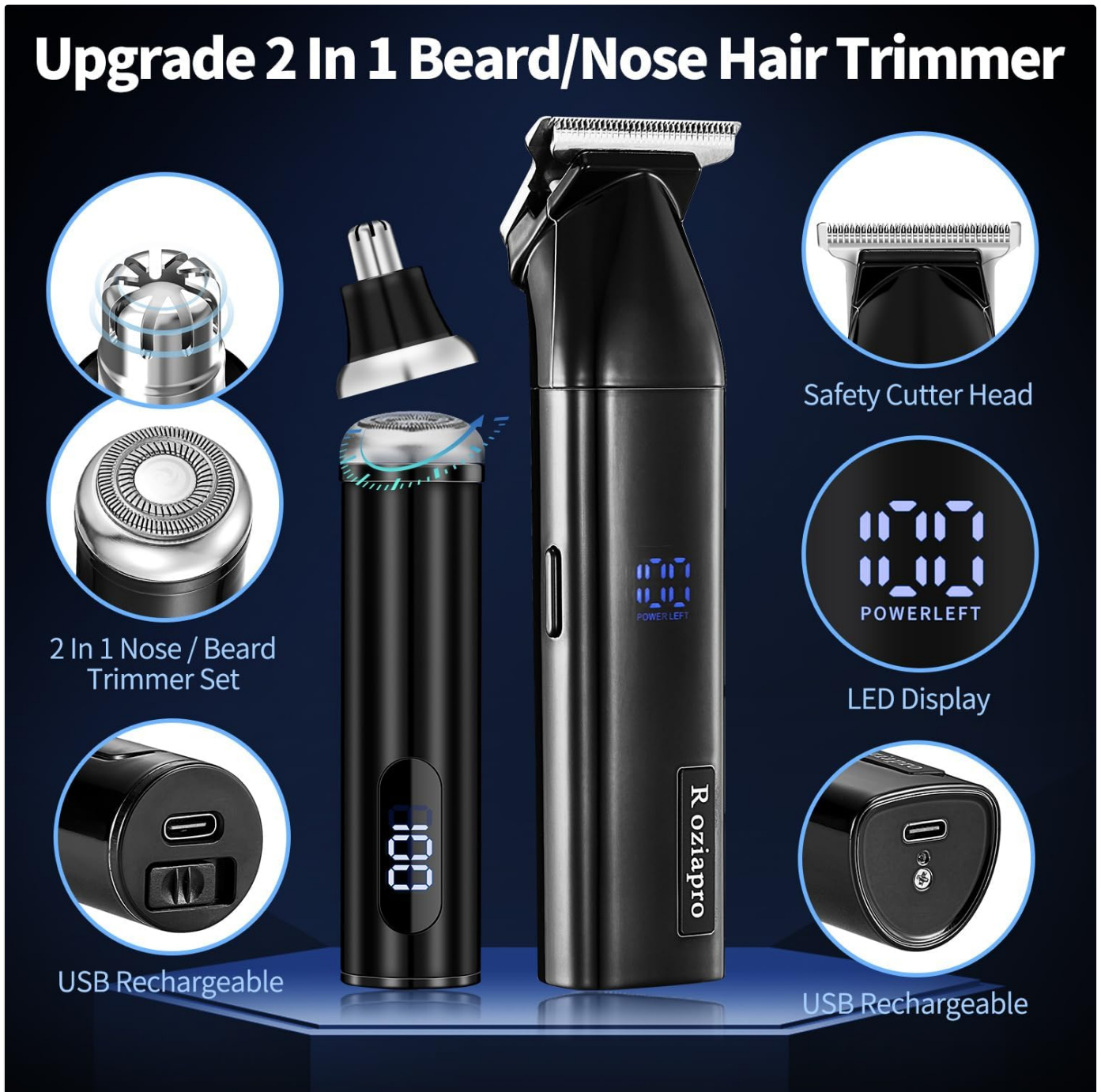
Figure 3: Interchangeable heads for the nose/beard trimmer and adjustable blade on the main clipper.