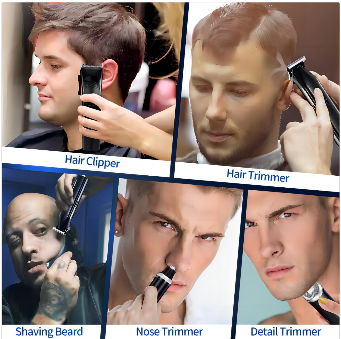
Figure 4: Examples of using the hair clipper, T-blade trimmer, nose trimmer, and shaver.