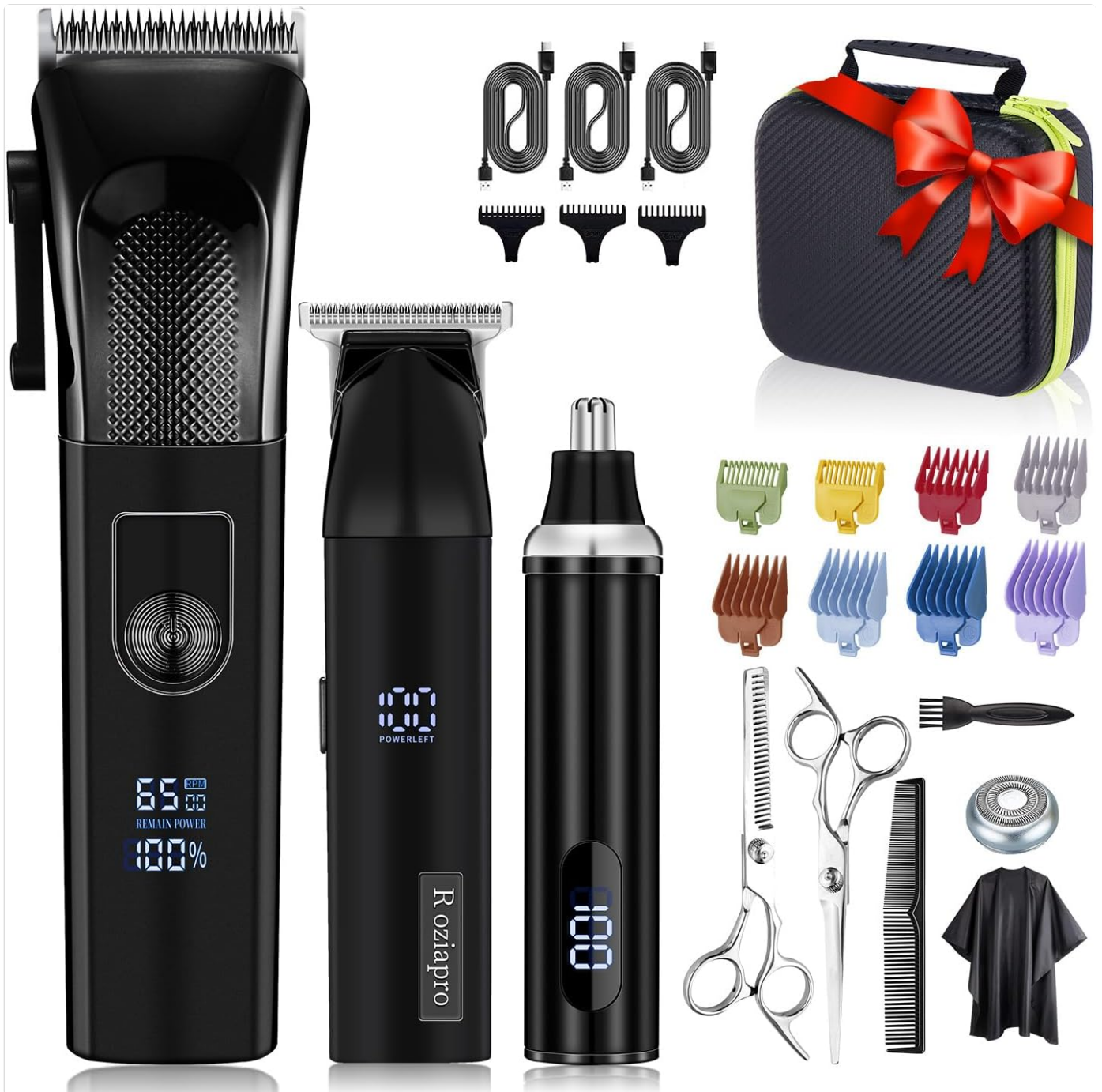
Figure 1: All components included in the Roziapro Hair Clippers Kit.