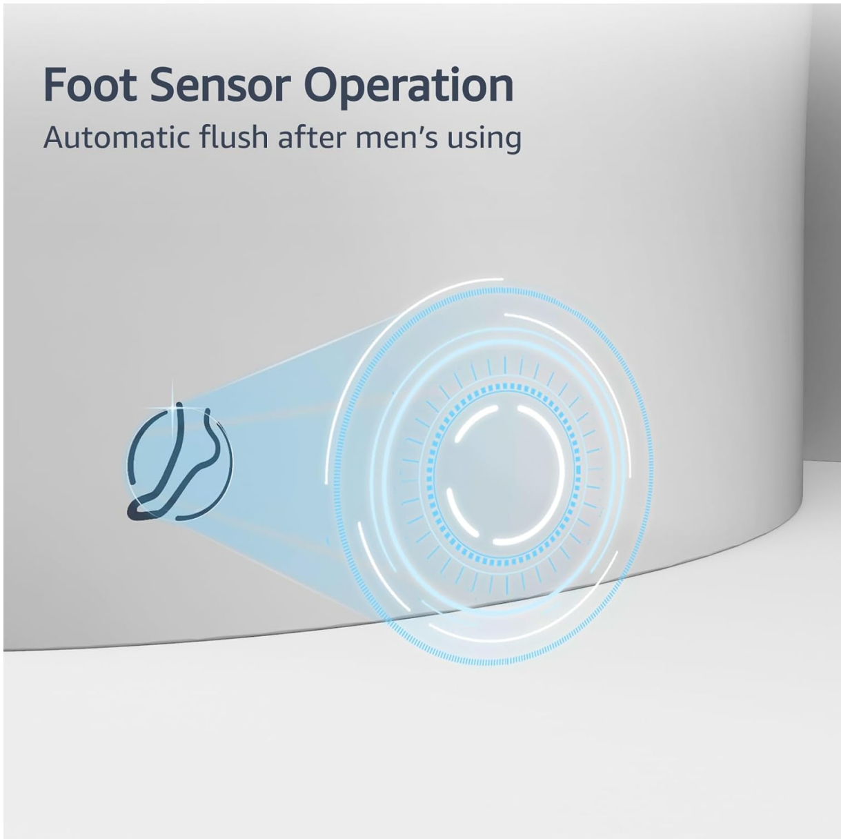
Image: Foot Sensor Operation. This diagram shows the activation area for the foot sensor, enabling automatic flushing.

Video: Smart Toilet Features in Action (Foot Sensor). This video demonstrates the foot sensor in action, showing how it triggers the auto-flush function.