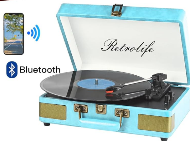
Image: The record player demonstrating its Bluetooth wireless capability.

Enjoy music from your phone and other devices