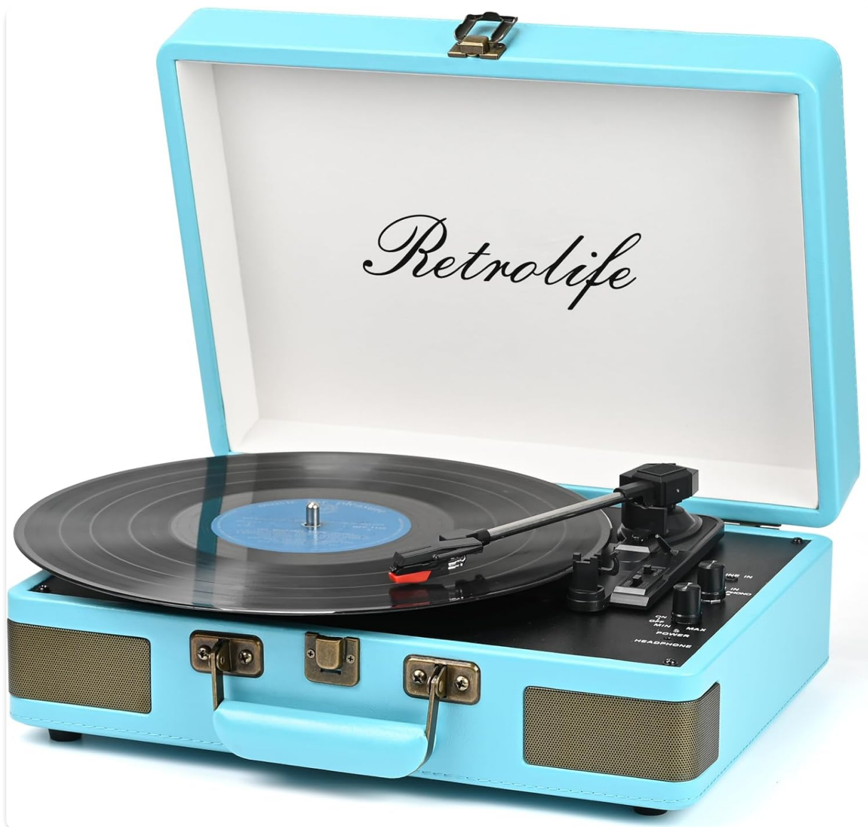
Image: The Retrolife R610 record player in blue, open and ready to play a vinyl record.