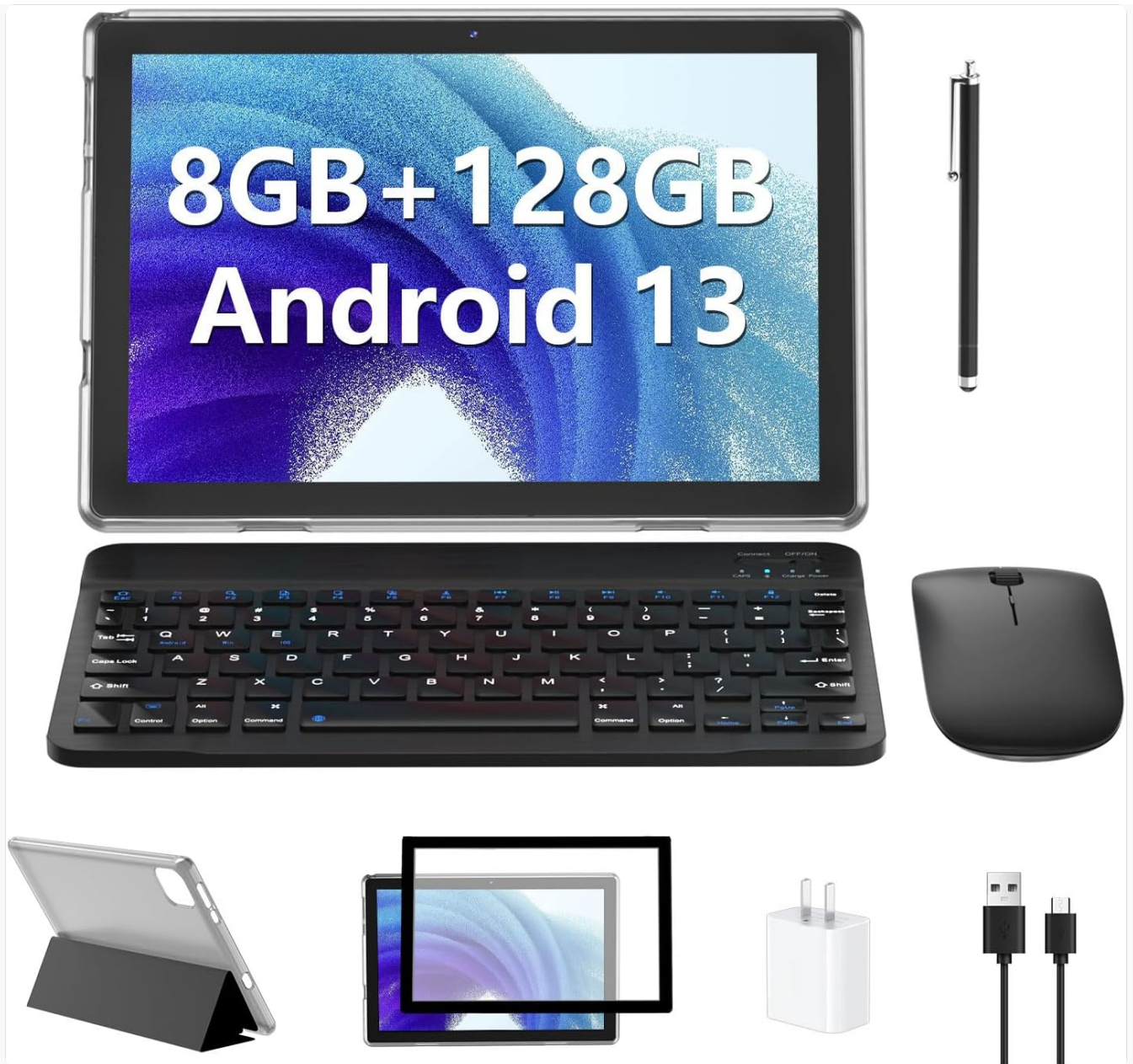
Image: The ECOPAD Android Tablet shown with its accompanying keyboard, mouse, and stylus, highlighting its 2-in-1 functionality.