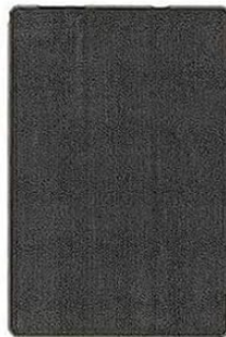
Protective Case *1