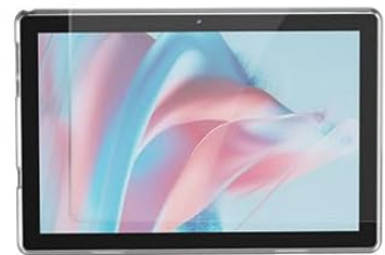
Screen Protector *1