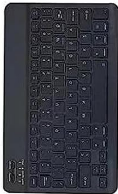
Bluetooth Keyboard *1