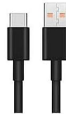
Type C Charging Cable *1

Image: An illustration highlighting the tablet's 6000mAh battery capacity, 5V/2A charging, and Type-C charging port, emphasizing long-lasting power.