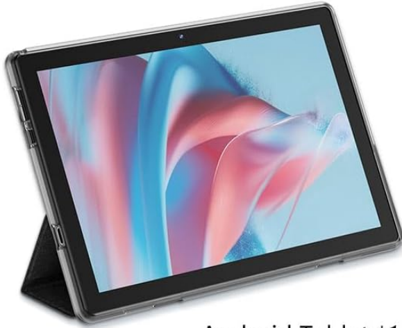
Android Tablet *1