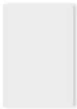
User Manual *1