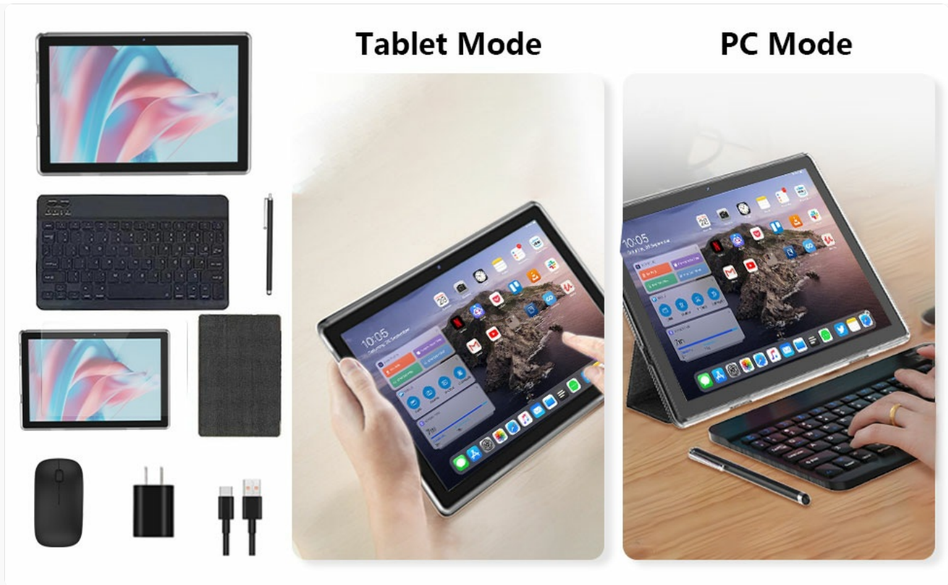
Image: A visual representation of all items included in the ECOPAD Tablet package, neatly laid out.