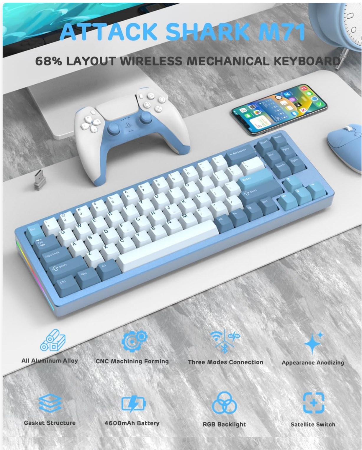
Image: The ATTACK SHARK M71 keyboard showcasing its compact layout and RGB lighting.