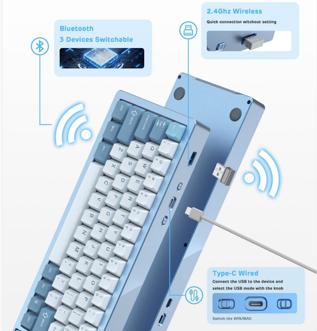
Image: Close-up of the ATTACK SHARK M71 keyboard showing the hot-swappable switches.