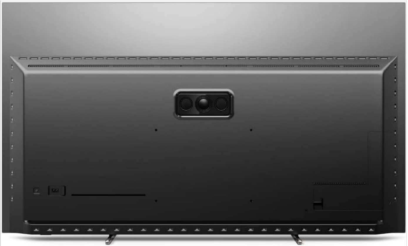
Image: Rear view of the Philips 77OLED807/98 TV, illustrating the placement of HDMI, USB, and other connectivity ports. This view helps in identifying where to connect external devices.

Connect your external devices such as Blu-ray players, game consoles, sound systems, and antennas to the appropriate ports on the back of the TV.