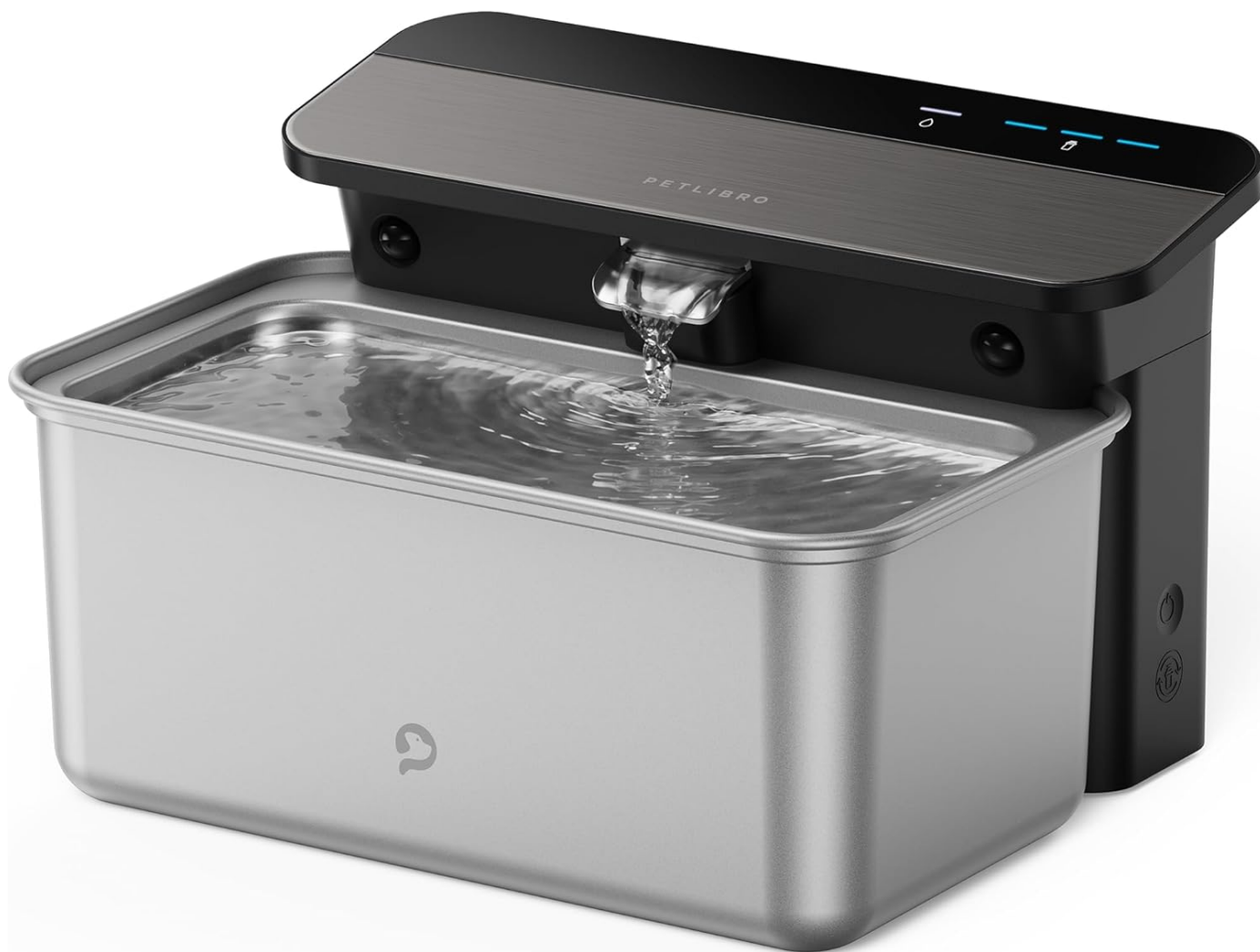
Image: The PETLIBRO Glacier fountain showing its main components: the filtration unit, water tray, and water tank.

Carefully detach the filtration unit from the water tank. Then, remove the water tray from the tank.