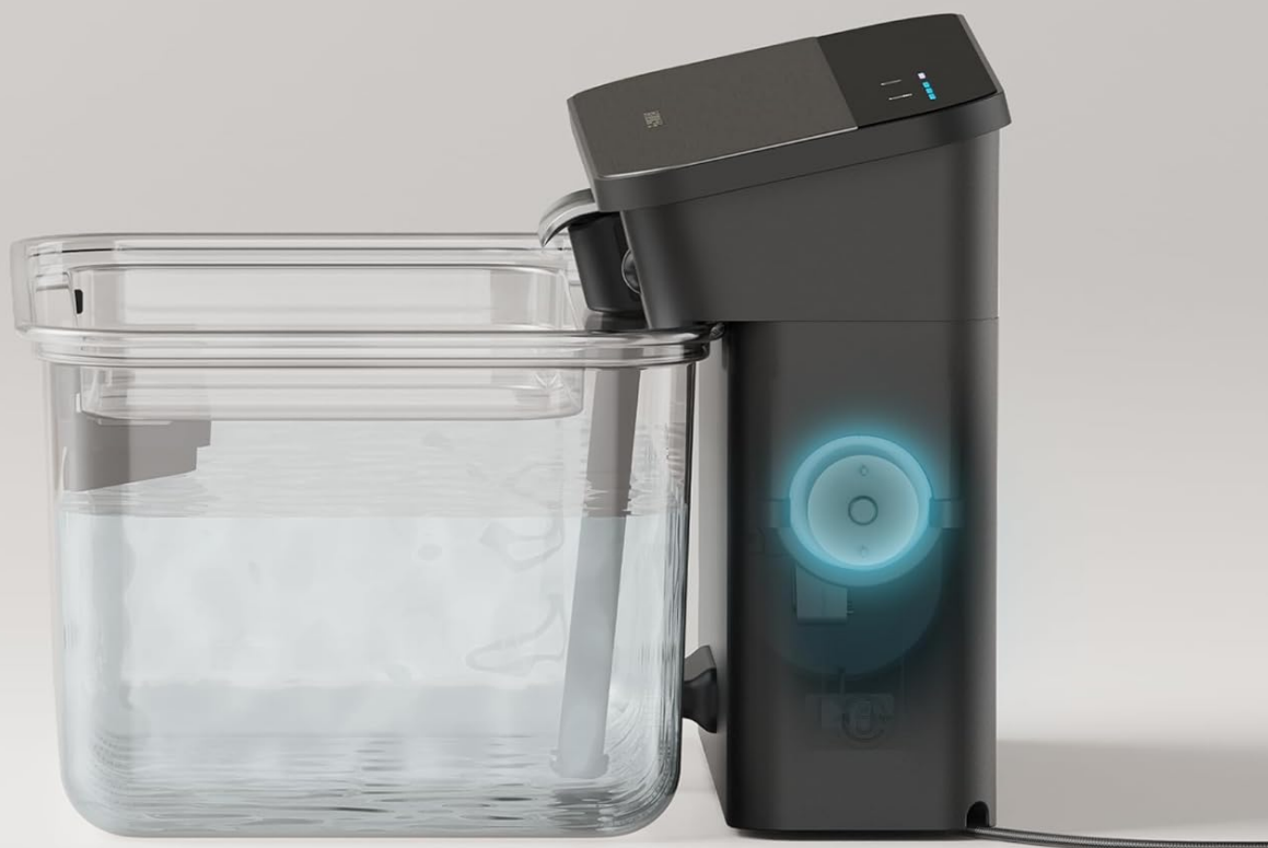
Image: An illustration showing the 60-day lifespan of the PETLIBRO ultrafilter, emphasizing its extended use.

Vacuum suction system keeps water away from electronic components