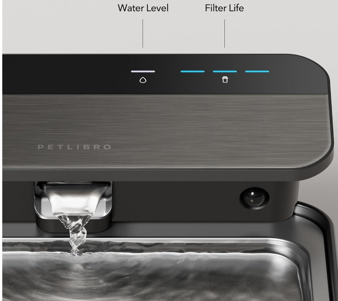
Image: Close-up of the PETLIBRO fountain's control panel, highlighting the water level and filter life indicator lights.

Know when refills and filter changes are needed with a simple glance