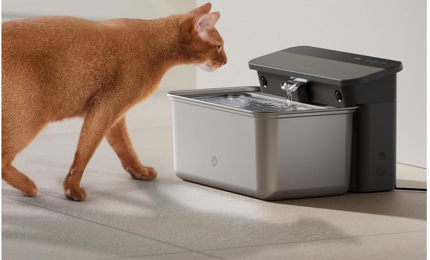
Image: The PETLIBRO fountain showing the motion sensor's detection range, indicating how it activates when a pet approaches.

For unyielding durability and pets' health