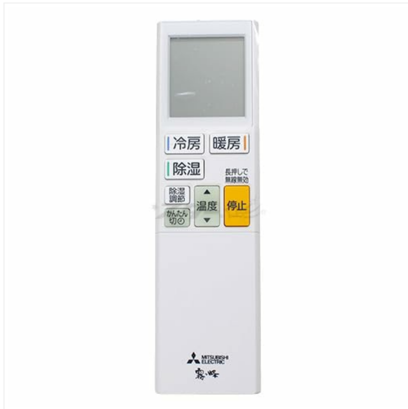
Image: Front view of the Mitsubishi Electric ADS223 remote control, showing the display and main buttons.