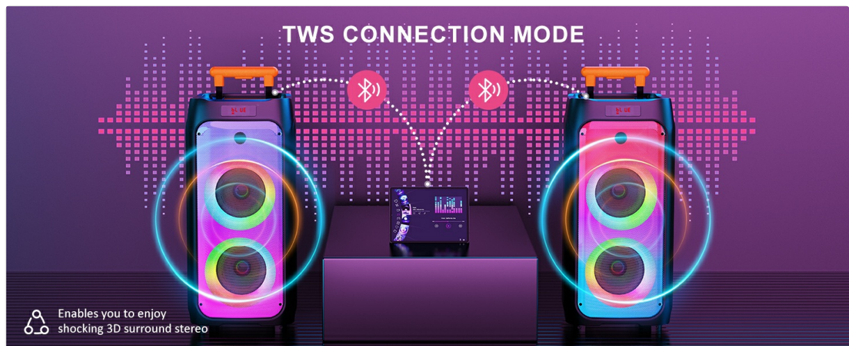
Image: TWS Connection Mode diagram.

This diagram illustrates how two HWWR T8 karaoke machines can be wirelessly connected via TWS (True Wireless Stereo) Bluetooth, enabling a synchronized stereo audio experience from a single source device.