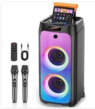
Image: HWWR T8 remote control.

This image displays the remote control for the HWWR T8, highlighting buttons for mute, single loop playback, and playing recorded audio, indicating its infrared sensor functionality.