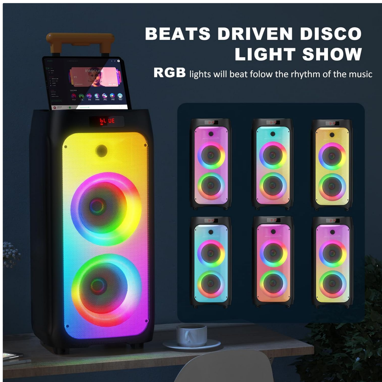
Image: HWWR T8 displaying various disco light patterns.

This image showcases the HWWR T8 karaoke machine with its dynamic RGB disco lights active, illustrating different color patterns and their synchronization with music.