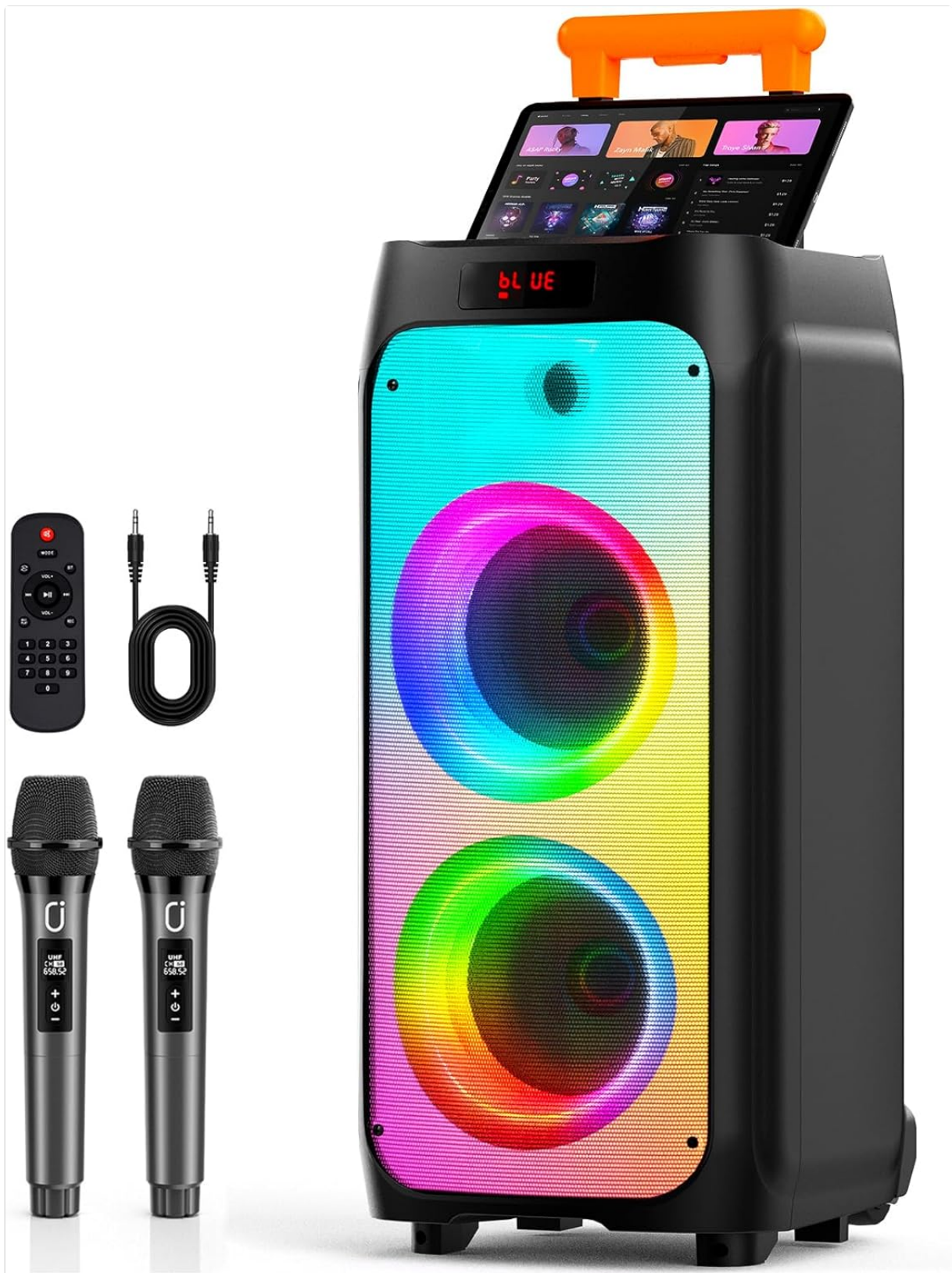
Image: HWWR T8 Karaoke Machine with two wireless microphones, remote control, and cables.

This image displays the main HWWR T8 Karaoke Machine unit, two wireless microphones, a remote control, and necessary connection cables, illustrating the complete package contents.