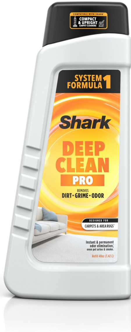
Image: A 48oz bottle of Shark CarpetXpert Deep Clean Pro Formula, ready for use.

Video: Demonstrates how to fill the Shark CarpetXpert's clean water tank with water and the Deep Clean Pro formula, preparing the machine for operation.