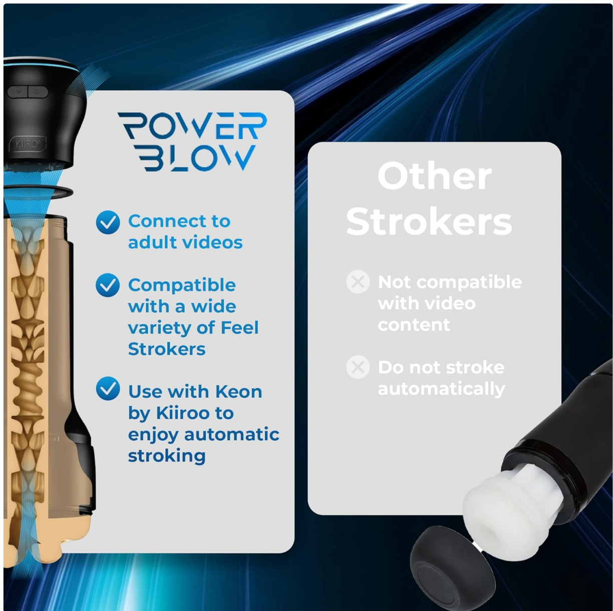
Image: The KIIRROO PowerBlow device shown alongside a laptop, illustrating its connectivity with interactive videos, VR, and webcam performers.