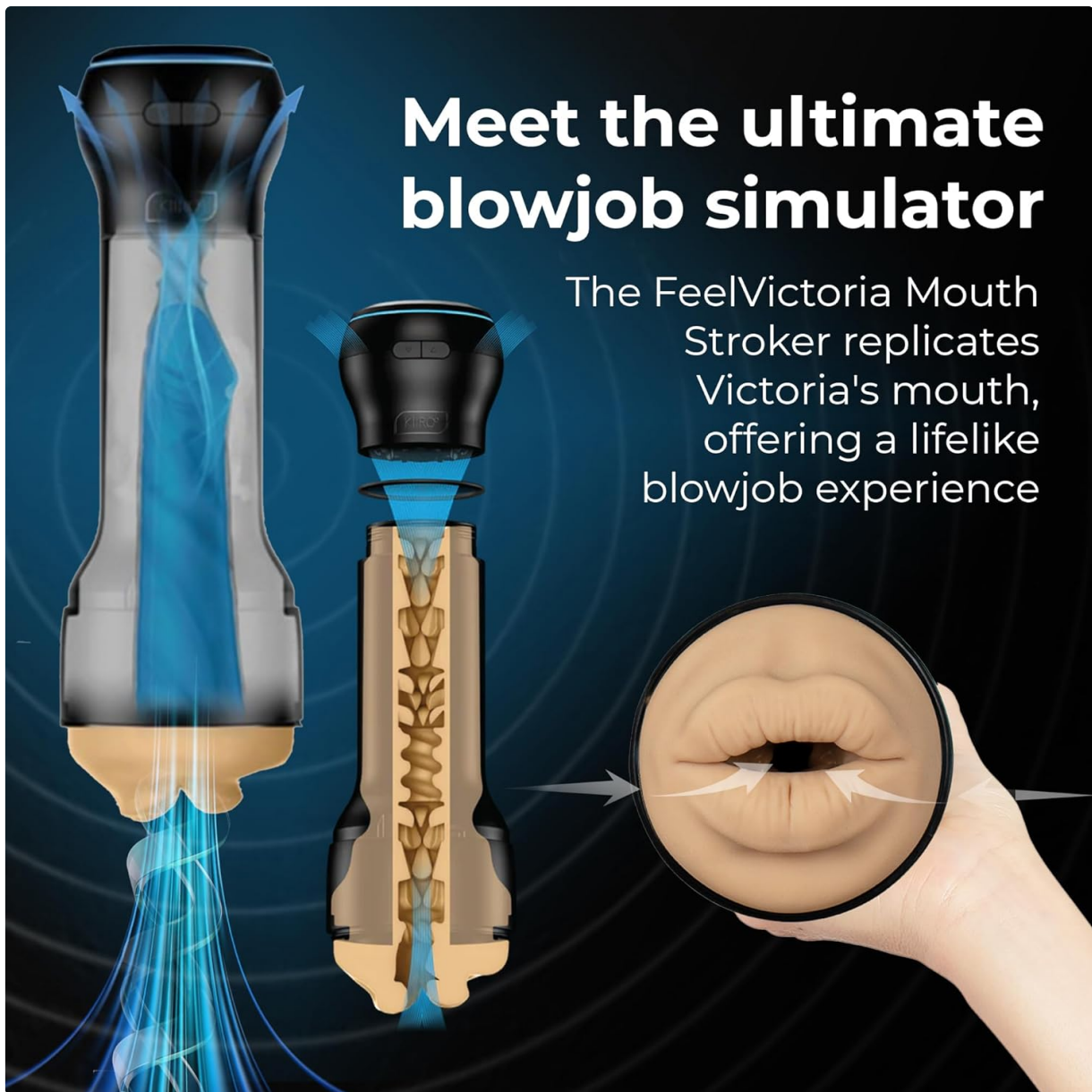
Image: An exploded view demonstrating how the PowerBlow unit connects to the Feel Stroker sleeve and casing.