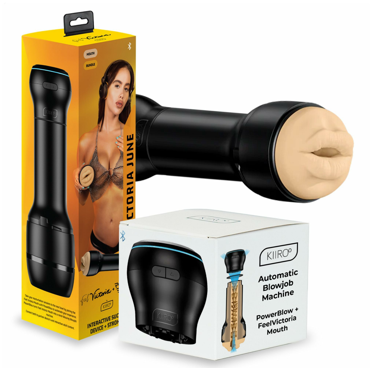
Image: The KIIRRO PowerBlow device highlighting its Bluetooth connectivity and app control features.

appear in the list of available devices. Select it and follow any on-screen prompts to complete the pairing process.