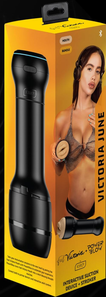
Image: All components included in the KIIROO PowerBlow package.